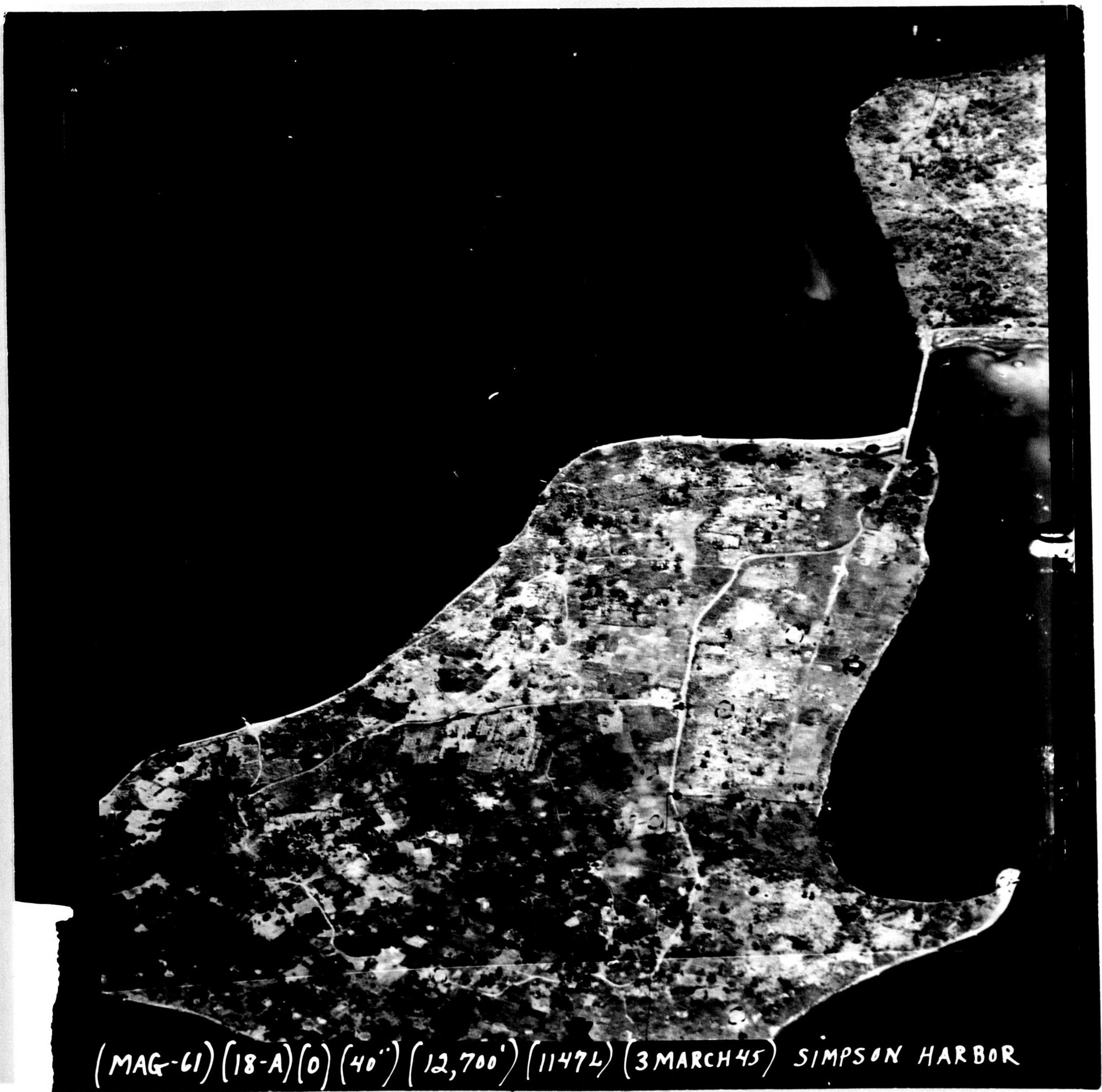
(MAG-61) (18-A) (0) (40") (12,700') (1149L) (3 MARCH 45) SIMPSON HARBOR