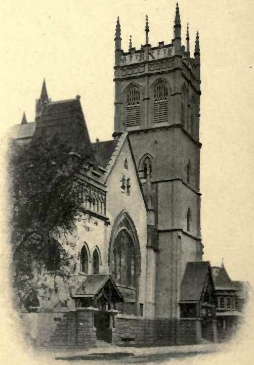
First Congregational Church