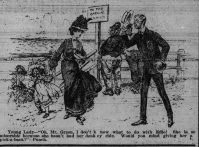
Young Lady—"Oh, Mr. Green, I don't know what to do with Effie! She is so miserable because she hasn't had her duck eye ticked." PUNCH.

Being asked one day what one should do in order to become an efficient piano player. Least replied laconically: "One must eat well and walk much." Ladies' Home Journal.