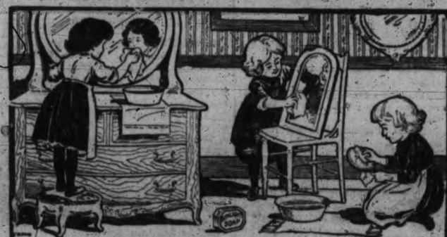
Sunlight Soap makes homes bright.