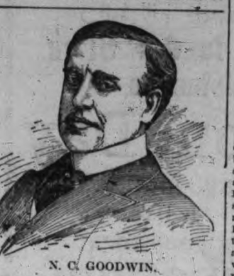
N. C. GOODWIN.

N. C. Goodwin is to play in this city on Monday evening next. No medium for the better display of his diversified talents could have been chosen than "The Altar of Friendship," which he will perform for the first time here, and in which he has achieved such great renown.