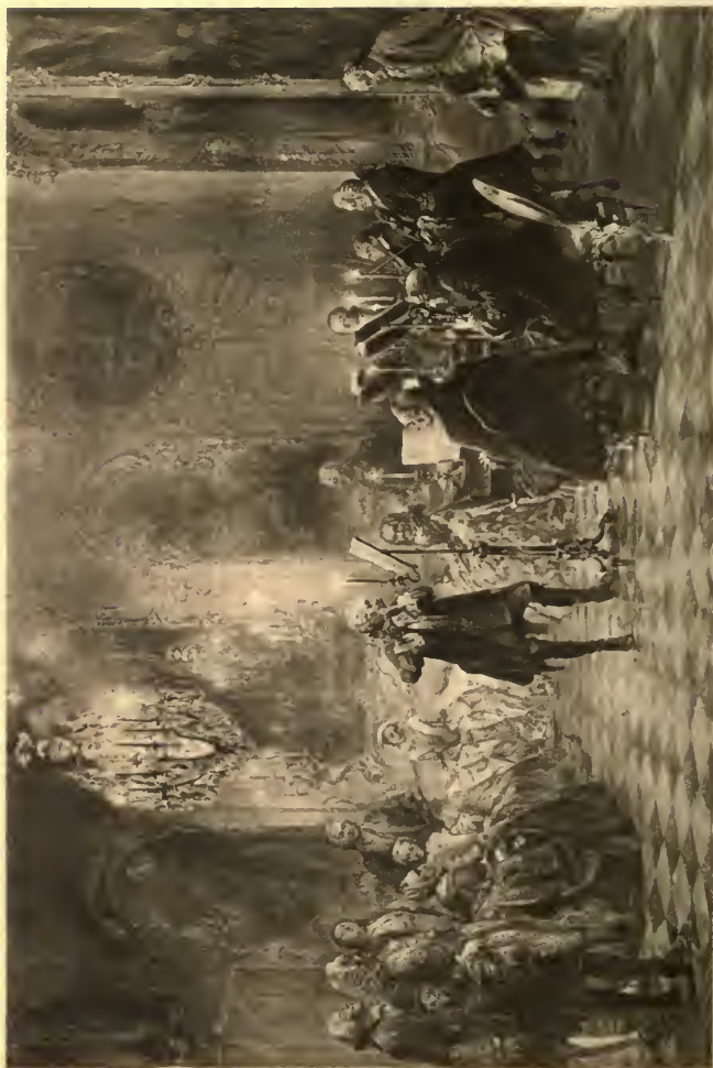
Il Appellato e il compagno