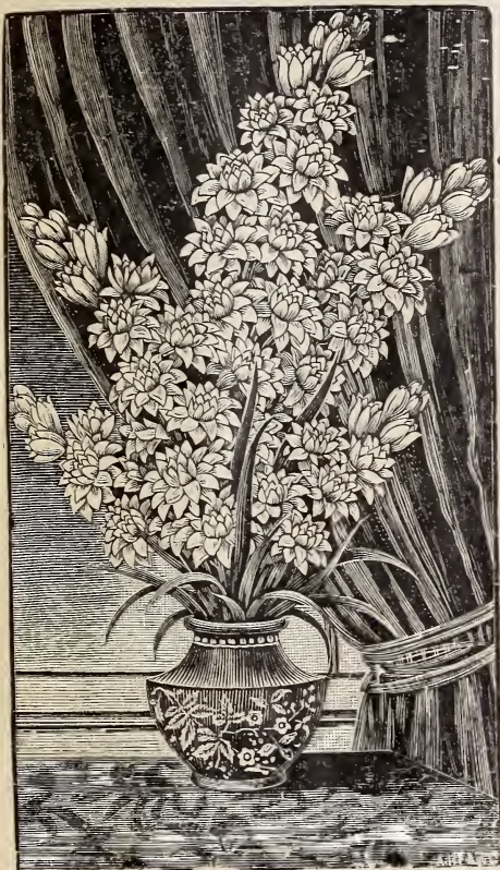
DOUBLE PEARL TUBEBOSE.

Plant in spring, covering the bulb so that the neck will be even with the surface of the soil.