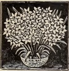
CHINESE SACRED LILY.