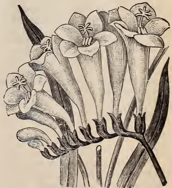
FRESIA REFRACTA ALBA.

Freesia refracta alba , (see cut) pure white, very handsome, possessing a peculiar grace of form and delightful fragrance, one pot of 5 or 6 bulbs being sufficient to perfume a whole house. Per doz. 10e; 100 70c.