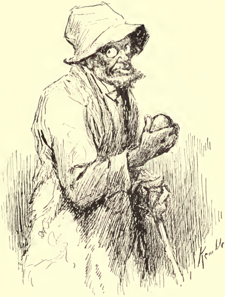
“Ol’ Marse Adam.”