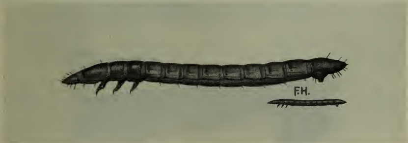
General appearance of wireworm enlarged and natural size (after Gibson and Twinn).