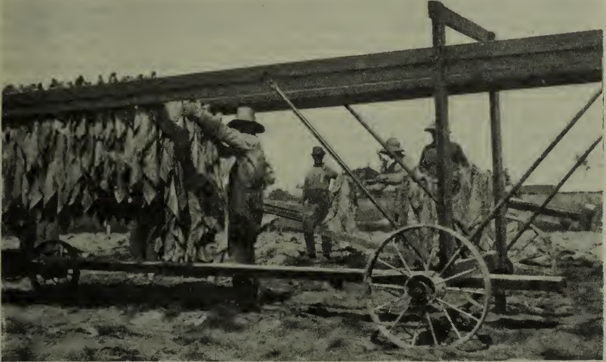
With a suitable wagon one man can load tobacco on the lath in the field.

From six to eight plants, depending on their size, may be placed on one lath and are drawn to the curing barn in special racks which are so constructed as to cause the minimum amount of damage during transit.