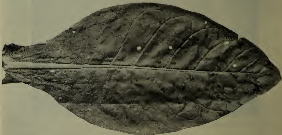
Angular leaf spot is sometimes known as blackfire. It is not so common as wildfire. Note the angular outline of the spots.