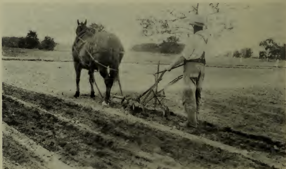
This type of cultivator should be used two to three days after transplanting.

Early cultivations are very important in the production of a good crop of tobacco, but so often the benefits derived are not fully appreciated. They, however, afford several distinct advantages and are deserving of more attention. In the first place, cultivation should begin within at least a week of setting out the plants, even before they have become well established. As a result the crop makes a better start because cultivation brings more air in contact with the soil particles. It not only warms but also stimulates activity in the soil, which makes the fertilizer more quickly available to the plant. In addition a mulch is provided which prevents the surface soil from drying out too rapidly. Another distinct advantage is in the control of weeds which sap the soil of plant food and moisture. Cultivation is profitable even when rains are lacking and should be done at regular intervals of six or eight days. In any case, a cultivation should be given as soon as the soil is friable, following each rain.