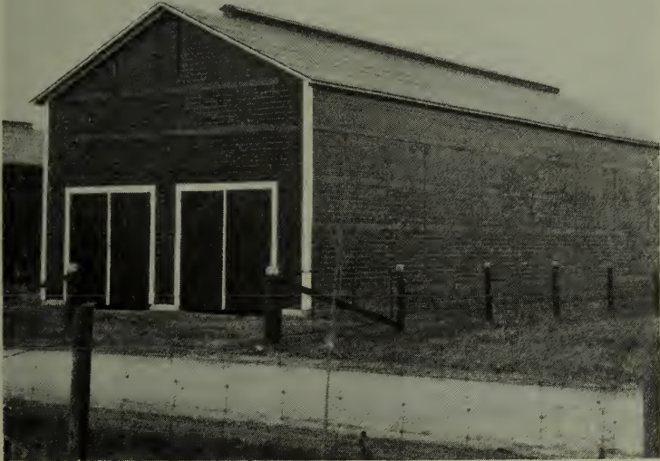
Adequate facilities for ventilation and driveways are essential features of an air-curing barn.

To permit adequate circulation the laths should be placed six or nine inches apart on the hangers. In general, the objective in curing tobacco is to dry the leaf in such a way as to preserve the qualities and also to bring about the desired colour in the leaf. The first change that takes place is apparently natural, since yellowing begins almost immediately after the leaf is thoroughly wilted. The leaf continues to change in colour until it becomes a light brown. The control of the relative humidity is extremely important at this stage to maintain this brown colour while the stem is being dried out.