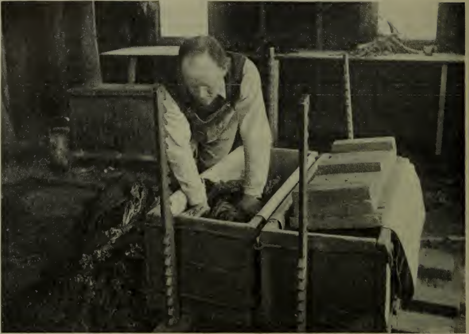
After stripping the leaves are carefully pressed into bales.