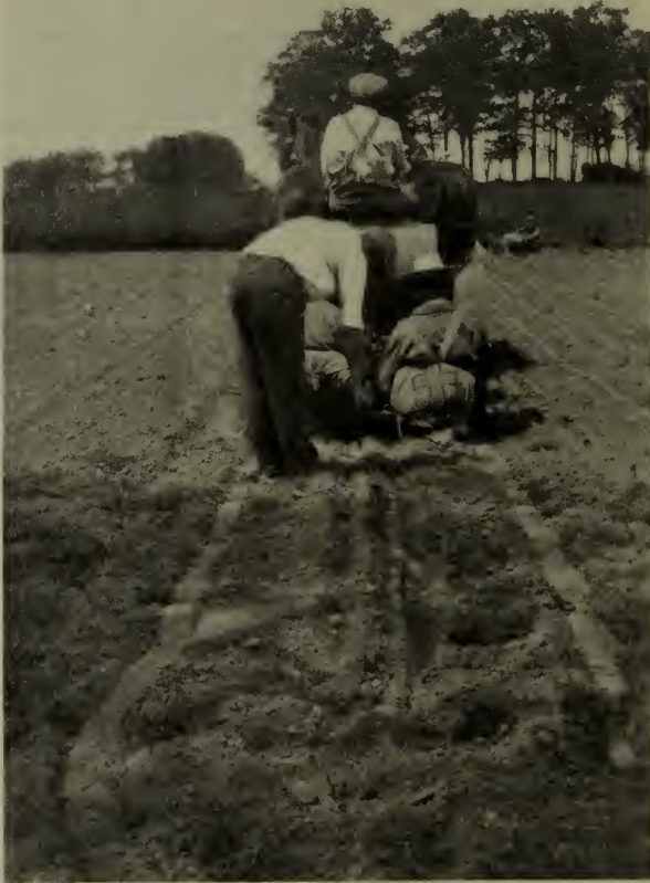
In transplanting it is always advisable to have some one follow the machine to uncover buried seedlings and reset missing ones.

In pulling the plants from the seed-beds the greatest possible care should be exercised to avoid breaking the roots. It is necessary, therefore, to water the beds well half an hour or so before taking up the plants. Care, also, should be taken to select only well-formed plants. These should be as uniform as possible, green and thick-set, with well-developed roots in order to obtain regularity of growth and size in the field. At no time should the roots be allowed to dry out before setting.