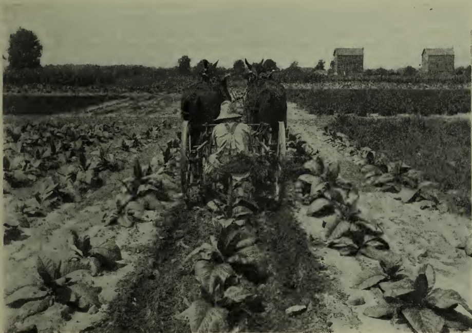
Later on during the season a riding cultivator could be used. As the roots develop, cultivation should be shallow.

As there is no hard and fast rule for topping tobacco it remains with the individual grower to know his own crop and the conditions under which it is being grown. Factors such as soil texture, soil fertility, date planted in the field, distance of planting, type and variety and method of harvesting all have an important bearing on the practice that should be followed. Generally, the lighter sandy soils are found to be less productive than the more fertile loams. Tobacco grown on the heavier soils usually requires fairly high topping, while on the other hand lower topping may be practised advantageously on the less