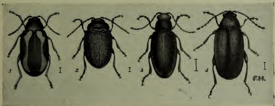
Representative appearance of flea beetles: (1) striped flea beetle; (2) potato flea beetle; (3) red-headed flea beetle; (4) cabbage flea beetle (after Gibson).

Grasshoppers may be controlled by the use of poisoned bran bait scattered, during a warm day, in the tobacco field and in grasshopper breeding grounds. The bait is made up as follows: bran, 25 pounds; Paris green, 1 pound; salt, 1 pound; water, about 2\frac{1}{2} gallons. If sawdust is available use half bran and half sawdust in the mixture. Mix the bran, Paris green and salt together and then gradually add the water until the mixture is of the correct consistency to crumble and fall readily through the fingers.