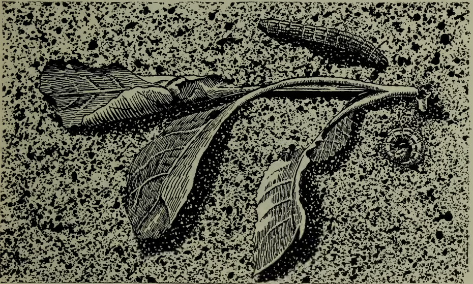
Characteristic damage and behaviour of cutworms (after Gibson).

There are five kinds of cutworms found attacking tobacco. Two of them feed below the soil surface, 1 while three cut the stem or eat the leaves of the plant above the ground. 2 Most of the cutworm moths lay their eggs in grassy or weedy fields, but one of the most common kinds lays its eggs in cleanly cultivated, cropped land. 3 Since cutworm moth eggs are laid in cultivated as well as grassy or weedy fields, tobacco should not be planted in a field that was during the previous year under sod, grass, or weeds, as most likely it will contain many young cutworms as well as other insect larvæ, such as wireworms and webworms. The best control measure against cutworms is that of broadcasting a poisoned bran bait over the field in which tobacco is to be planted. Cutworms eat the poisoned bran readily if it is put out at the proper time.