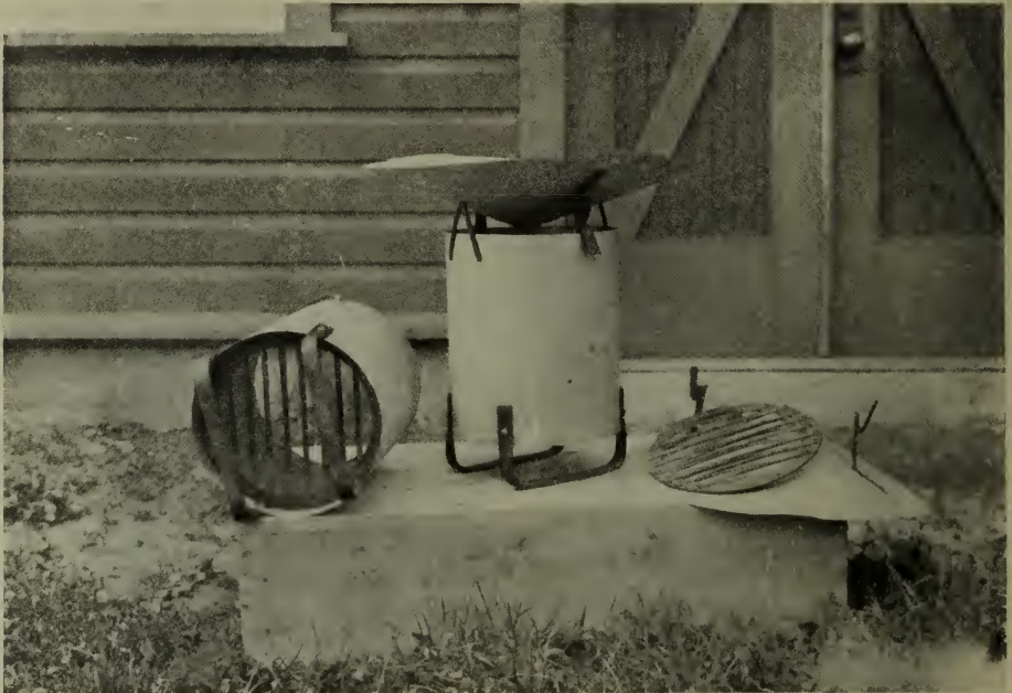
This type of charcoal burner is of considerable value during a wet season when air-curing is difficult.

4. If the weather continues cold and damp and the tobacco is not curing well, the temperature should be raised to about 90° by means of charcoal burners, oil burners, or open charcoal fires to reduce the relative humidity to 85 or 75 per cent until conditions improve.