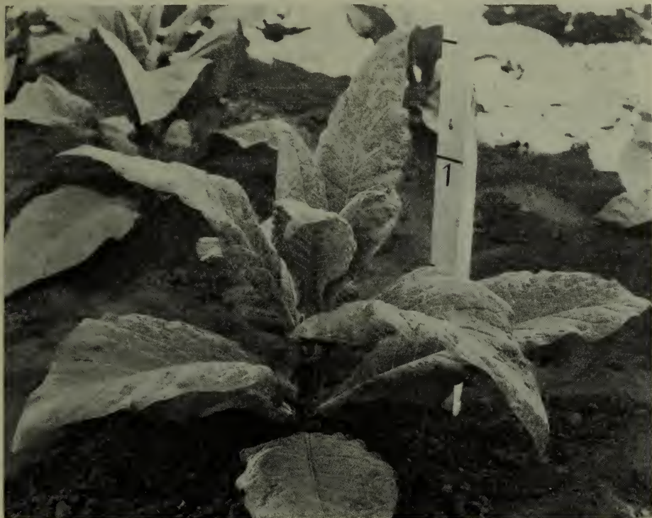
A mottling of the leaf is a distinct characteristic of mosaic infection.

So little is known relative to the cause of this disease that control measures are merely those of prevention. Seed-beds should not be placed where there is the slightest danger of infection. The plants should be handled only by those