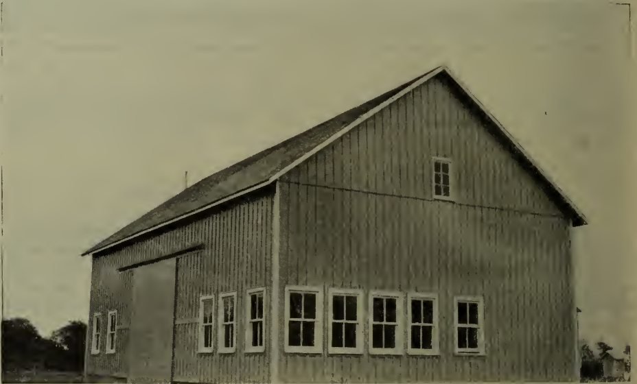
A good pack barn is required for stripping, grading, baling and storing the crop.

When this type of tobacco is cured at least a day is required before the kiln is completely cooled. The doors and ventilators are then opened to allow the tobacco to come into case. It is usually possible for the leaf to take up sufficient moisture during one night to permit its removal from the kiln or curing barn the following day. During very dry periods of weather moisture must be placed in the kiln to bring the tobacco into case by low-pressure steaming. Additional moisture can be obtained by wetting the floors and by placing damp bags over warm pipes but care must be taken to prevent excess free moisture from collecting on the cured leaf. Natural casing from outside atmospheric moisture always is preferred.