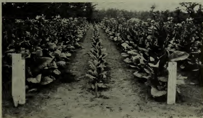
Mosaic infection of the centre row has retarded growth.

who have had no contact with plant refuse or cured tobacco suspected of infection. Diseased plants in the field should be pulled immediately and destroyed before infection spreads to healthy ones.