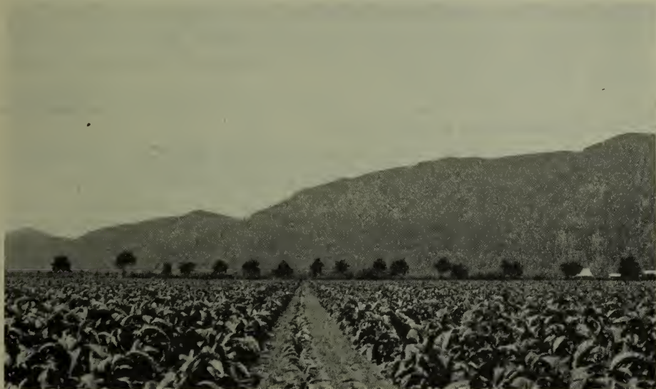
Fertilizer was not applied to the centre row. Growth and development, as a consequence were retarded.

The first requirement of a soil type is that of tilth and friability. Natural fertility should only be secondary in significance as it is more important to grow the crop on a soil that is workable, and easily lends itself to cultivation. Such a soil contains from sixty to eighty per cent sand. On the other hand it should contain sufficient clay and humus for the retention of moisture. Only soils with good surface and under-drainage should be selected. Cold-bottomed soils should be avoided. Low lands and stiff clays are also unsuitable. In general it may be stated that the soil type is reflected in the quality of the crop. Light soils produce a mild bright leaf and heavy soils a dark heavy leaf. A southern exposure as well as protection against prevailing winds are also desirable features.