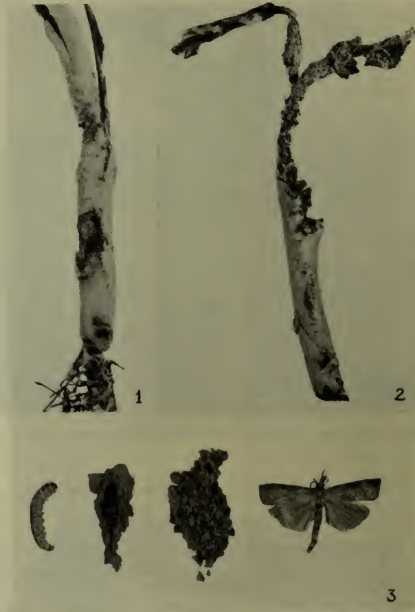
(1) and (2) tobacco seedlings injured by stalk borer; (3) stages of stalk borer—larva, pupa, larval case and adult (after Dustan).

Flea-beetles are hard-shelled, very active insects about \frac{1}{8} inch in length. In colour, they are black, brown, or striped. They hop like fleas, a character from which they derive their name. Injury is caused by eating small circular or angular holes in the leaves. In the field, flea-beetles cause damage sometimes just after plants are set out, the plants around the edges often being severely injured. These beetles spend the winter under leaves, plant debris, around edges of, and even in the fields if any refuse has been left. All such