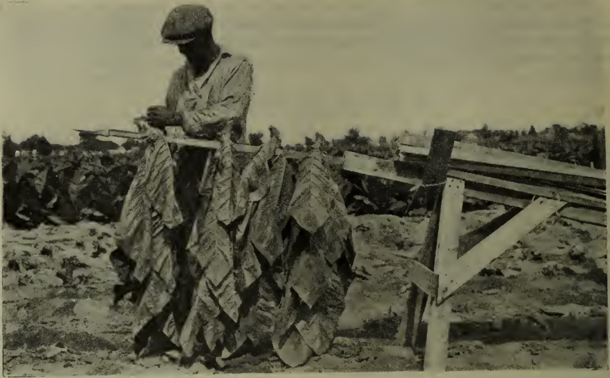
Having wilted in the field for an hour or so the plants are carefully speared on laths.