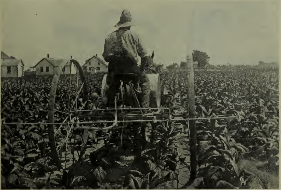
Spraying is the only means of controlling the tobacco worm.

of hydrated lime as of arsenate of lead). Dusts are applied when the plants are covered with dew so that the maximum amount of dust will adhere to the foliage. The ideal time to make applications is during a calm early morning when the dew is still on the plants. It is more likely that dust applications will have to be repeated in order to control the caterpillars as dusts do not remain on the foliage as long as liquid applications. This is especially so in rainy weather.