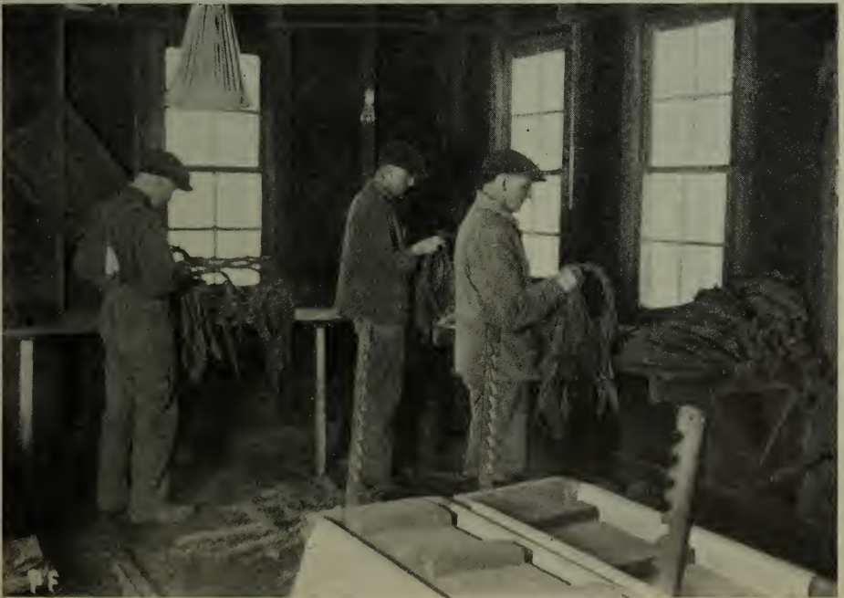
With stalk-cut tobacco the leaves are removed from the stalk after curing.

Similar practices are followed in handling cigar and pipe tobacco except that the tobacco is always bulked on the lath to await stripping.