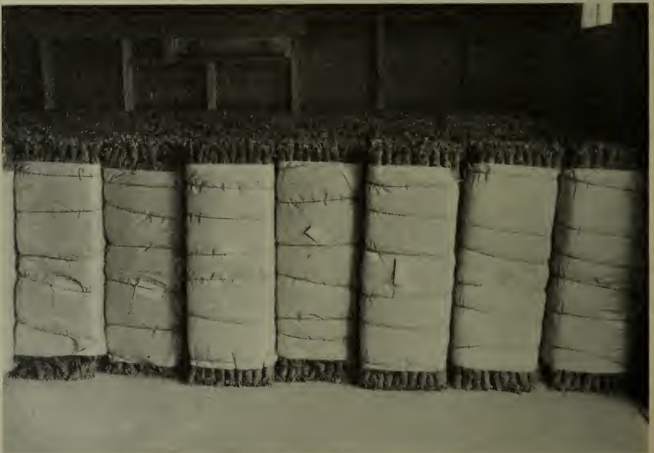
The baled tobacco is now ready for shipment.