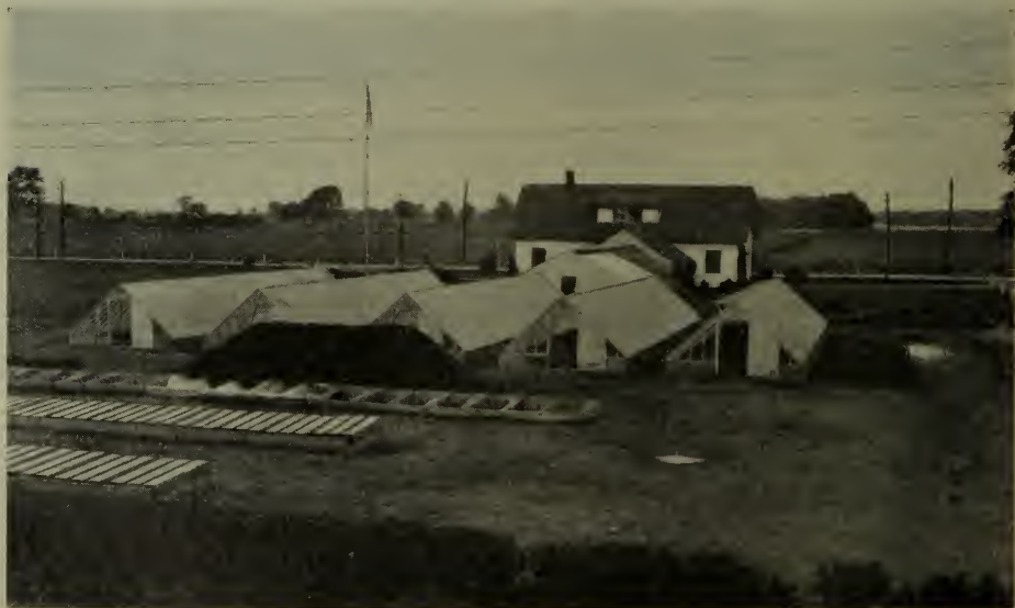
Two types of seed-beds are shown, semi-hot and A-shaped. Note the pile of compost ready for use.

Both of these are permanent structures, the latter being so common a construction all over the country that it is not necessary to go into detail concerning it here. For the growing of tobacco seedlings, the greenhouses used are usually medium-sized structures ventilated in the customary manner.