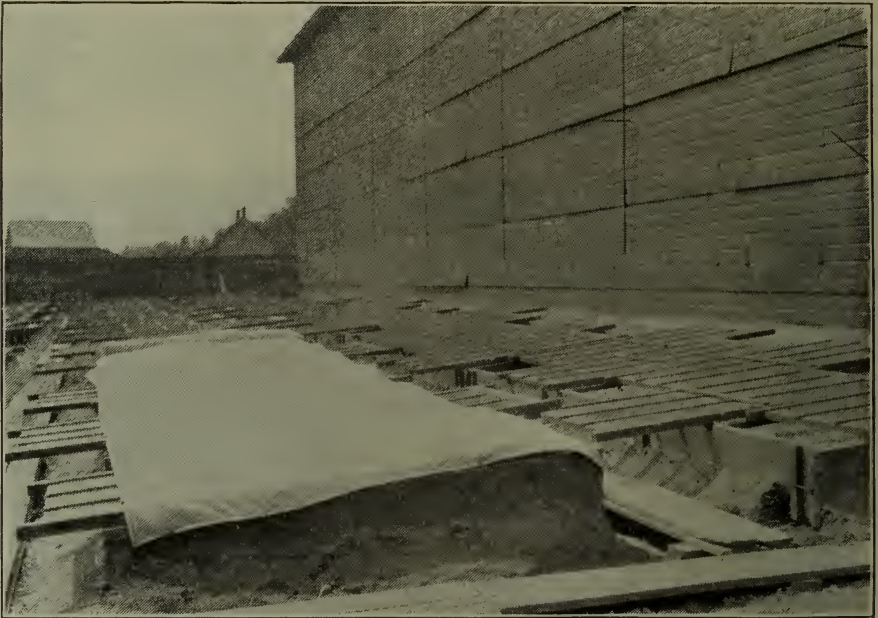
Aeration can be controlled conveniently with seed-beds of this type. Canvas covers are used during cold nights.

Success or failure in the production of strong healthy tobacco seedlings usually depends on the first two weeks' period after the seed is sown. At this time careful regulation of both temperature and humidity is very important. Special care should be taken not to allow the beds to become too dry, especially when the plants are just coming up. Patchy, poor stands usually result, if the beds are allowed to dry out at that stage of growth. Sufficient water should be applied to keep the surface moist. Therefore, frequent light waterings must be applied during the germinating period and until the young seedlings become established. On the other hand, the soil should not be allowed to remain for any length of time in a stagnant, unhealthy state as certain difficulties are almost sure to result. Sufficient ventilation is therefore also important. The best temperature for germinating the seed is around 80° F. Under no conditions should the temperature exceed 90° F. without adequate ventilation.