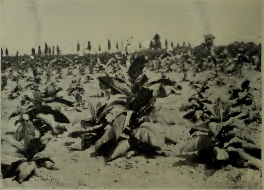
Black root-rot organisms live in the soil and cause an uneven growth of the crop.

In the field the plants show the same unthrifty appearance and lack of growth. The whole field may appear patchy and, on examination of the roots, dark lesions are found. If healthy plants are placed in a disease-infested soil, climatic conditions may favour either the growth of the plant or the development of the disease.