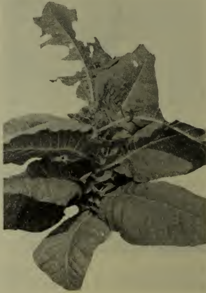
Burley tobacco plant showing damage by tobacco worm (original).

The moths appear each season about the end of the first week in July. They begin laying eggs on the tobacco foliage and continue this activity until about August 7. The eggs are laid usually on the under surface of leaves and hatch into the caterpillar stage in four to five days. When mature the caterpillar drops to the ground and burrows into the soil, where it forms the pupal stage. The winter is passed in the pupal stage in the soil.