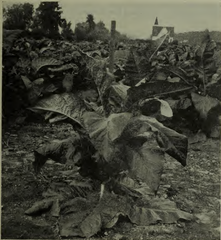
Leaf drop, attributed to nutritional disturbances, frequently causes considerable damage to tobacco grown in the Okanagan Valley of British Columbia.

To control the disease all field refuse and stubble should be ploughed under. Sanitary measures should be practised in and around the curing barn by removing all tobacco leaf trash. The seed-bed should be located some distance from the barn and all sashes and frames disinfected with formaldehyde. As there is very little that one can do with infection, once it becomes established, it is advisable to treat the seed before planting with silver nitrate, one part to a thousand, for two successive ten-minute periods.