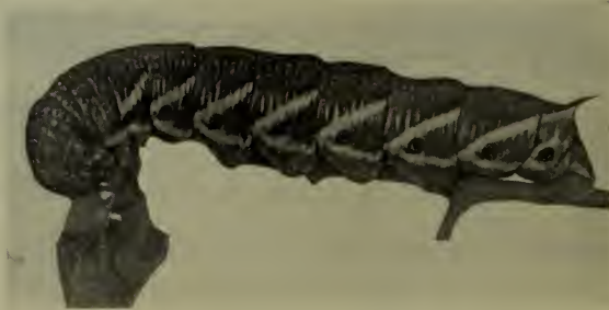
Full grown tobacco worm (after Dustan).

The tobacco worm may be controlled by spraying the plants with a solution of 3 to 4 pounds of arsenate of lead to 40 gallons of water. Spraying should be done as soon as the caterpillars appear on the leaves. In years when the insect is particularly abundant, a second spraying with the same solution may be necessary.