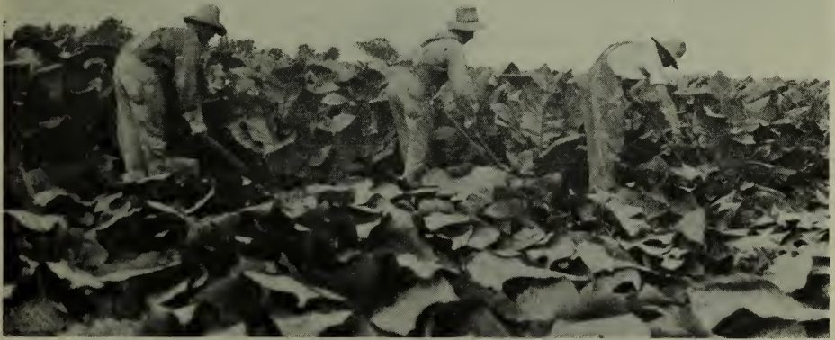
Long handled shears are used in stalk-cutting tobacco. The plants are removed at the ground level.

In the province of Quebec where most of the cigar and pipe tobacco produced in Canada is grown, the crop is stalk-cut, wilted and speared on laths. Conditions as to ripening, etc., are the same as for the split-stalk method. The method of placing on the laths, however, is different.