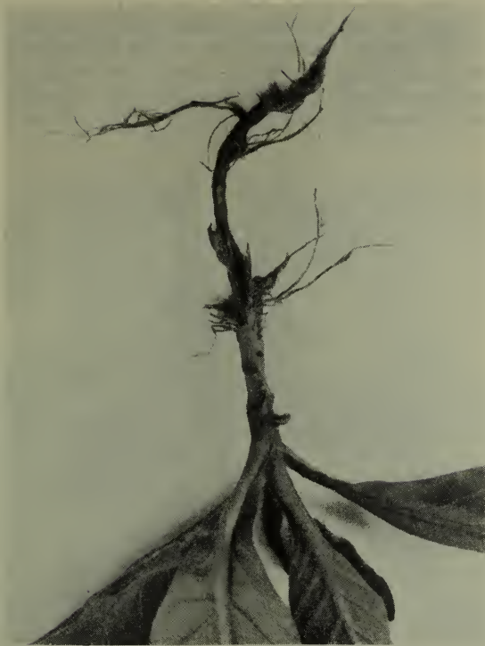
Typical injury to tobacco by wireworms (original).