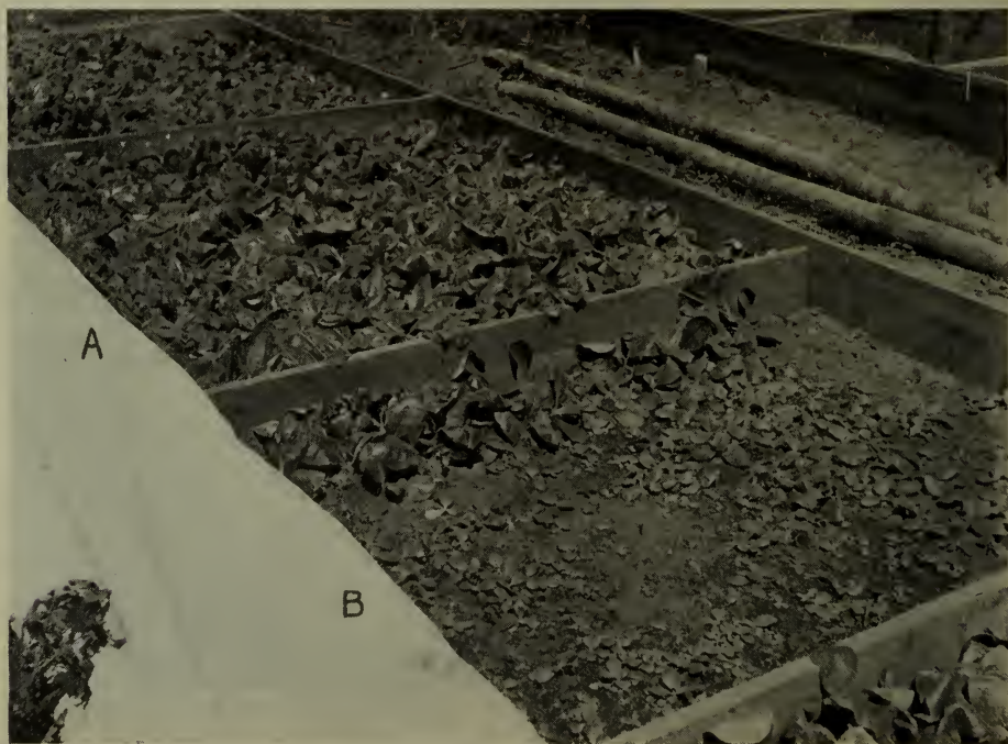
Efficient sterilization of seed-bed soil eliminates disease. Note the difference between "A" and "B", steamed and unsteamed, respectively.

In addition to sterilizing the soil it is a good practice to treat the cotton, sash, and framework of the plantbeds or greenhouses. In case the cotton is used the second year it can be sterilized by boiling. The other equipment may