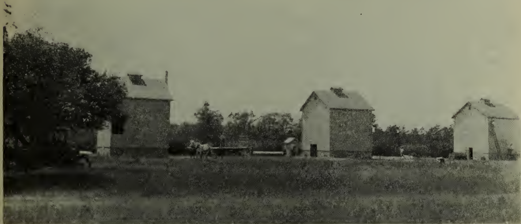
Properly constructed kilns make the curing of cigarette tobacco relatively easy.

thickness of leaf. Obviously, no specific rule or formula can be given and knowledge of curing gained through practical experience is, therefore, considered essential for good results. In the first place an attempt should be made to select leaves of uniform ripeness and thickness. Tobacco should not be over-ripe or over-wilted. Over-crowding in the kiln should be avoided and ample space allowed for heat and air circulation especially during hot weather. Proper ventilation is very important in maintaining the necessary temperature and humidity relations. A reliable thermometer and hygrometer, located near the centre of the kiln on a level with the bottom tier of leaves, serves as a dependable guide in curing.