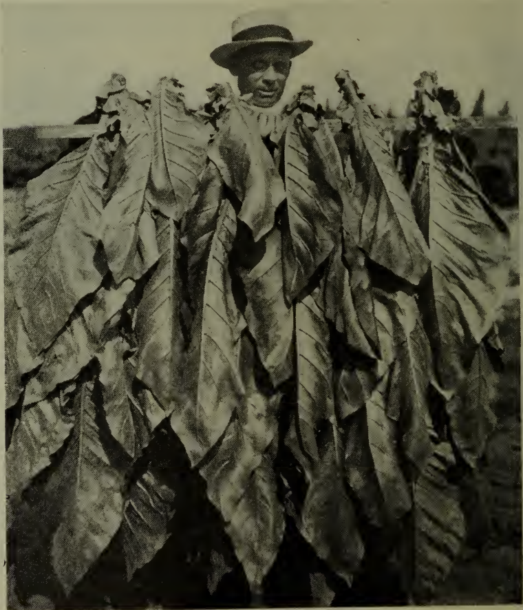
Cigar leaf must be carefully handled to avoid bruising or other such injury to the leaf.