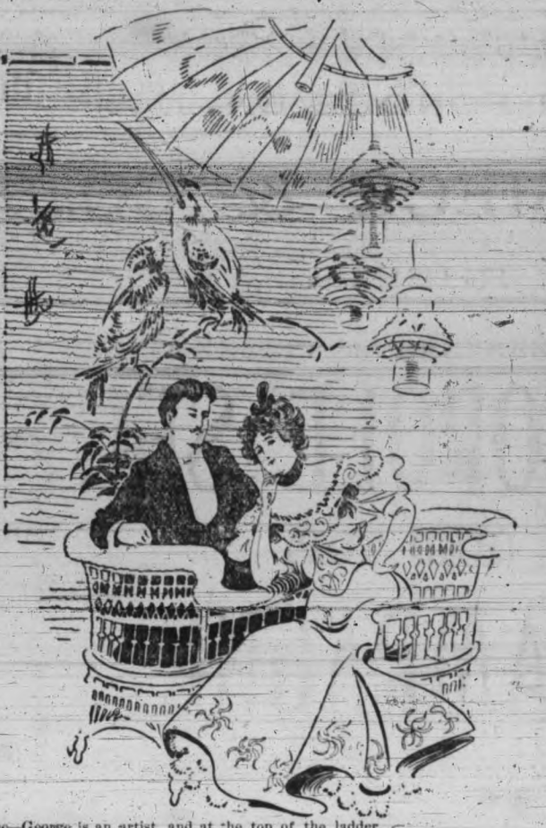
She—George is an artist, and at the top of the ladder. He—Yes, I saw him painting a roof yesterday.