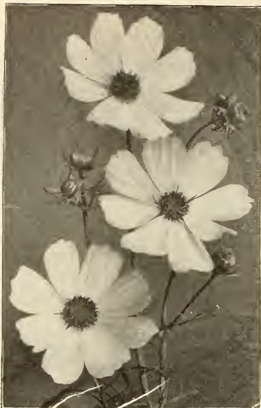
COSMOS, Midsummer Giants.