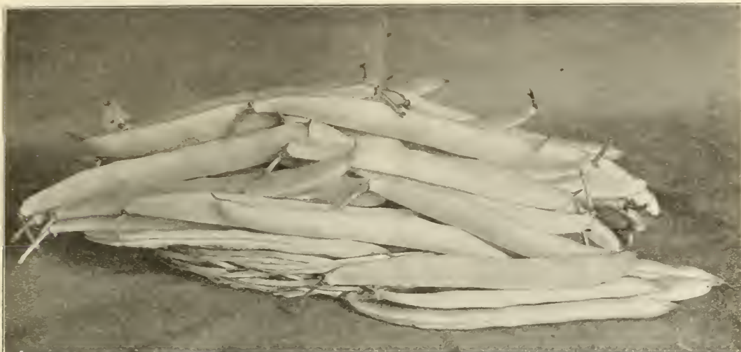
BEAN—Farquhar's Rustless Golden Wax.