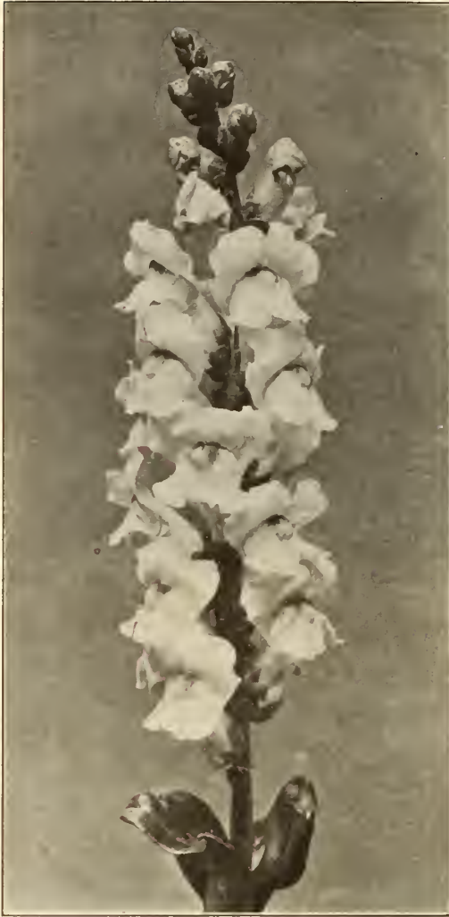
ANTIRRHINUM, Farquhar's Giant.

MAILED FREE AT CATALOGUE PRICES TO ANY ADDRESS IN THE UNITED STATES