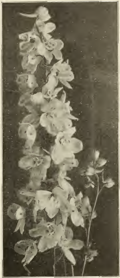
Delphinium. Farquhar's Hybrids.