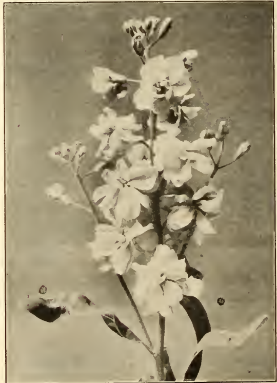
STOCK, Beauty of Nice.