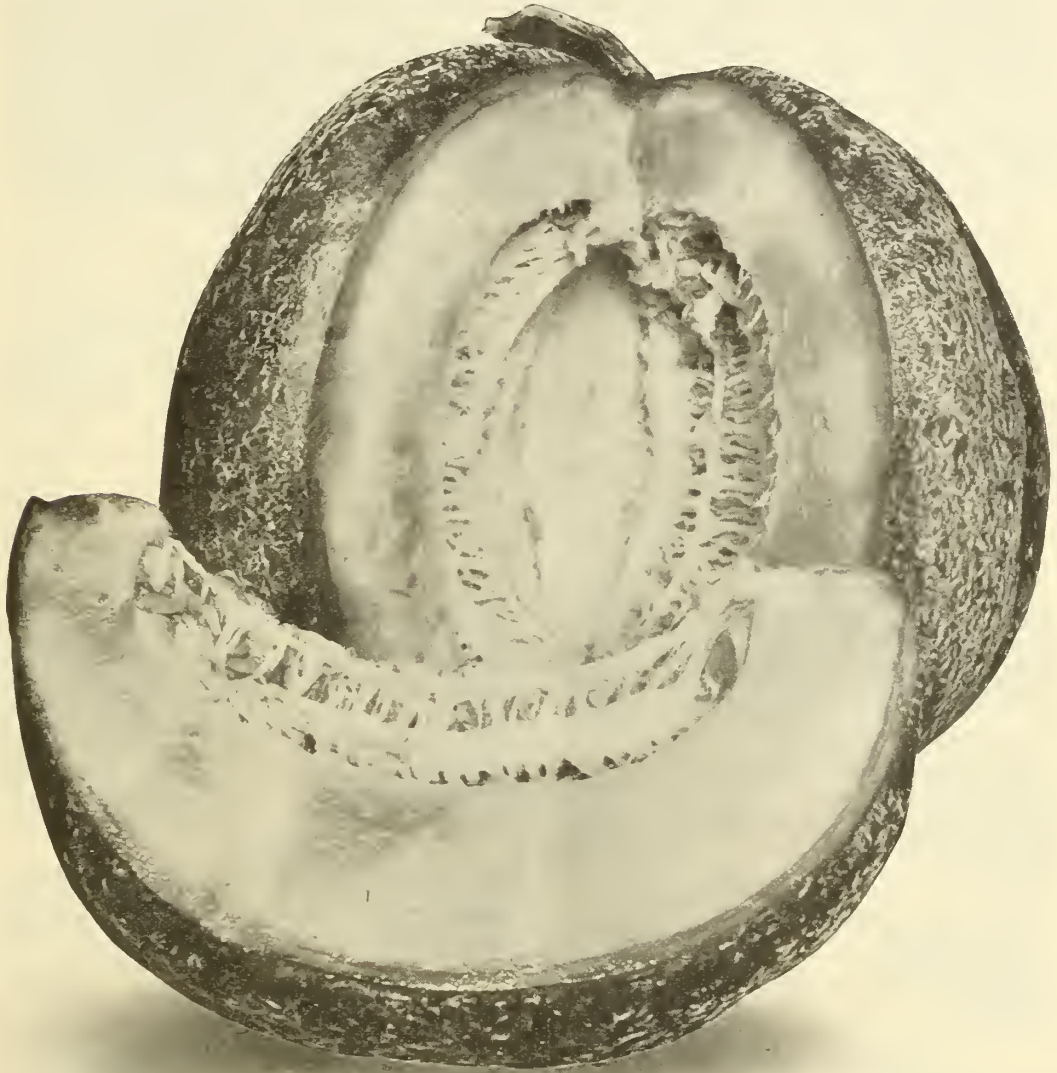
MELON, FARQUHAR'S HONEYDROP.