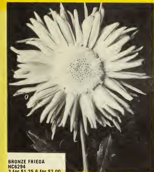
BRONZE FRIEDA NC6294 3 for $1.25 6 for $2.00

Finest list of the popular cut flower mums ever presented. All shades and colors. Gorgeous hues that really add sparkle to your mum garden.