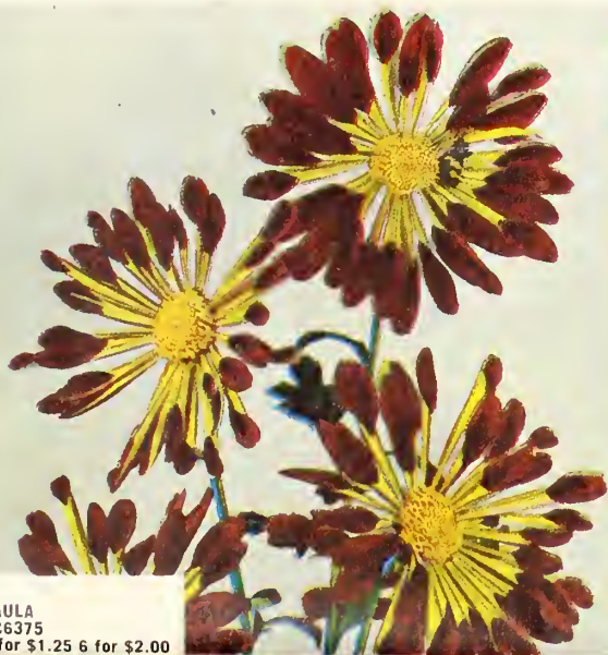
PAULA NC6375 3 for $1.25 6 for $2.00

SPoon COLLECTION ALL 8 1 EACH ABOVE only $2 50