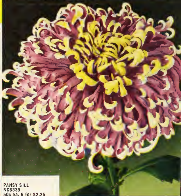
PANSY SILL NC6339 50c ea. 6 for $2.25

NC6343 YELLOW TAGGART — An odd yellow flower with quilled petals covered with hairy spines. October 30th.