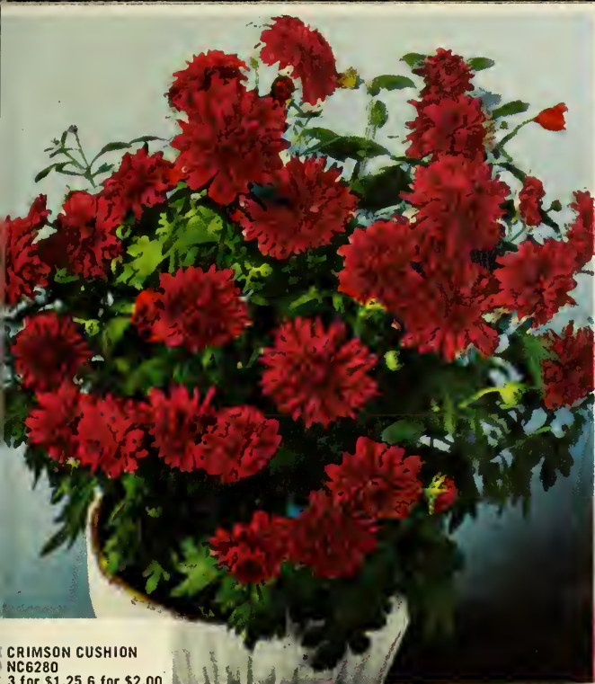
CRIMSON CUSHION NC6280 3 for $1.25 6 for $2.00