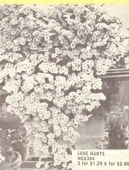
JANE HARTE NC6394 3 for $1.25 6 for $2.00