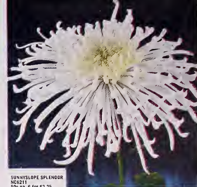
SUNNYSLOPE SPLENDOR NC6211 50c ea. 6 for $2.25

NC6217 YELLOW RAYONANTE — Beautiful yellow sport of "RAYONANTE." October 15th.