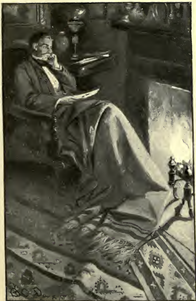
His memory took him back nearly forty years ago