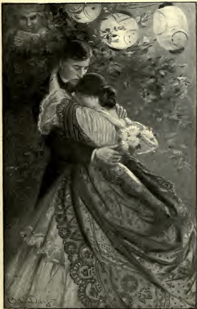
He did not attempt to hush her, or to still her sobs