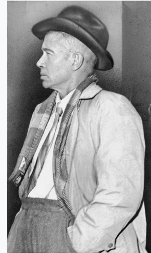
Cummings in 1953

Born Edward Estlin Cummings October 14, 1894 Cambridge, Massachusetts , U.S. Died September 3, 1962 (aged 67) Madison, New Hampshire , U.S. Alma mater Harvard University