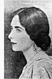
Mina Loy in 1917