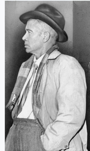
Cummings in 1953

Born Edward Estlin Cummings October 14, 1894 Cambridge, Massachusetts , U.S. Died September 3, 1962 (aged 67) Madison, New Hampshire , U.S. Alma mater Harvard University