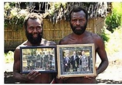
Yaohnanen tribesmen show pictures of 2007 visit with Prince Philip

The Prince Philip Movement is a religious sect followed by the Kastom people around Yaohnanen village on the southern island of Tanna in Vanuatu. It is a cargo cult of the Yaohnanen tribe, [1] who believe that Prince Philip, Duke of Edinburgh, the consort to Queen Elizabeth II, is a divine being.