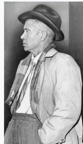
Cummings in 1953

Born Edward Estlin Cummings October 14, 1894 Cambridge, Massachusetts , U.S. Died September 3, 1962 (aged 67) Madison, New Hampshire , U.S. Alma mater Harvard University