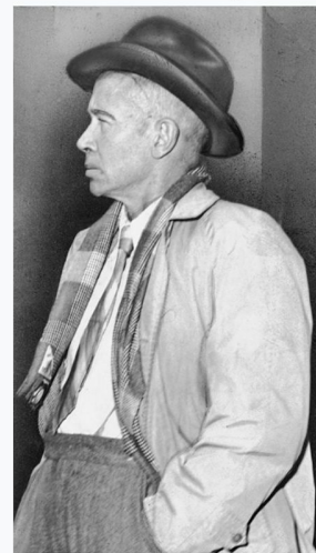
Cummings in 1953

Born Edward Estlin Cummings October 14, 1894 Cambridge, Massachusetts , U.S. Died September 3, 1962 (aged 67) Madison, New Hampshire , U.S. Alma mater Harvard University