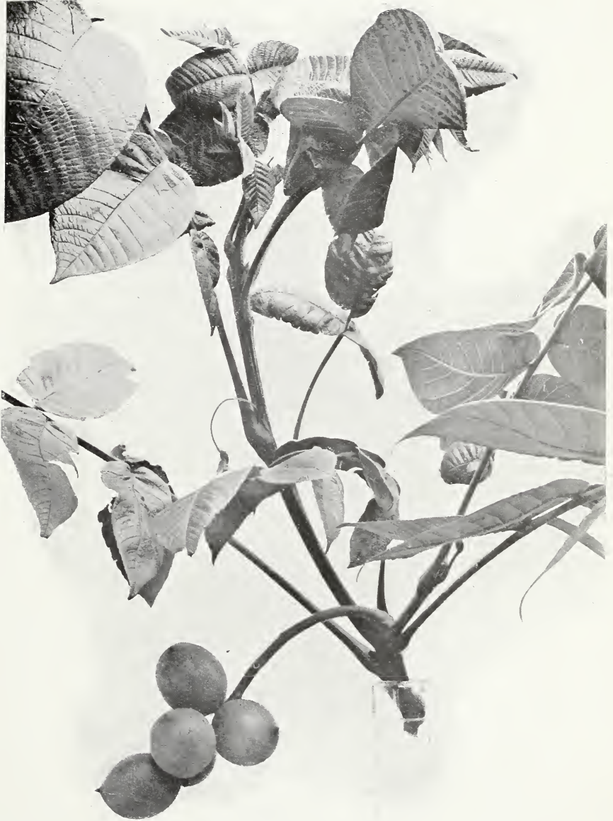
Juglans cathayensis. See page 4.