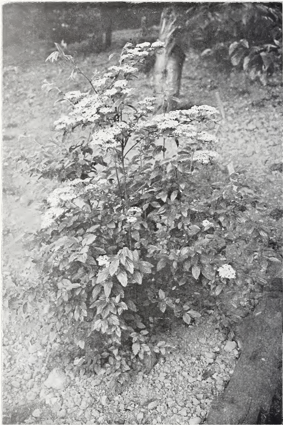
Spiræa Henryi. See page 7.