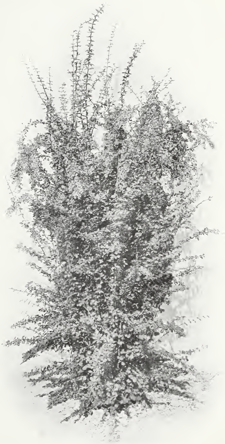
Berberis polyantha. See page 4.