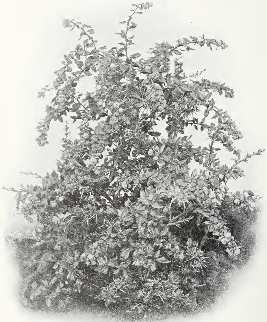
Berberis verruculosa . See page 4.