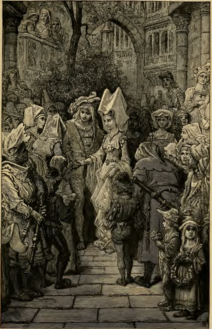
The bride hath paced into the hall ; Red as a rose is she.