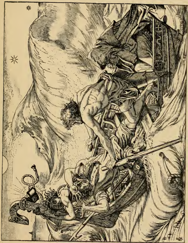
Upon the whirl, where sank the ship, The boat spun round and round: