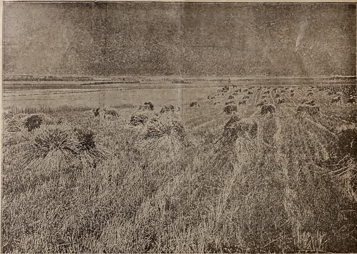
Landscape view of one of J. R. Ratekin & Son's wheat fields in the Nishna Valley at harvest time, when cutting in field of Turkish Red Winter Wheat. This field of 40 acres threshed 47 bushels per acre.