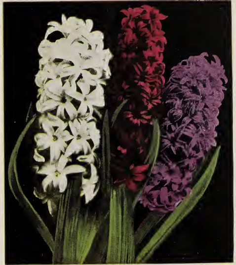
L'Innocence La Victoire Grand Maitre Hyacinths

Quick root growth on Hyacinths can be induced by slight scratching bottom rim of bulb before planting.