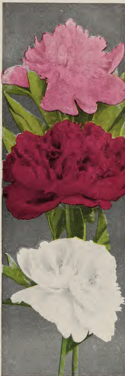
TOP—Edulis Superba Peony CENTER—Felix Crousse Peony BOTTOM—Festiva Maxima Peony

Karl Rosenfield . Very large. Early, beautiful blood-red, of globular shape. Tall. Free bloomer. . Each, $2.75