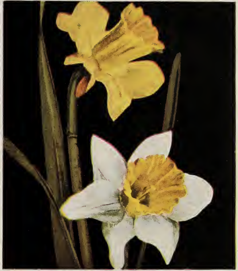
Emperor Narcissus (above) Empress (below)

Emperor, pure yellow, gigan- tic size, popular for out- doors, large bulbs..... $1.20 $7.75