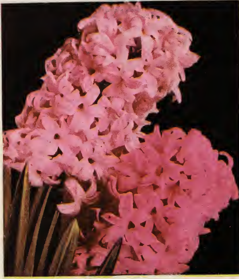
Lady Derby at left—Gertrude at right