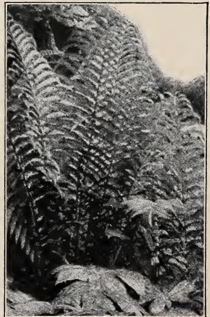
Ostrich Plume Fern

Per Doz. Per 100 Giant Golden Yellow, a beautiful yellow..... 50c $3.25 Maximilian, light blue..... 35c 2.35 Purpurea Grandiflora, rich purple..... 40c 2.75 Mont Blanc, large pure white.. 35c 2.35 Sir Walter Scott, white with pale lilac stripe..... 35c 2.35 ALL COLORS, GOOD MIXED..... 25c 1.50