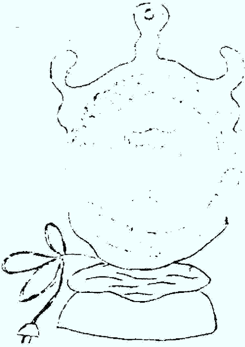
Table Lamp Order No. 50 14. Price $21.80