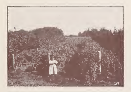
Photograph of Palmer Rasherry, showing growth of vines, extremely hardy, exceptionally free from disease.