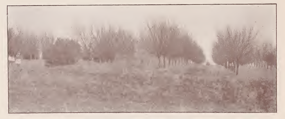
PLUM ORCHARD, HOME NURSERY

attention, always producing abundant crops. The following varieties are found to be the very best for this section of the country.