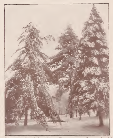
Photograph of Specimen Evergreens. Covered with snow and sleet, on our grounds near residence.

The Arbor Vitæ is well adapted for either ornamental or windbreaks. Rapid grower, perfectly hardy, native. Easily transplanted. For hedging, set 12 to 16 inches apart; windbreaks, 3 to 4 feet. in rows.