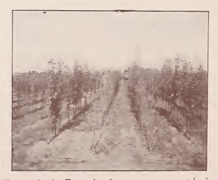
Young Apple Trees in the nursery row stripping leaves preparatory for fall digging. From a photograph.

NOTE—When you buy trees of me you have no irresponsible tree peddlers to deal with, or tree agent commissions to pay, you deal direct with the nursery and get your trees from firsthands. If our stock is not as represented you know where to find us.