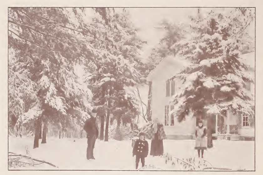
Partial View of Residence in winter. From a photograph.