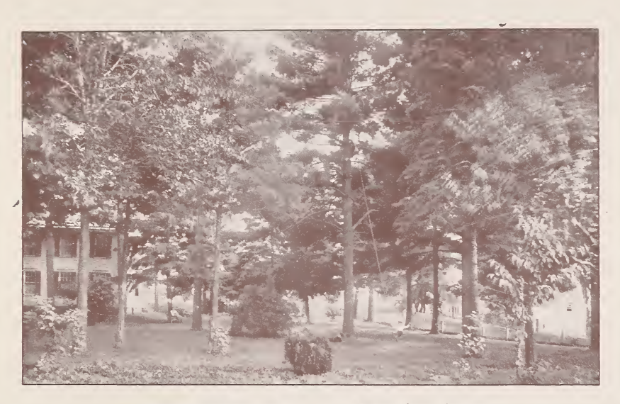
Photo of proprietor's front lawn as seen from the rear. Partial view of residence on the left. Tenant houses on the right.

In presenting this my nineteenth annual catalogue, beg to say we are better able than ever to furnish the tree planter or fruit grower with trees and plants of the most desirable kinds true to label and at extremely low price.