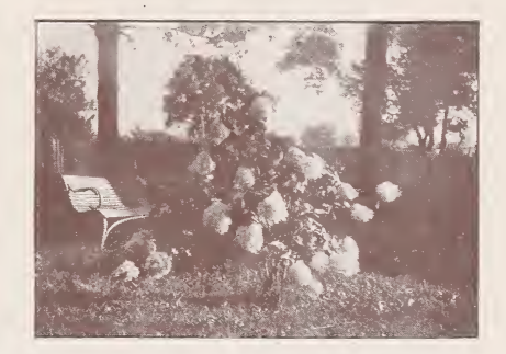
Hardy Hydrargia. From a photograph, Home Nursery Grounds.

Our list of shrubs is not a long one, but it contains all the most desirable kinds that are really hardy in this region.