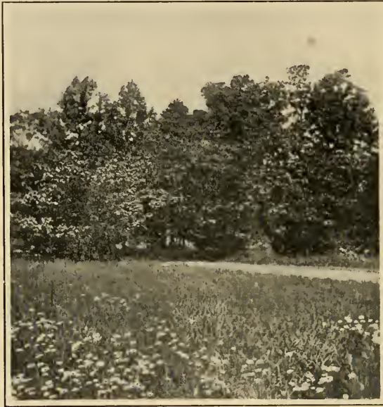
Catalpa trees, showing the meager growth which results where this tree takes possession of a forest area and replaces the hard-woods.

Turning to the Chestnut, Tulip, and Beech in the schedules, we find reproduction satisfactory in about one-half the areas only, namely, those where the humus is thick and rich,