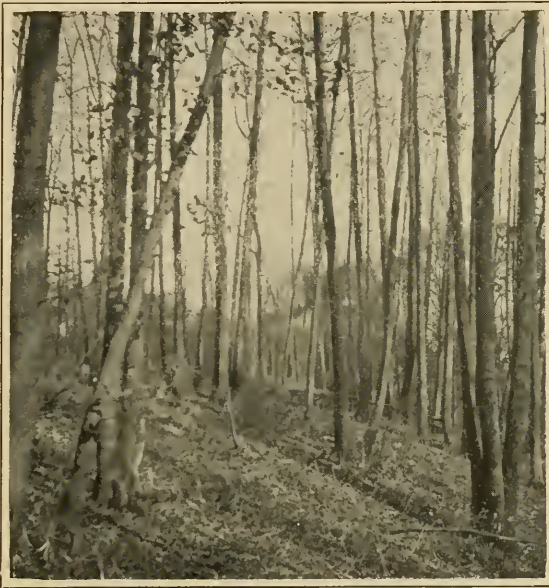
Forest of sprout growth Chestnut trees at Beechwood. These trees are dying rapidly, and prompt replanting with seedlings is needed in every opening.

soft-woods from crowding them out. Many of the undesirable kinds of seedlings should be cut out and the space replanted with longer lived trees. Some policy of checking forest fires is absolutely essential if good results in any of the forests near the railroads are to be secured. The present park guards are