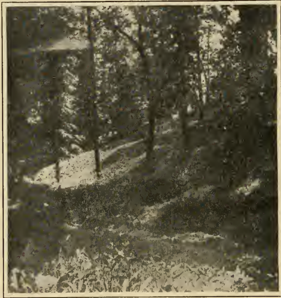
Forest at George's Hill, showing slope bare of undergrowth and washing. These trees are starving and dying in large numbers.

tract was burned over, as well as one-half of Belmont Valley, Sweet Briar, Beechwood, and Fountain Green forests. And, as is well shown on the schedule cards, these fires not only injure the younger trees and destroy entirely the rising generation of seedlings, but they consume the humus or peat to such an extent that the ground is left too poor to sustain the existing