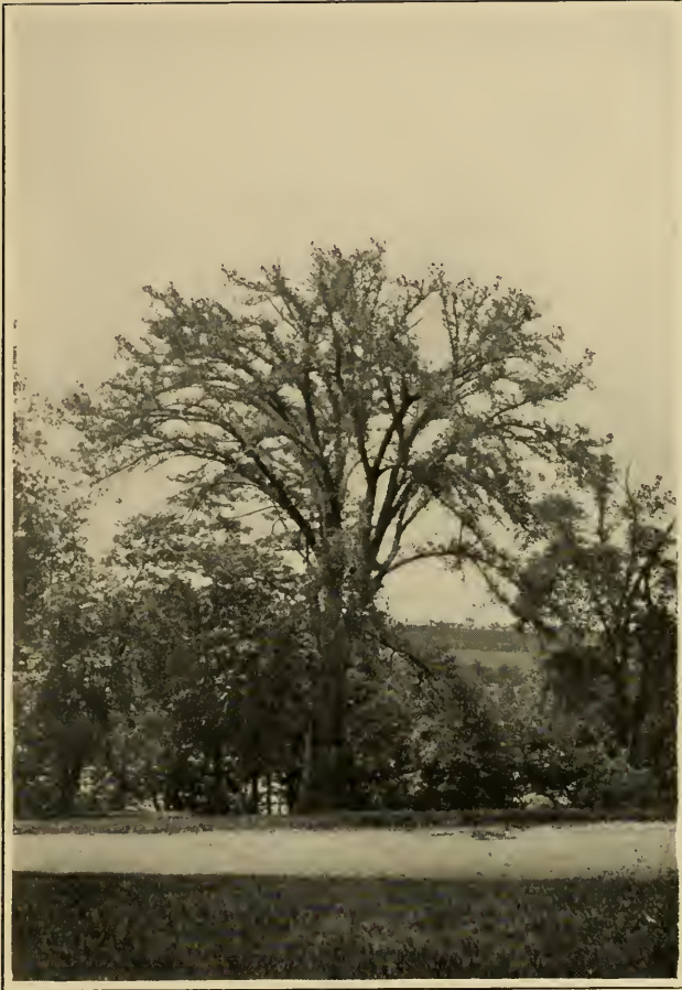
Large Elm on Lemon Hill suffering from scale. This tree was dying when sprayed in 1907, and if not sprayed regularly for several years will unquestionably succumb. Note the young growths striving to recover the tree. If these are kept clean of scale, the tree can in time recover.