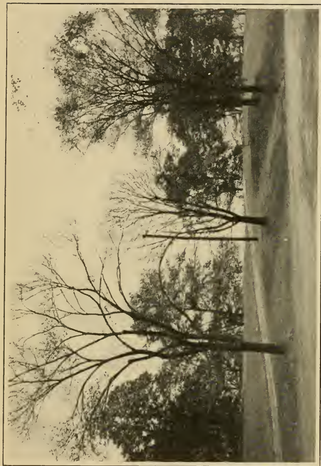
July 15, 1908, in the old park. The Elms and Horse Chestnuts in the foreground have been stripped by the tussock moth. This not only renders them unsightly, but seriously weakens the tree. Careful forest work would render this condition impossible.