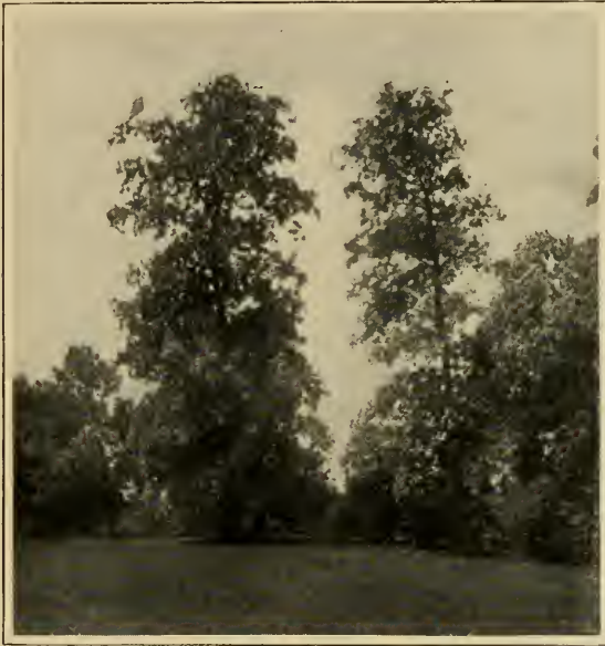
Black Oak and Hickory trees, showing noble character of these hardwoods in all situations. These trees once stood in a forest.

As these statements are of so serious a nature that they call