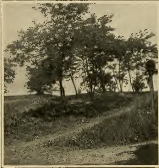
Locust seedlings in West Park. This is a weedy tree, useful only for temporary cover on bad ground, as it soon falls prey to borers.

dwindling away. Healthy young Oaks, Walnuts, Beeches, Chestnuts, and the like nobler trees of our forests should be planted in every opening in the woods. A special effort could well be made in this work to obtain added local interest by planting masses of Oaks in one section, Beeches in another, mixed hard-woods in a third, etc., thus providing for both the