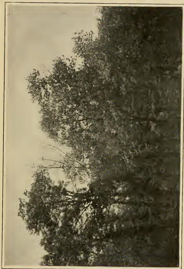
View showing a portion of Snyder's woods near Oxford Street entrance. Note the dead limbs on the Chestnut trees in center of picture; these trees are suffering from Chestnut tree fungus-disease, one of the most dangerous enemies to the forest vegetation. Prompt cutting out of infested wood is most important in such cases, as no cure has yet been discovered for this new enemy of the Chestnut.