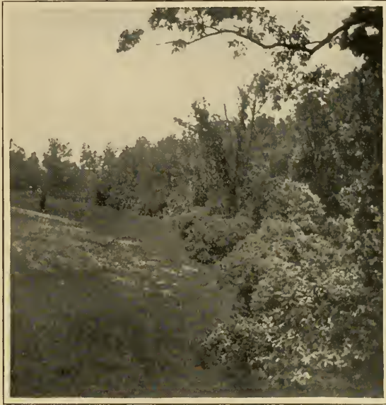
View in West Park, showing charming effect of native shrubs massed on the edges of the forest. They also help the trees by preserving the moisture.

In a number of cases a considerable improvement could also be made by developing the second forest growth through