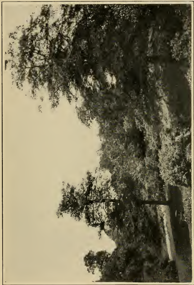
View showing Beech trees in West Park. Though still very beautiful, the trees here shown are suffering from scale and aphids, and require immediate attention, and at least three sprayings annually, or their death within three years may be prophesied with certainty. Note that foliage is already becoming thin in upper half of the tree.