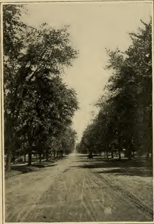
Belmont Avenue, showing Elms which were threatened with destruction by scale. Pruning and spraying these trees have restored them as shown here. Unfortunately, no work could be done to preserve them this summer, and they are rapidly reverting to an unsightly condition.