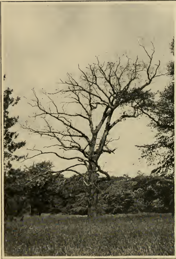
White Oak tree in West Park killed by scale. Frequent sprayings would without doubt have saved it, but no funds were available.