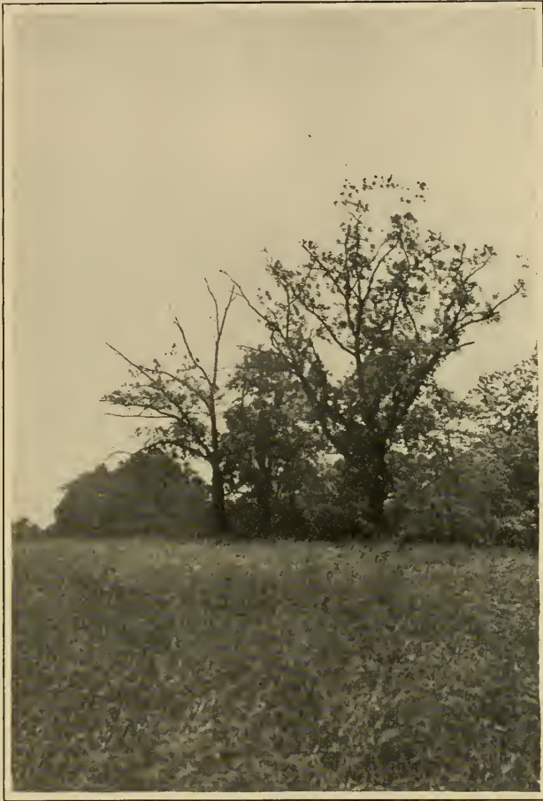
Oyster-shell scale has damaged these Walnut trees almost beyond repair. Careful pruning and spraying for several consecutive years I believe will still save them. These sprayings will cost approximately 75 cents per tree each time.