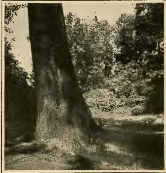
Trunk of veteran White Oak, showing splendid development of this species as a forest tree. Note the lack of fertile leaf mould about it owing to trampling by the public