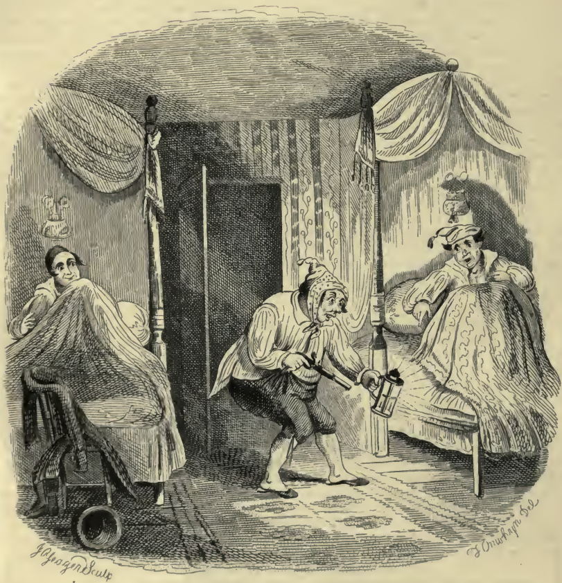
Persuasion of Peuple