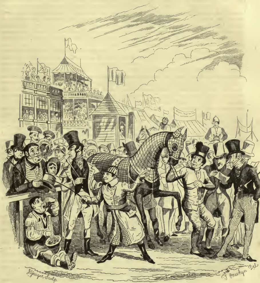
Valentine at Ascot.