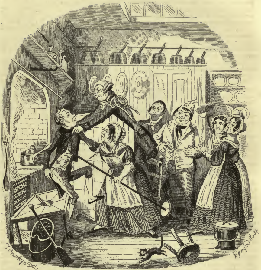
The Roasting of Joseph.