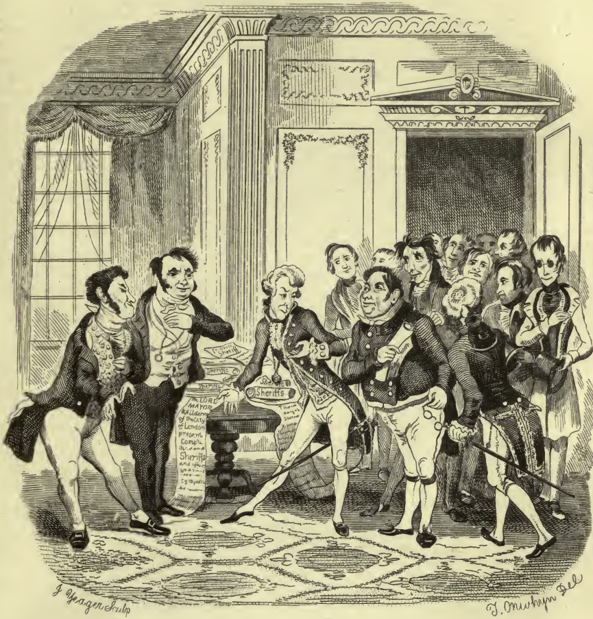
The Sheriff's Levee.