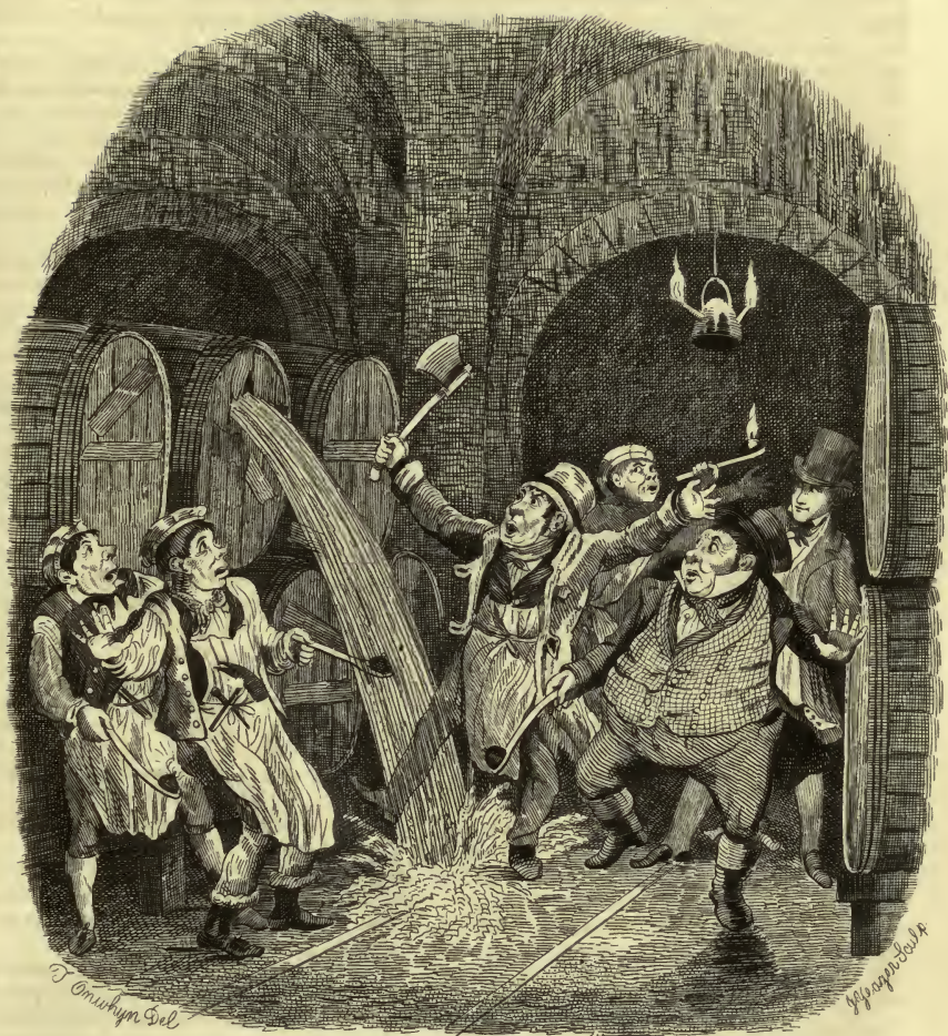
The head driven in to look after the voice.