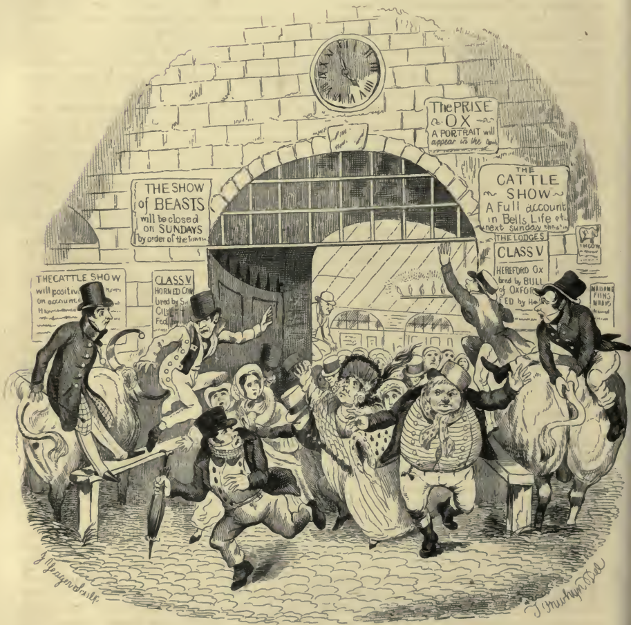
False Alarm at the Cattle Show