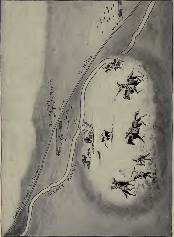
FIGHT WITH EAGLE CLAW