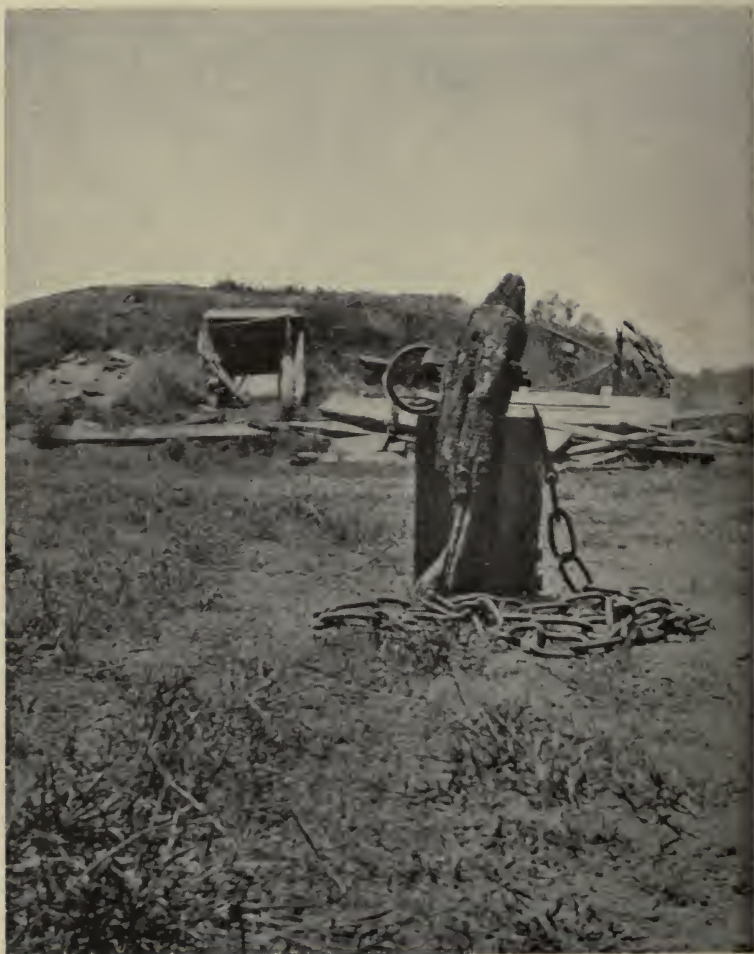
OX-YOKE AND CHAIN—ACROSS PLAINS, 1864