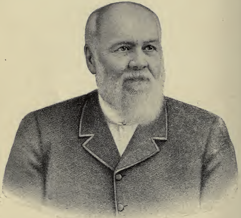
COL. J. M. CHIVINGTON