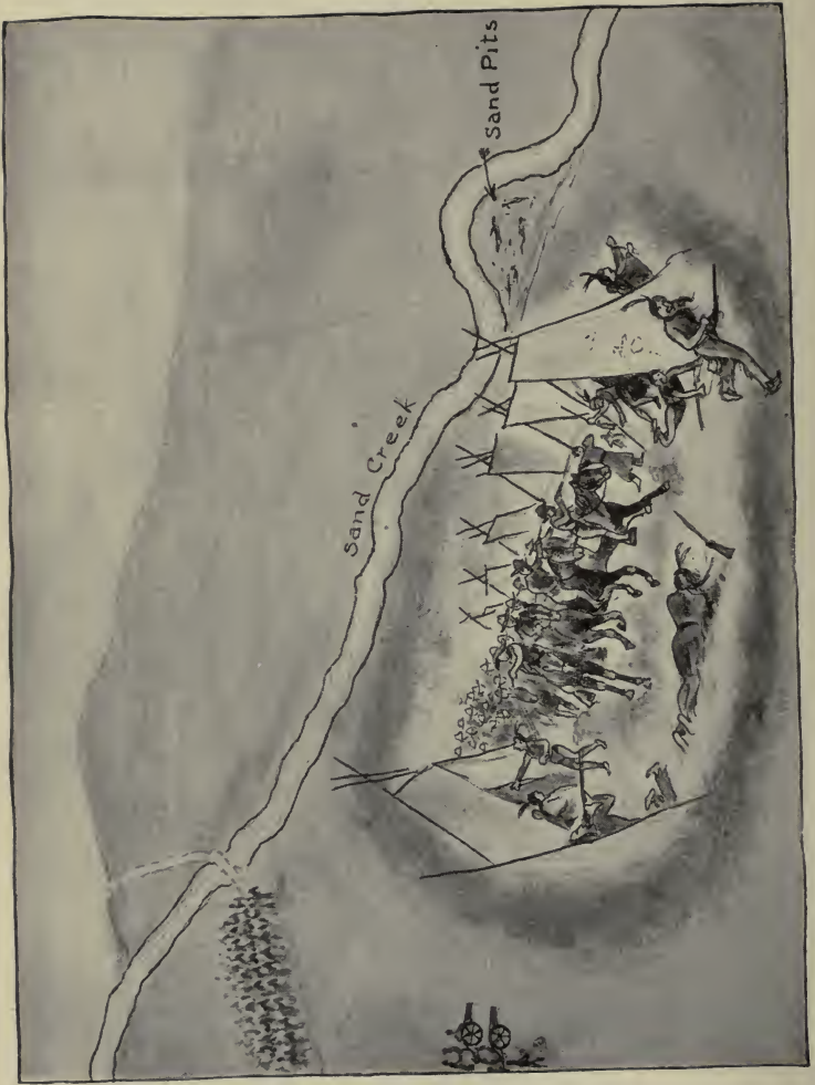
Situation of Indian Tents and the 3rd Colorado Regiment at the Beginning of the Sand Creek Fight