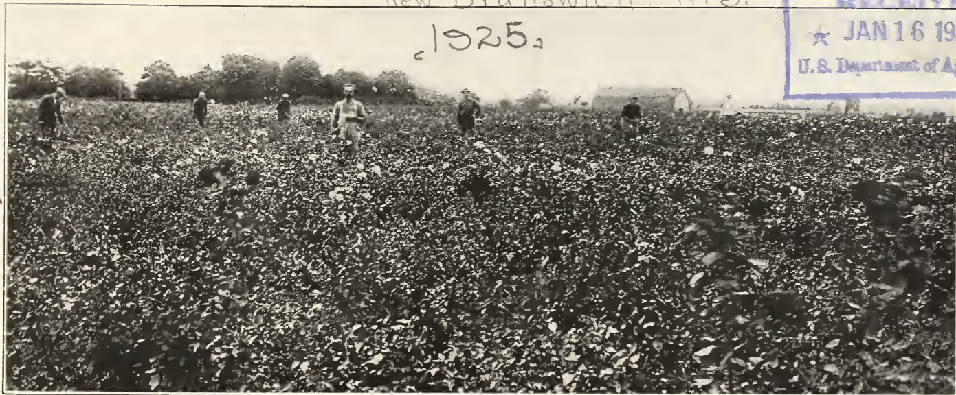
New Brunswick Nurseries' Rose Fields, showing 70,000 Rose Bushes, literally 10 miles of Roses, in full bloom

LIBRARY RECEIVED ★ JAN 16 1925 ★ U. S. Department of Agriculture