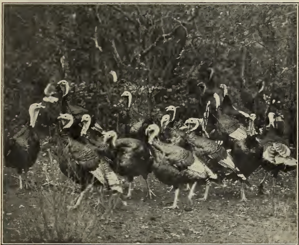
They're beginning to look like real turkeys by this time—after a busy summer just eating and growing! Above scene is from Glendalough Turkey Farm, Battle Lake, Minn.