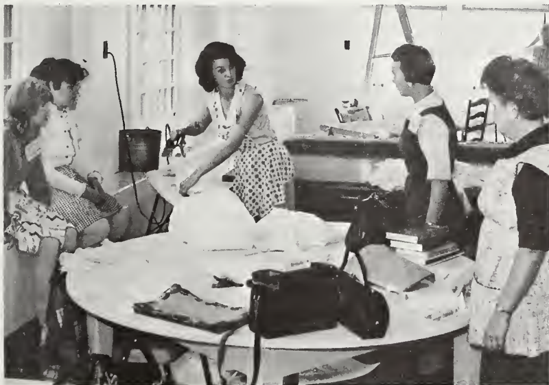
Volunteer Extension homemakers helped mental patients transform a former canteen area at the State hospital into a living room situation.

The Umatilla County program is only one example of ways in which women who have taken part in the off-campus Home Economic Education Program carried on by the Cooperative Extension Service can take the training they have received and apply it where it is badly needed in our society. This type of program also provides a challenging outlet for women who wish to find a meaningful role in community service. □