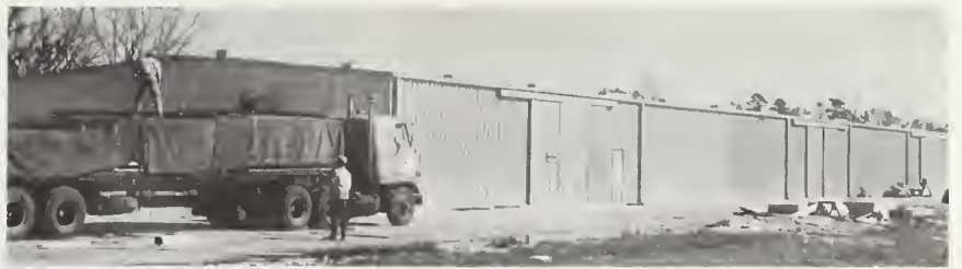
40 new jobs . . .