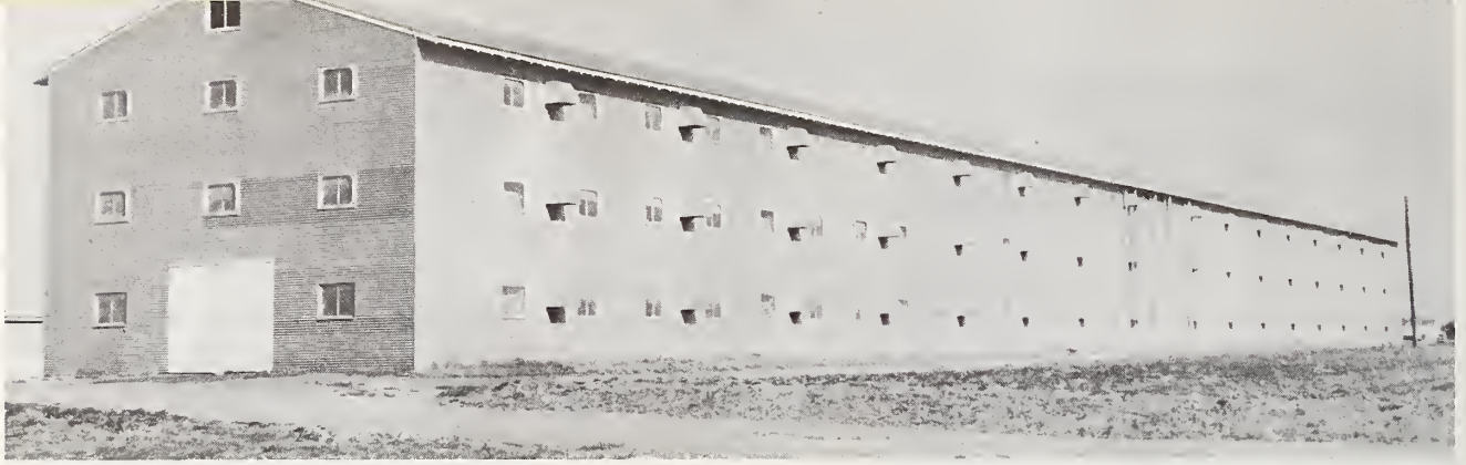
Modernizing facilities was a major method used by Delmarva poultrymen to improve their competitive position. Above is a modern chick motel with central heat, insulation, mechanical ventilation, and auger type mechanical feeders. At right, Ed Ralph, associate county agent of Sussex County, inspects one of the ventilating fans in a broiler house under construction.

Long secure in top position, Delmarva poultrymen find that . . .