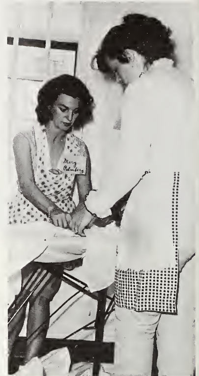
A volunteer Extension homemaker shows a teenaged mental patient how to iron ruffled curtains.

The grooming class included makeup, learning to walk and sit gracefully, physical fitness exercises, and