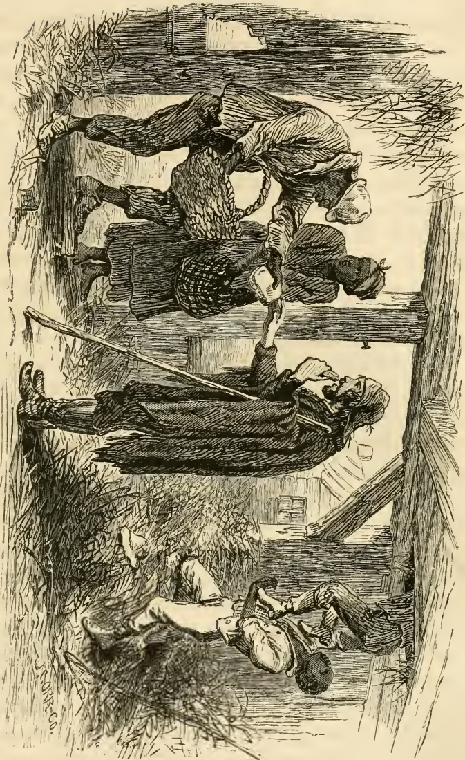
THE ESCAPED CORRESPONDENTS ENJOYING THE NEGRO'S HOSPITALITY.