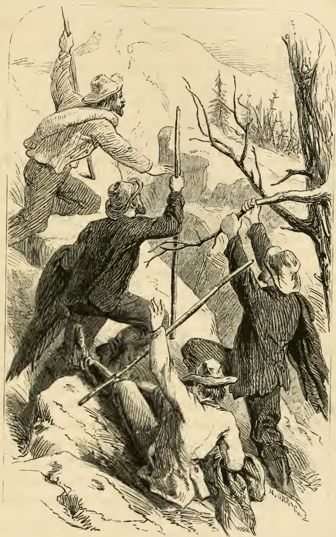
THE BOHEMIANS CLIMBING THE MOUNTAINS