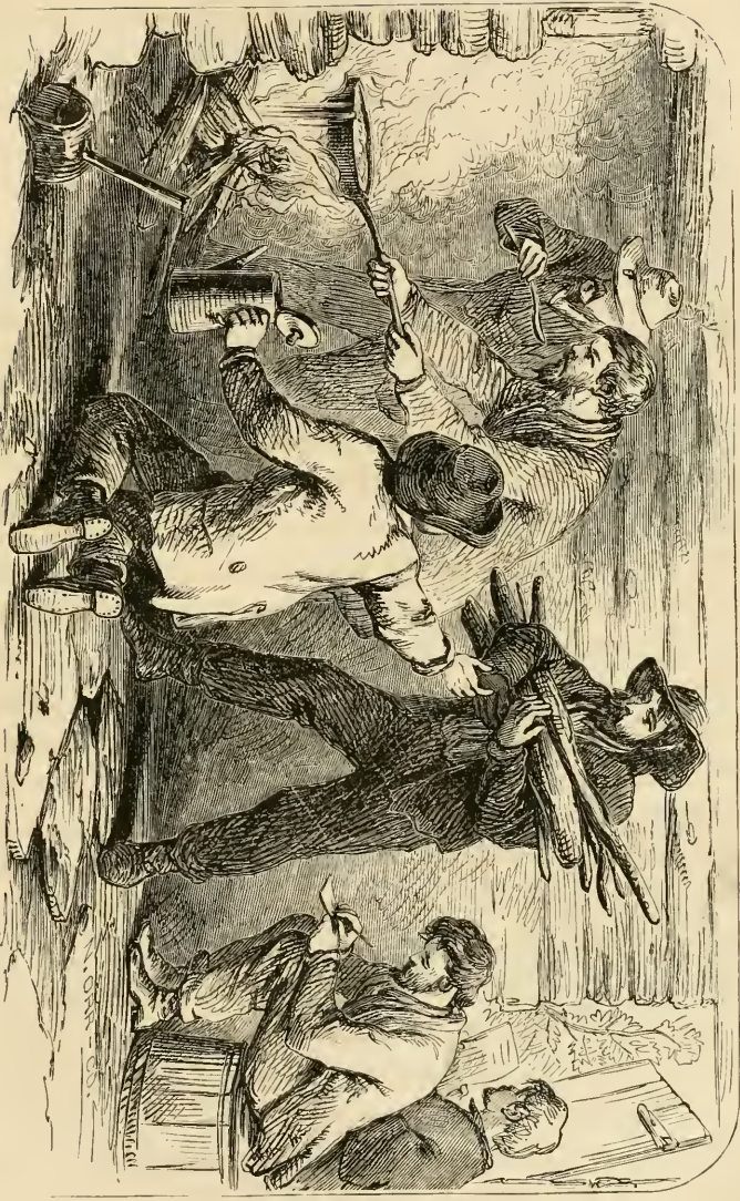
THE BOHEMIANS AS HOUSEKEEPERS.