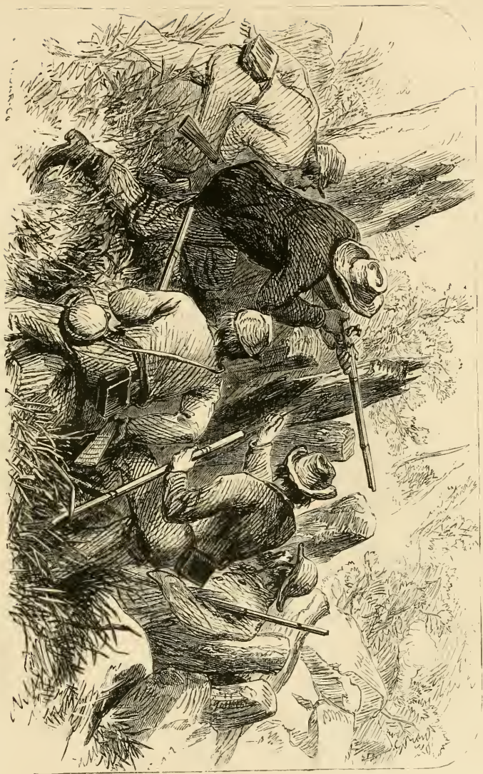
BOHEMIA AS A BELLIGERENT