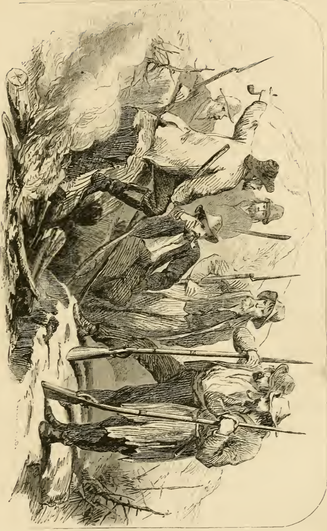
CONFERENCE OF THE CORRESPONDENTS WITH BUSHWHACKERS