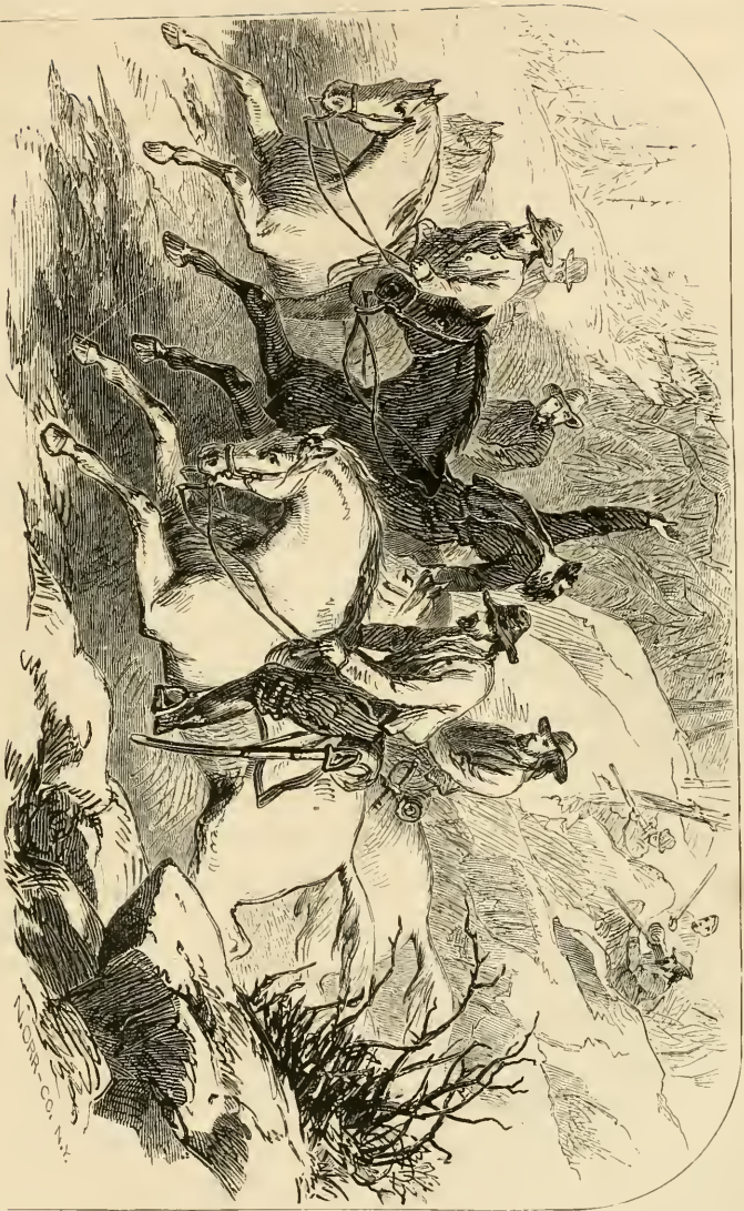
UNION BUSHWHACKERS ATTACKING REBEL CAVALRY.