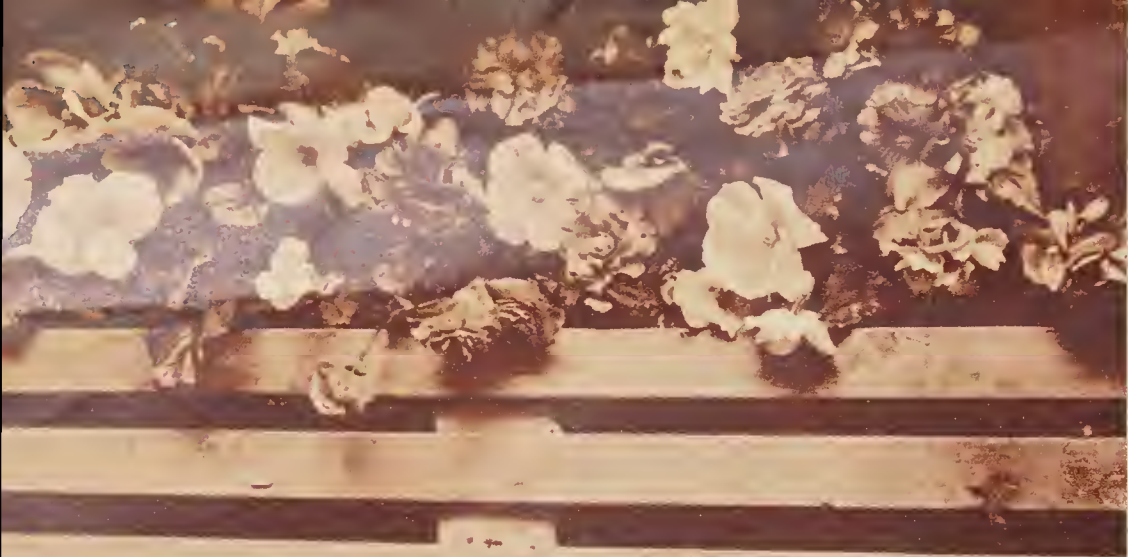
Window-box with Begonias