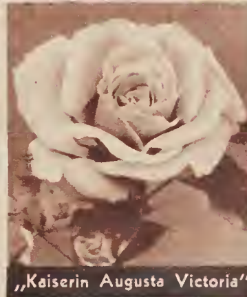
„Kaiserin Augusta Victoria“