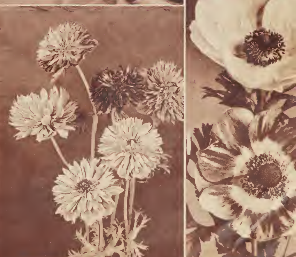
St. Brigid Anemones