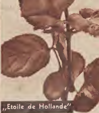
„Etoile de Hollande“