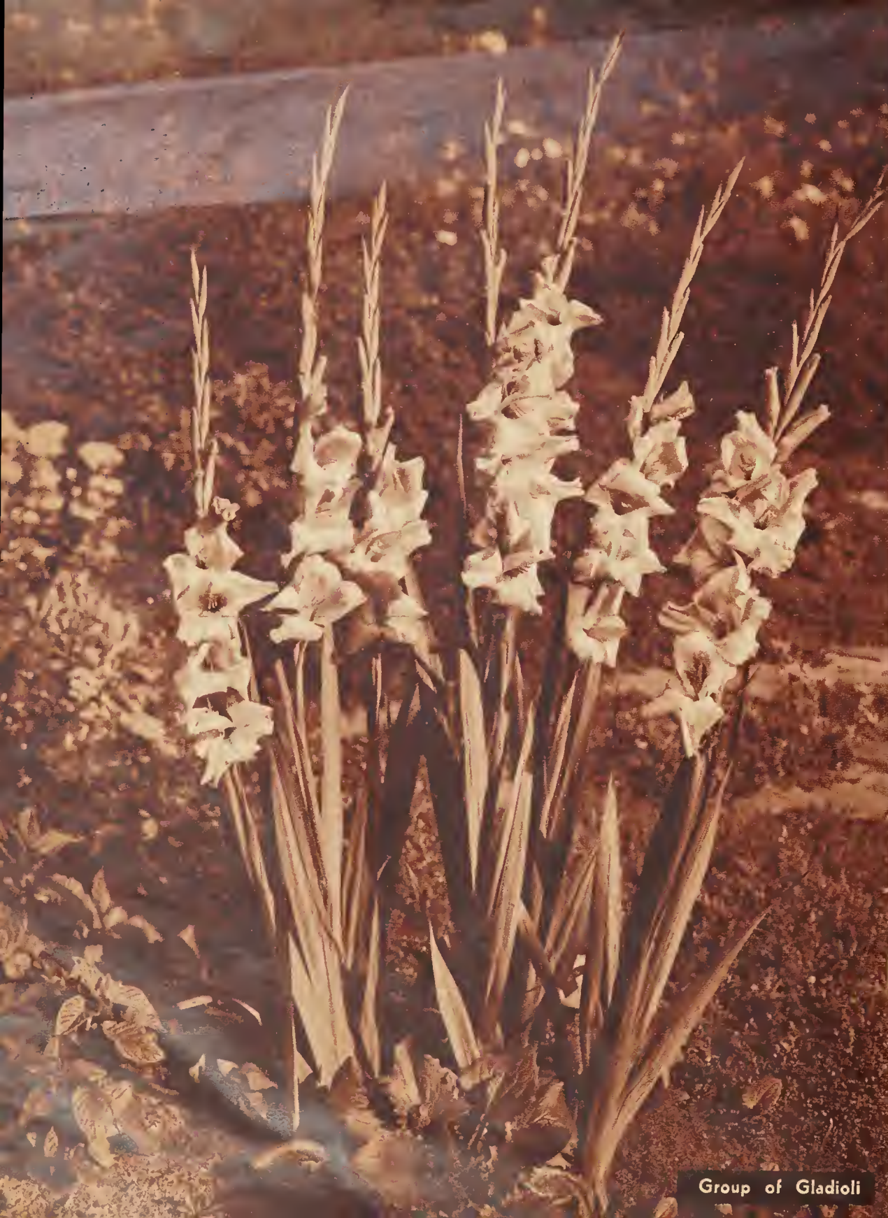
Group of Gladioli