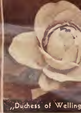
„Duchess of Wellington“