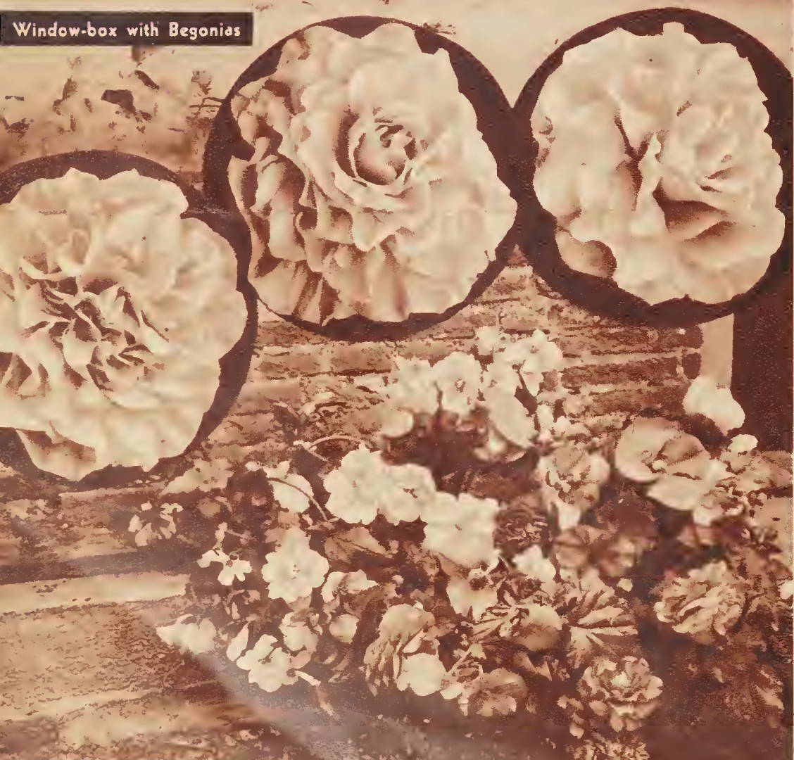
Group of Begonias