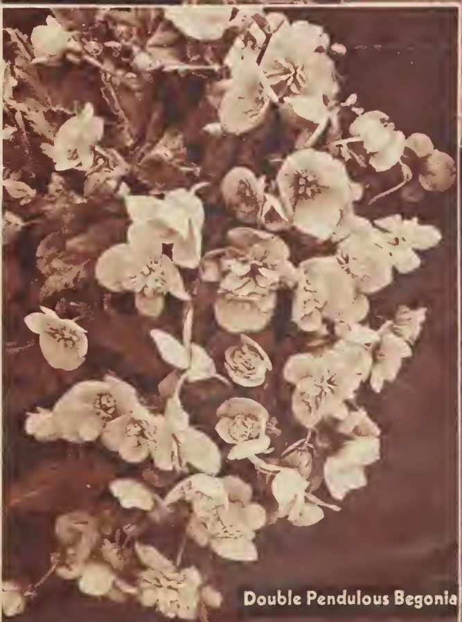
Double Pendulous Begonia