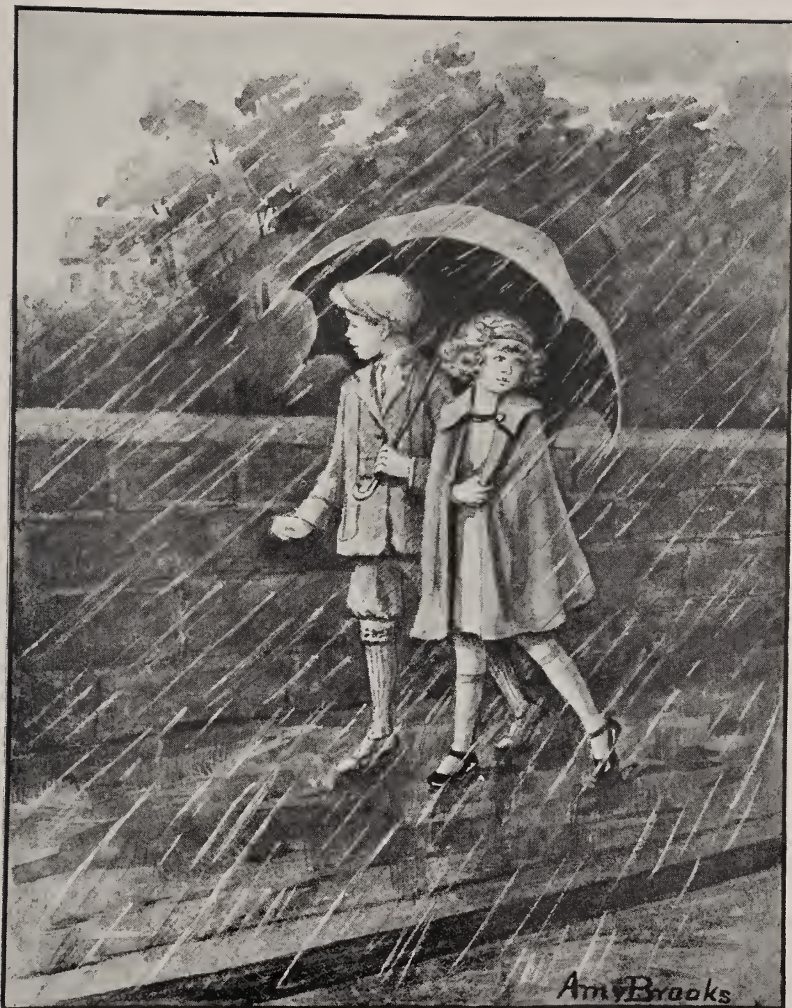
SOMETIMES THE UMBRELLA SHIELDED HER FROM THE RAINDROPS. Page 90.