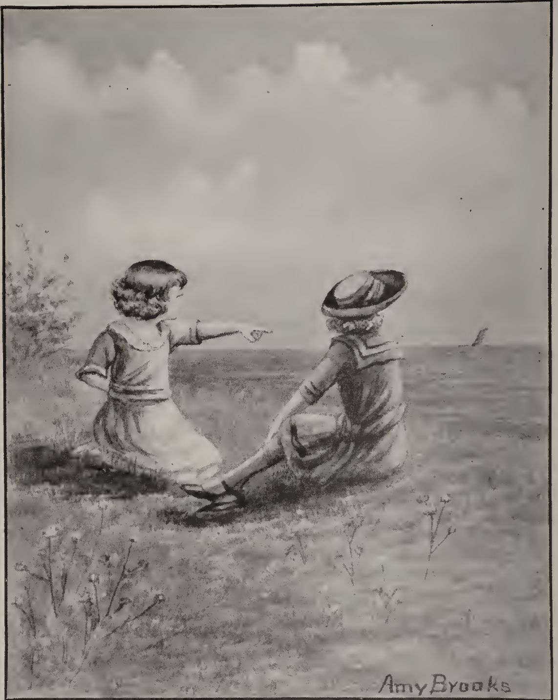
"SEE THAT SAIL OUT THERE!"—Page 15.