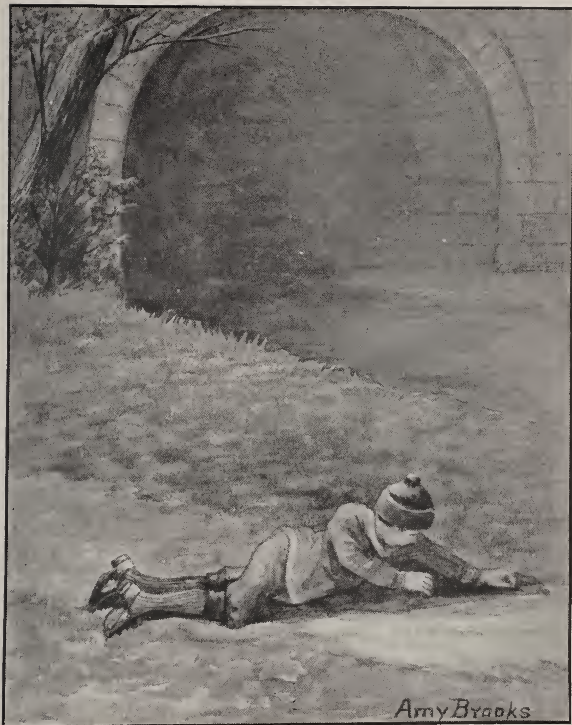
NOT FAR FROM THE BRIDGE LAY STANTON GIFFORD.—Page 163.