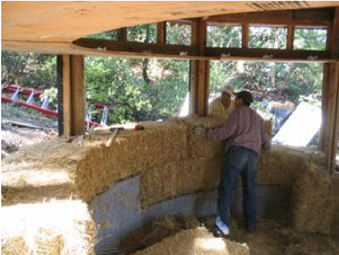
Figure 1 An example of a tightly curved wall with flat bales (project: John Swearingen)

"Curved walls are fun, pleasing to the eye, and create glorious light patterns. But they are deceptively time consuming! I can build three flat walls for the price of one curved wall. And it has all to do with the foundation, curbs, window bucks, window flashing, roof details." (Straw Bale contractor Frank Tettmer of Living Sol)