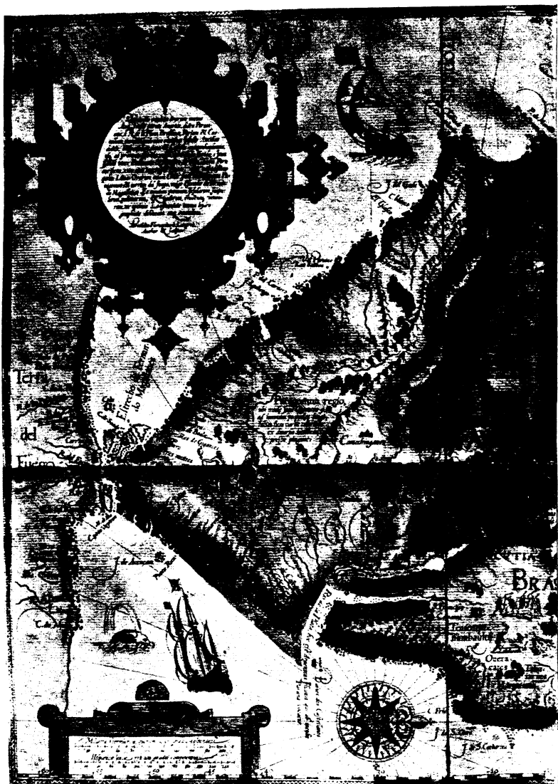
Map of South America and An- Jan Huygen van Linschoten