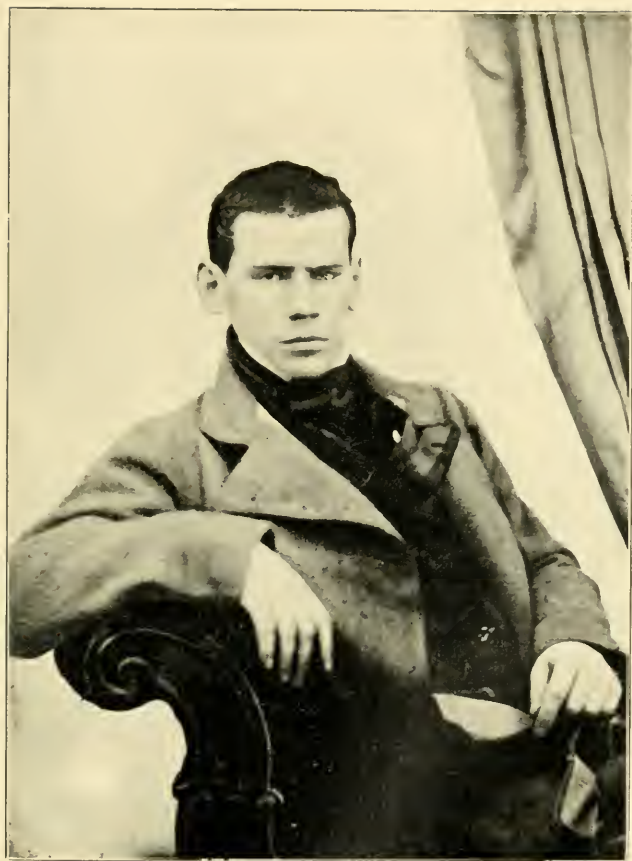
TOLSTOY IN 1848, AFTER HE HAD LEFT THE UNIVERSITY.