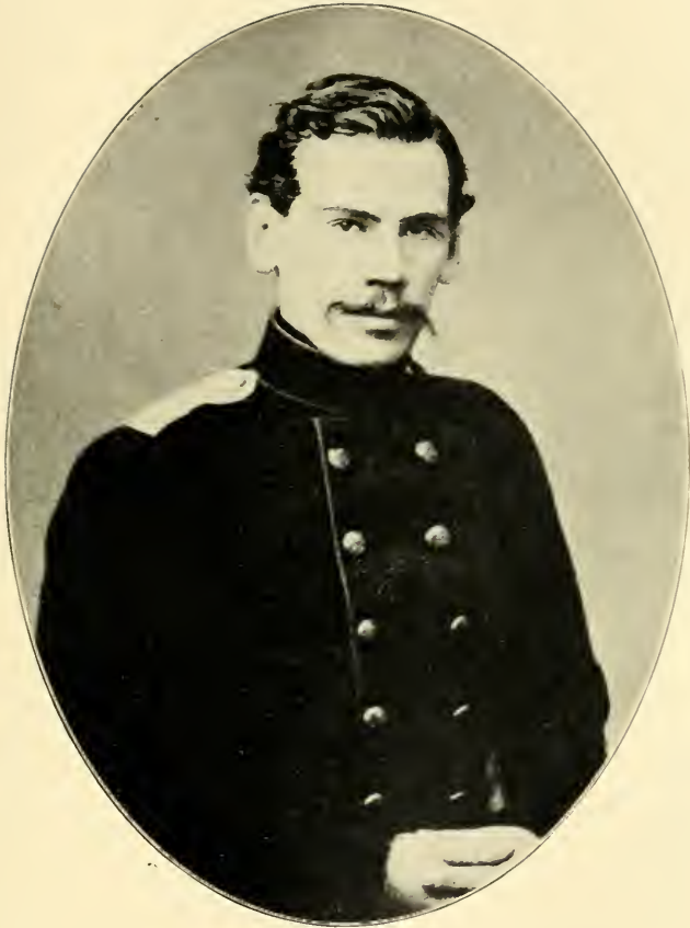
TOLSTOY IN 1856, THE YEAR HE LEFT THE ARMY.