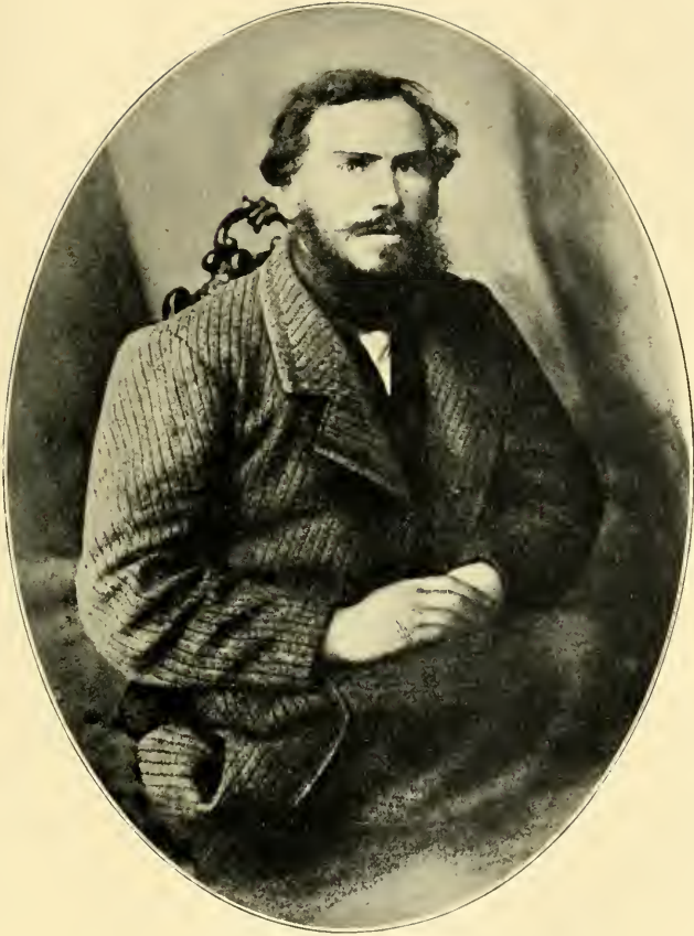
TOLSTOY IN 1862, THE YEAR OF HIS MARRIAGE.