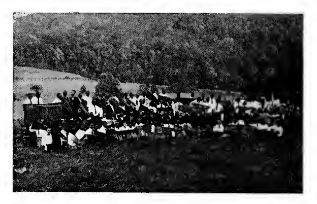
A SUMMER CONFERENCE OF COLORED STUDENT ASSOCIATIONS

In practically every Negro college the Association is standing for positive Christian standards both in personal and in community life. In the white colleges an active program is well under way for promoting both among faculties and students a thorough study of Negro life and the Christian basis of race relationships.