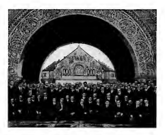
A CONFERENCE HELD TO CONSIDER THE MINISTRY AS A LIFE WORK

The Association encourages such activities as will give this training, and furnishes a clearing house for sharing methods and ideas. Through the Association also theological students have a clearance for helpful relations to the other students of their own generation.