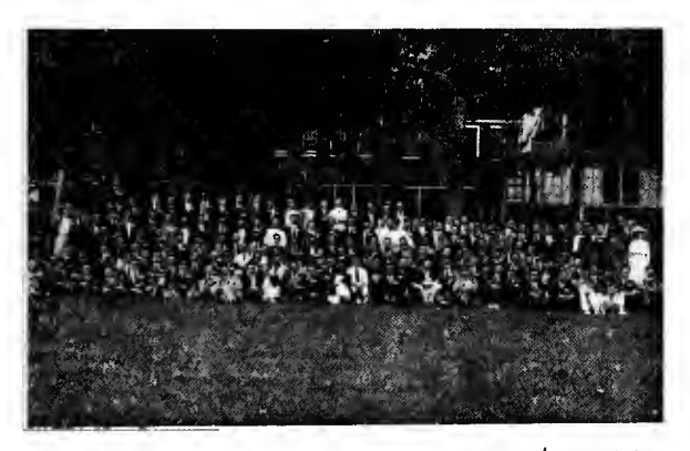
225 FOREIGN STUDENTS, REPRESENTING 28 NATIONS, AT ONE SUMMER CONFERENCE

The Associations in the universities extend genuine Christian courtesy to these visitors, open doors whereby they may come to know the Christian homes and all the best in American life, and help in any occasion of need.