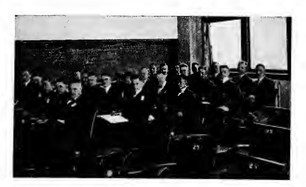
A CLASS IN RURAL LEADERSHIP AT A STATE AGRICULTURAL COLLEGE

Study of scientific methods and farm economics will not suffice. These men must take the lead in establishing a healthy social and religious life in these communities. The Association is established in all of these colleges, and its program is projected with this broad objective, and with the hearty support of the college faculties.