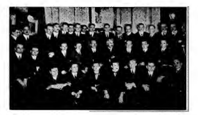
A BIBLE CLASS OF MEDICAL STUDENTS

The medical course makes the most severe demands upon its students. There is no time free for the normal Association activities. Nevertheless, mindful of the need for conserving the high ideals which prompted the choice of his profession, and of the unique opportunity of the Christian physician, the Association has adapted its program to meet the taxing schedule of these men and serves them, especially emphasizing the Christian and ethical side of the physician's work.