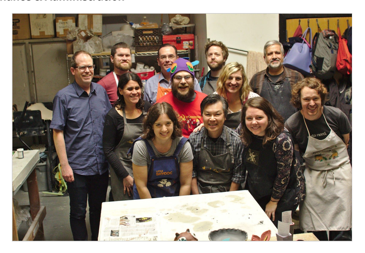
Wiki Education Foundation staff after a few hours in the clay sculpture lab.

Remote staff traveled to San Francisco to join local staff in a four-day All Staff meeting. We celebrated successes of the last four years, reviewed the learnings and accomplishments from the Year of Science initiative, and kicked off the annual planning process for next fiscal year. On the final day, staff visited <a href="The Crucible">The Crucible</a>, an arts education center in Oakland, where they created clay sculptures.