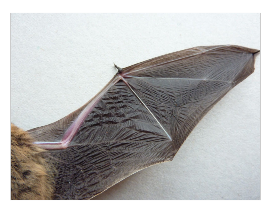
A student in Emily Sessa's Principles of Systematic Biology class created Wikipedia's article about bat flight.