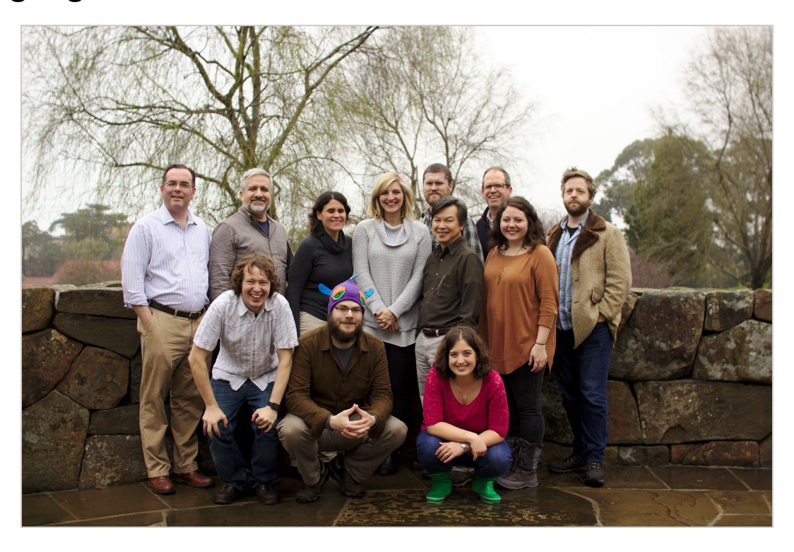
Wiki Education Foundation all-staff meeting, February 2017

• Local and remote staff connected for an all-staff meeting in San Francisco's Presidio. Staff shared Year of Science reflections, celebrated last year's successes, and kicked off the annual planning process for the next fiscal year.