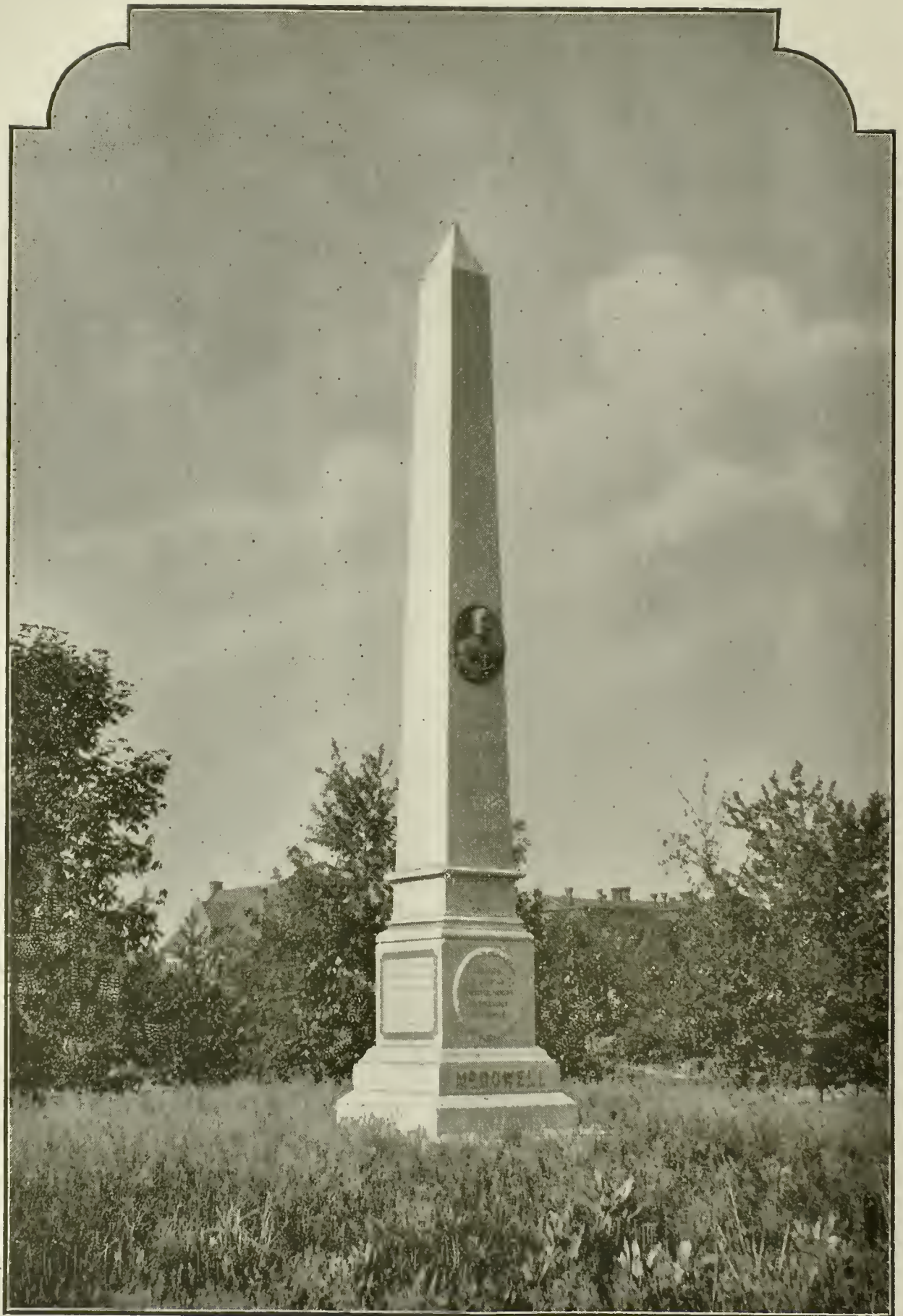
MCDOWELL MONUMENT. DANVILLE, KENTUCKY. ERECTED IN 1879.