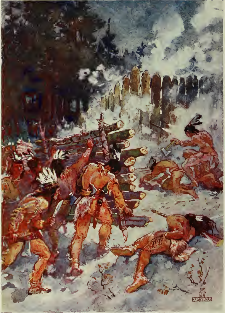
THE IROQUOIS ATTACKING DOLLARD'S STOCKADE.