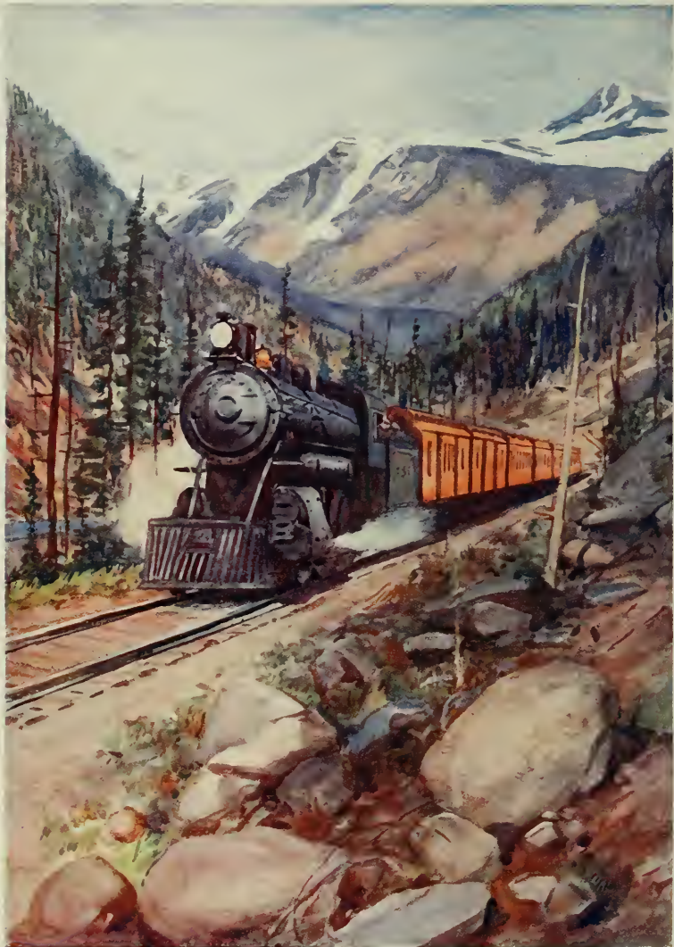
"THE SHIP OF THE PRAIRIE."