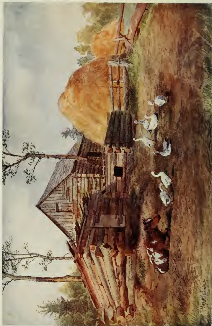
A SETTLER'S FARM YARD.