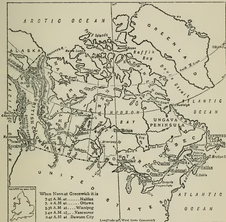
SKETCH-MAP OF CANADA.