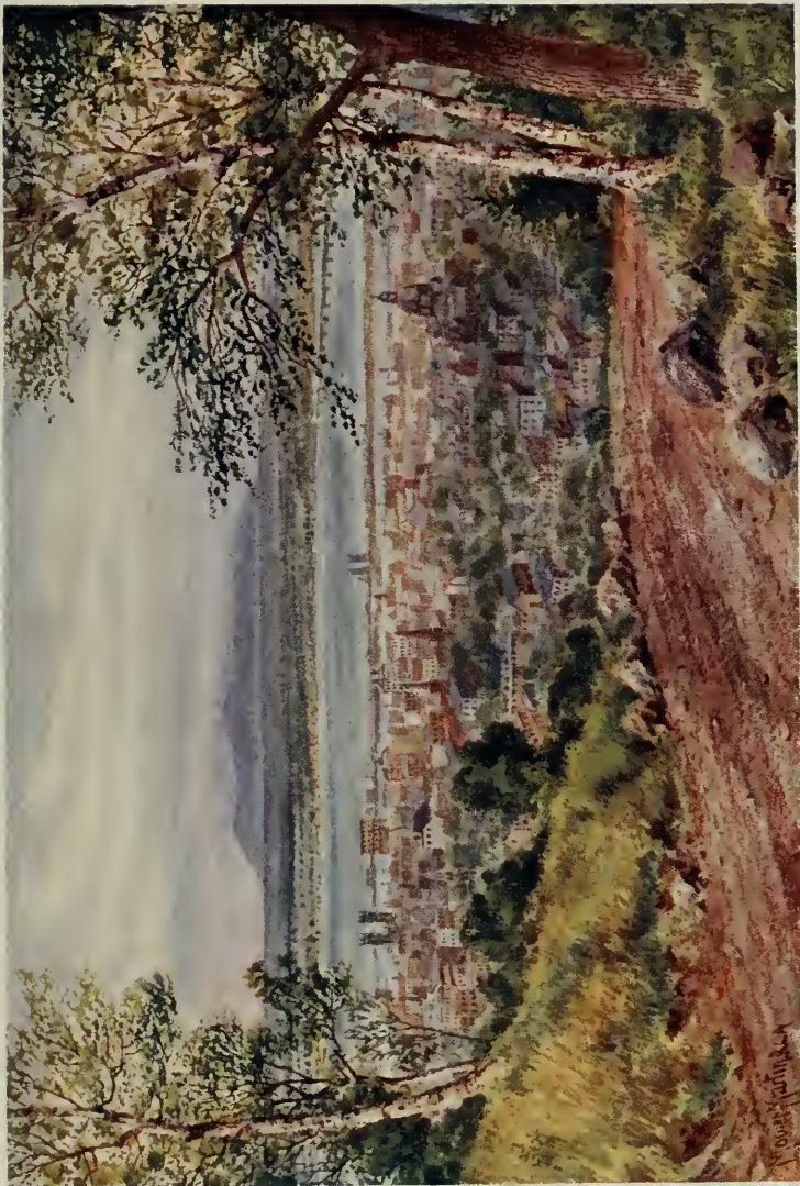
MONTREAL AND THE RIVER ST. LAWRENCE. PAGE 79.