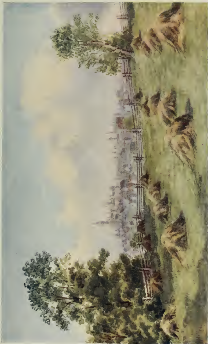
OTTAWA, PAGE 80.