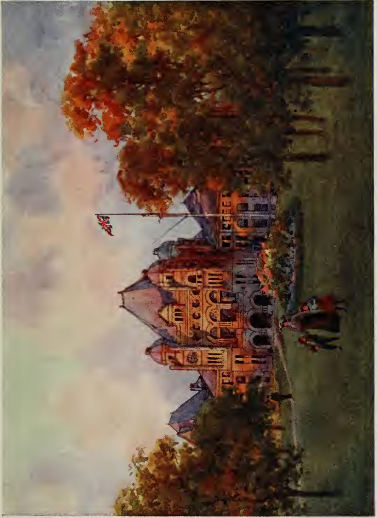
PARLIAMENT BUILDINGS, TORONTO.