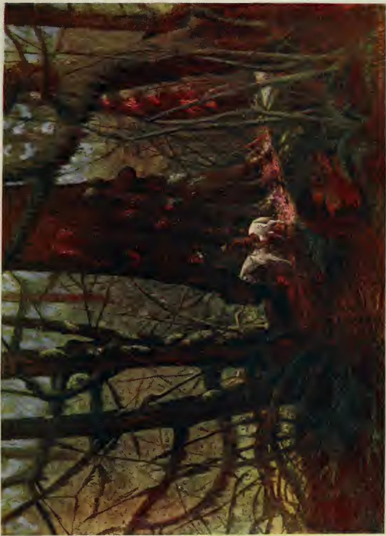
BIG FOREST TREES, BRITISH COLUMBIA CHAPTER II.