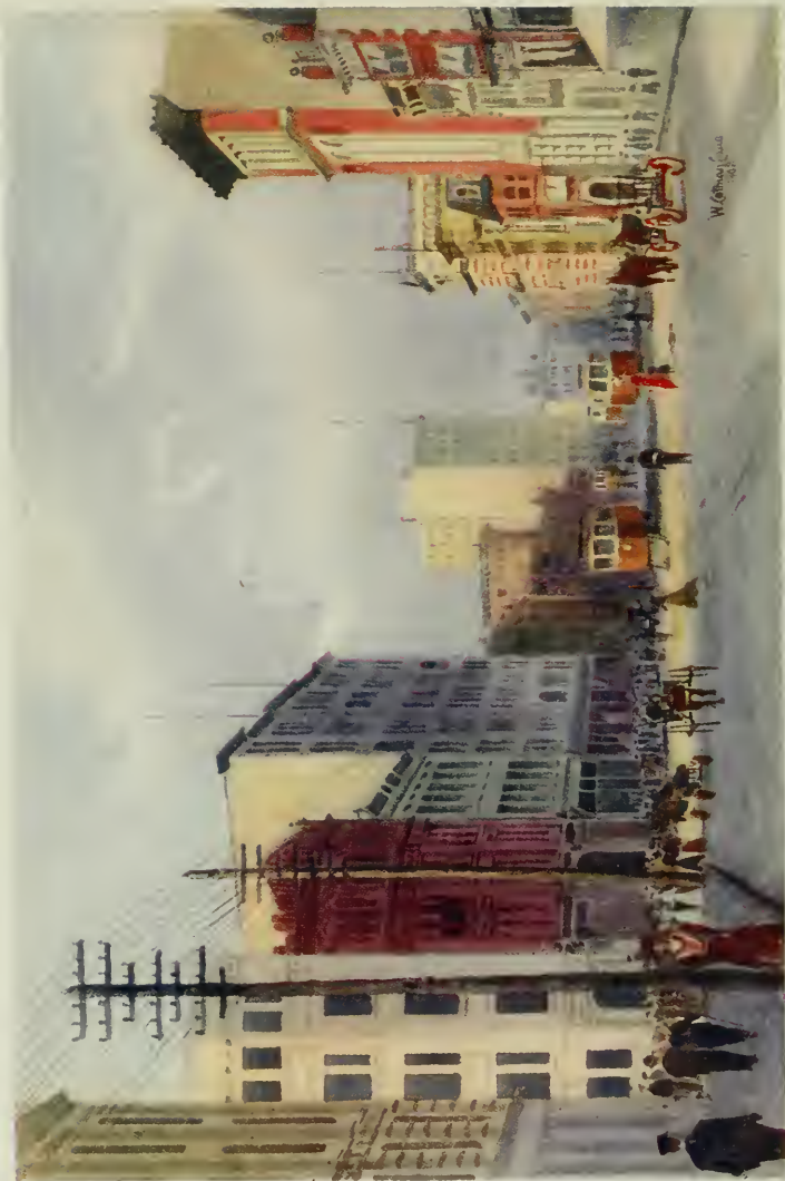
MAIN STREET, WINNIPEG. PAGE 50.