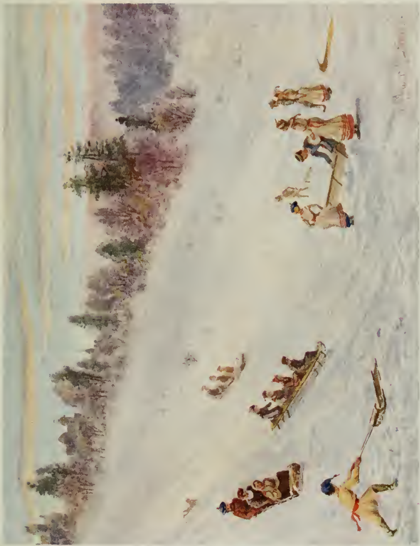
TOBOGGANING AT ROSEDALE, TORONTO.