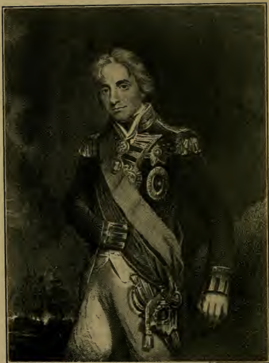
Horatio, Viscount Nelson.