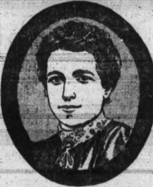
This woman says Lydia E. Pinkham's Vegetable Compound cured her. Read her letter.