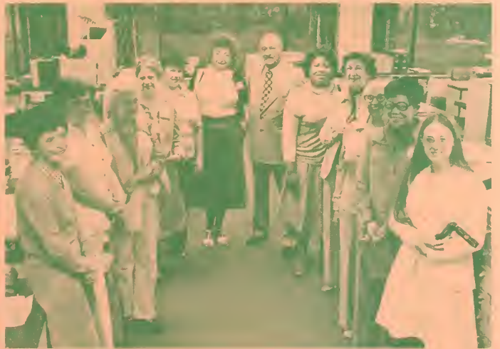
RECENT PARTICIPANTS in GPO's Library and Statutory Distribution Service Workshops.