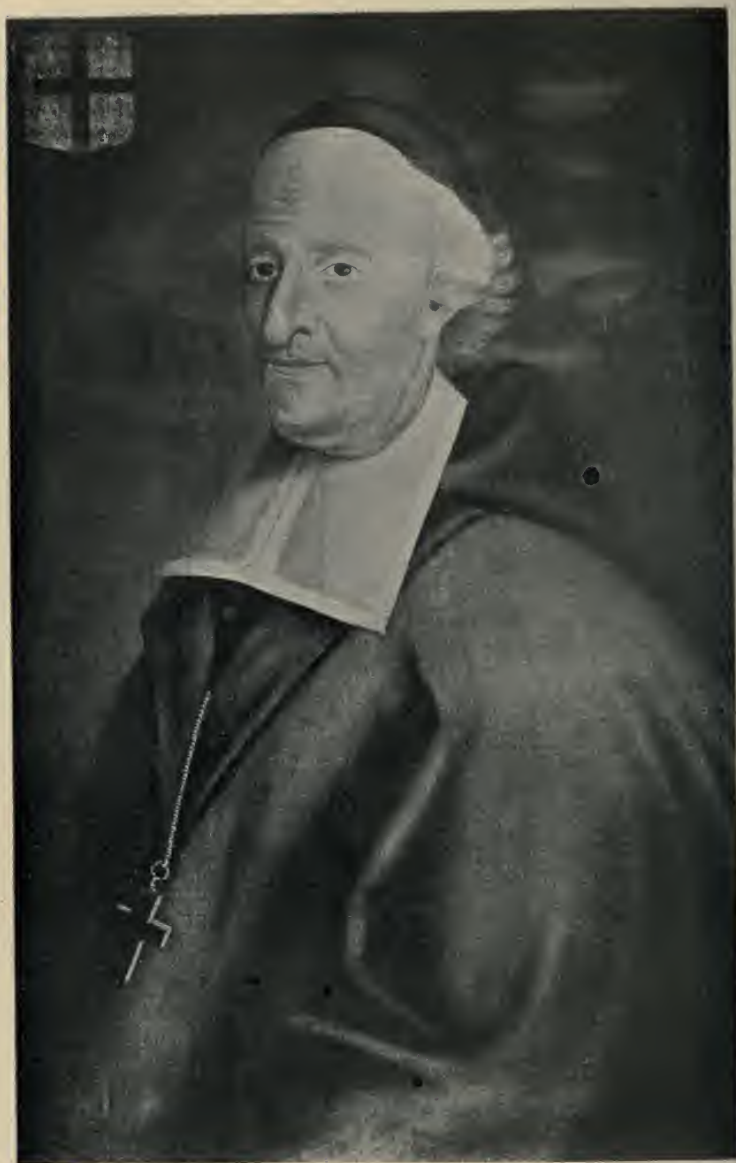
FRANÇOIS XAVIER DE LAVAL-MONTMORENCY.