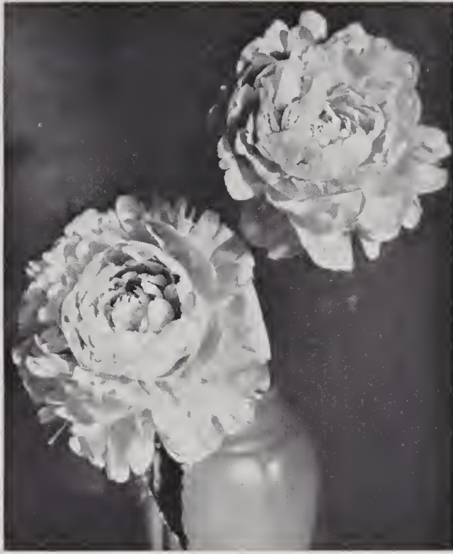
MARTHA BULLOCK Rose pink, tallest and largest of the rose type.