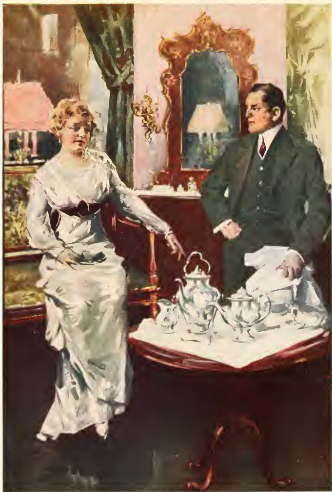
HE SEEMED PRE-OCCUPIED AND WORRIED; AND SHE FED HIM BEFORE QUESTIONING HIM