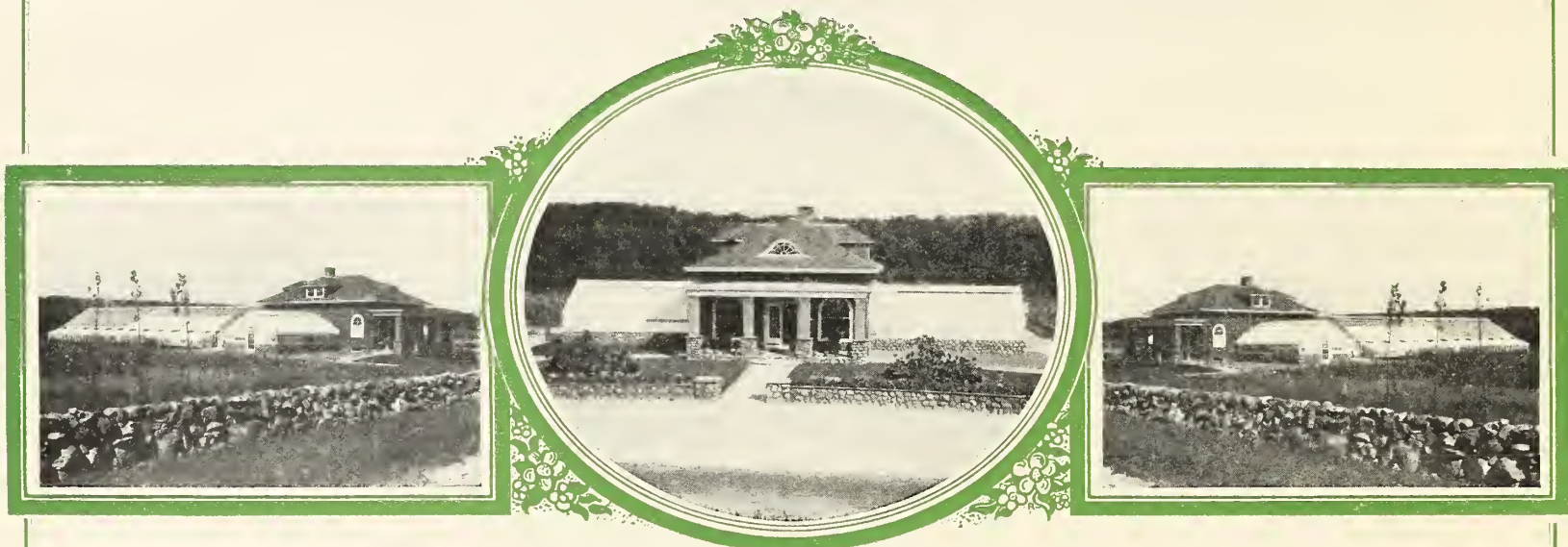
THREE VIEWS OF HAV-A-LOOK GARDENS

In view of the time and energy consumed in getting started we have until now, been unable to turn our attention to the issue of any catalog. We offer you in lieu of an elaborate catalog, this little