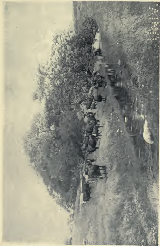
A BUNCH OF CATTLE.