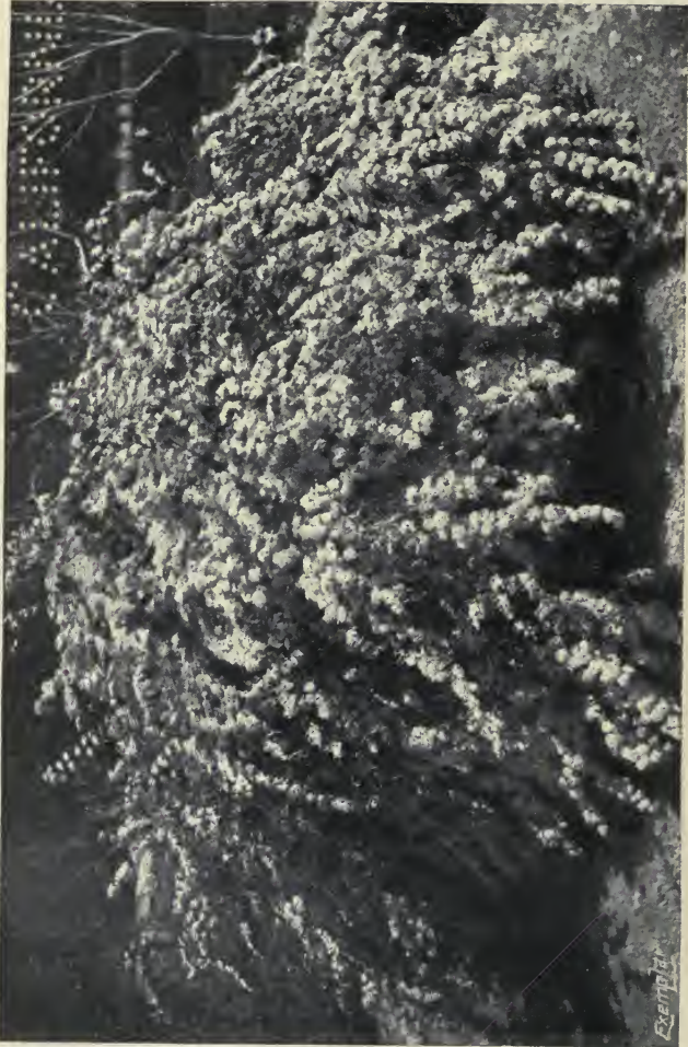
A ROSE BUSH IN SOUTHERN CALIFORNIA.

CCCC CCCC CCCC CCCC CCCC CCCC CCCC CCCC CCCC CCCC CCCC CCCC CCCC CCCC CCCC CCCC CCCC