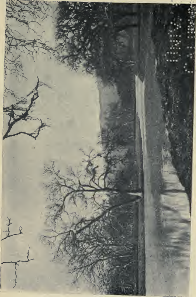
A CALIFORNIAN TROUT STREAM.