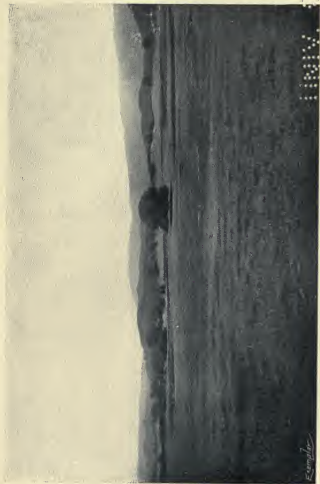
A CATTLE RANCH.