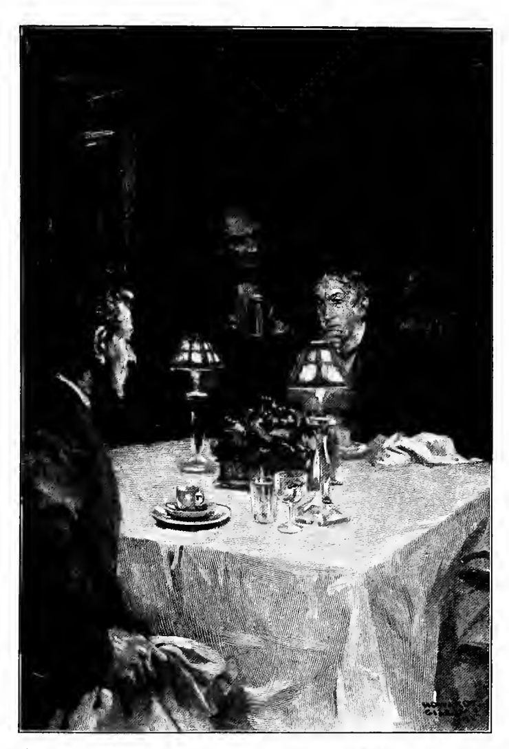
"THE TWO SAT GAZING AT EACH OTHER AS FROM MOUNTAIN PEAKS ACROSS IMPASSABLE VALLEYS."