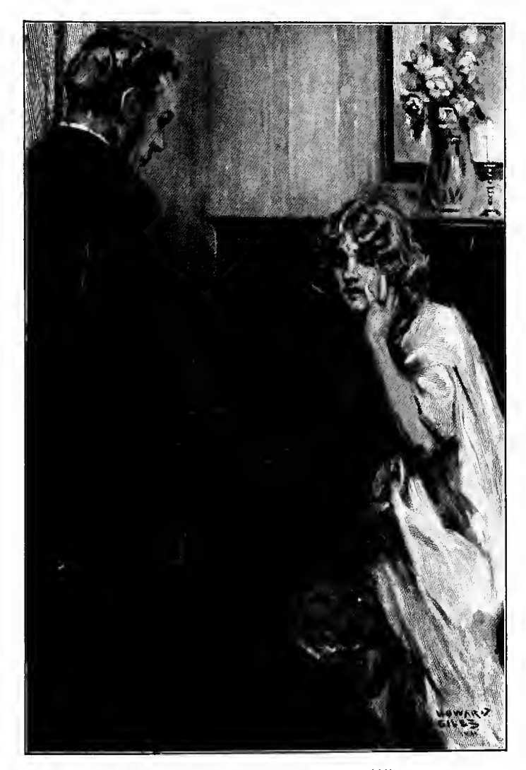
"'MY GOD, HOW YOU SCARED ME ! ""