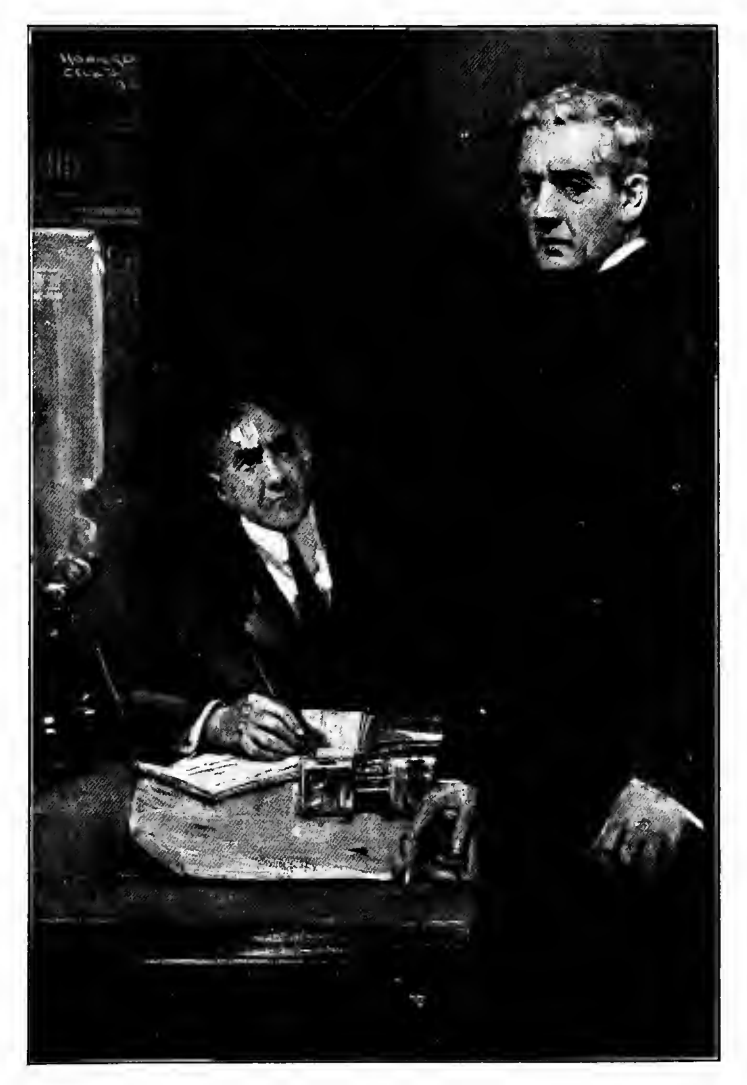
"'You'll want money for these people, I suppose,' he added rrutally."