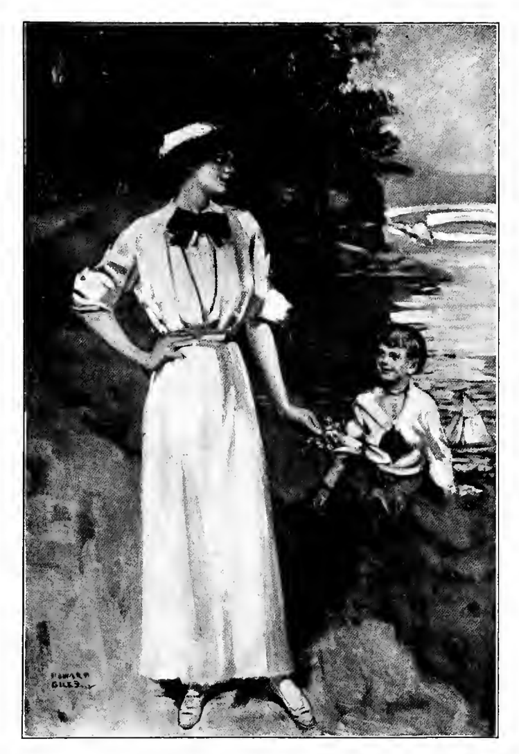
"' WHAT'S YOUR NAME?' SHE ASKED."