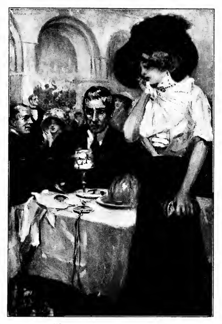
"'I GUESS I AIN'T HUNGRY AFTER ALL.""