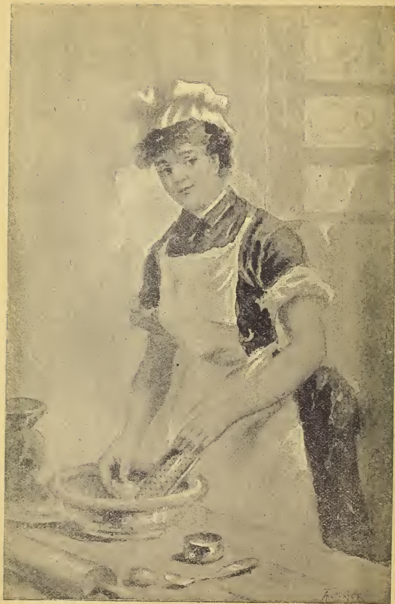
THE QUEEN OF HOME.