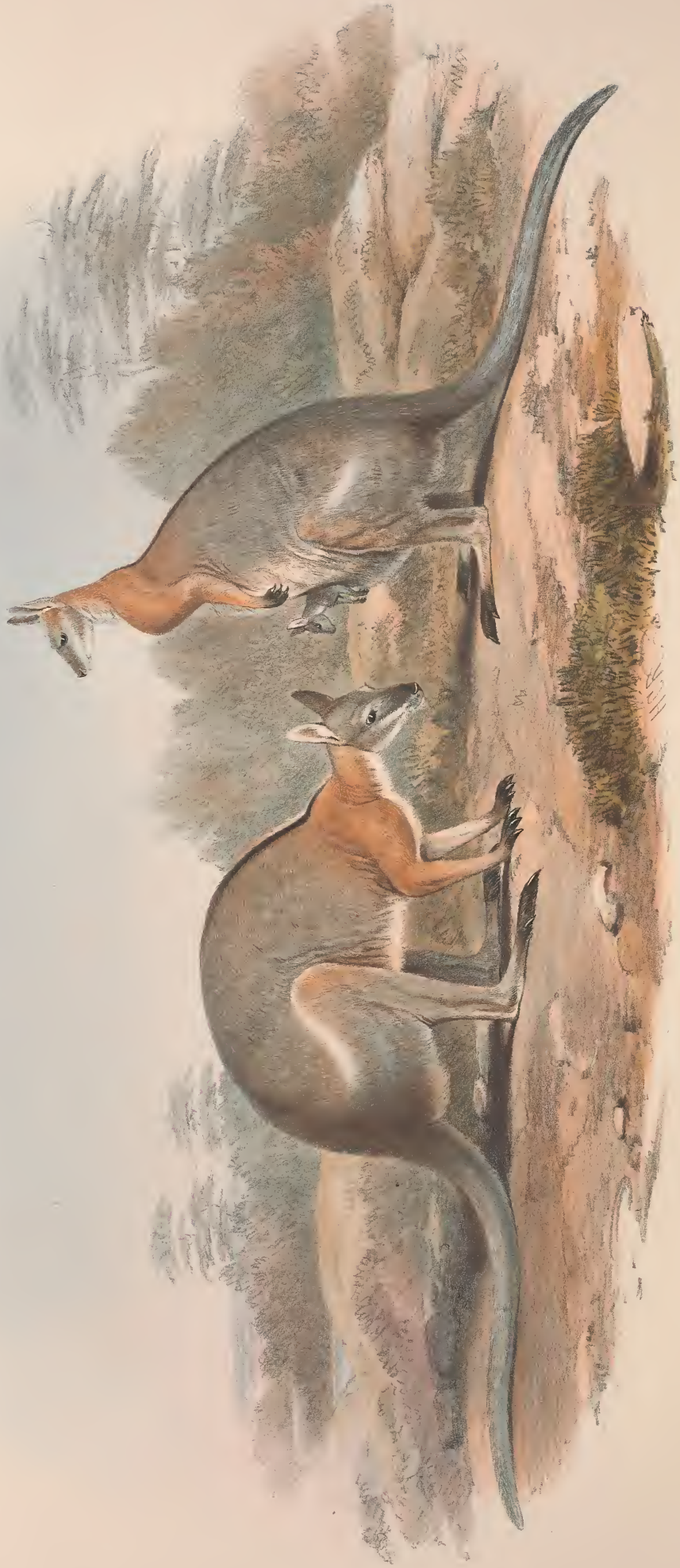
HALMANTHUS DORSALIS