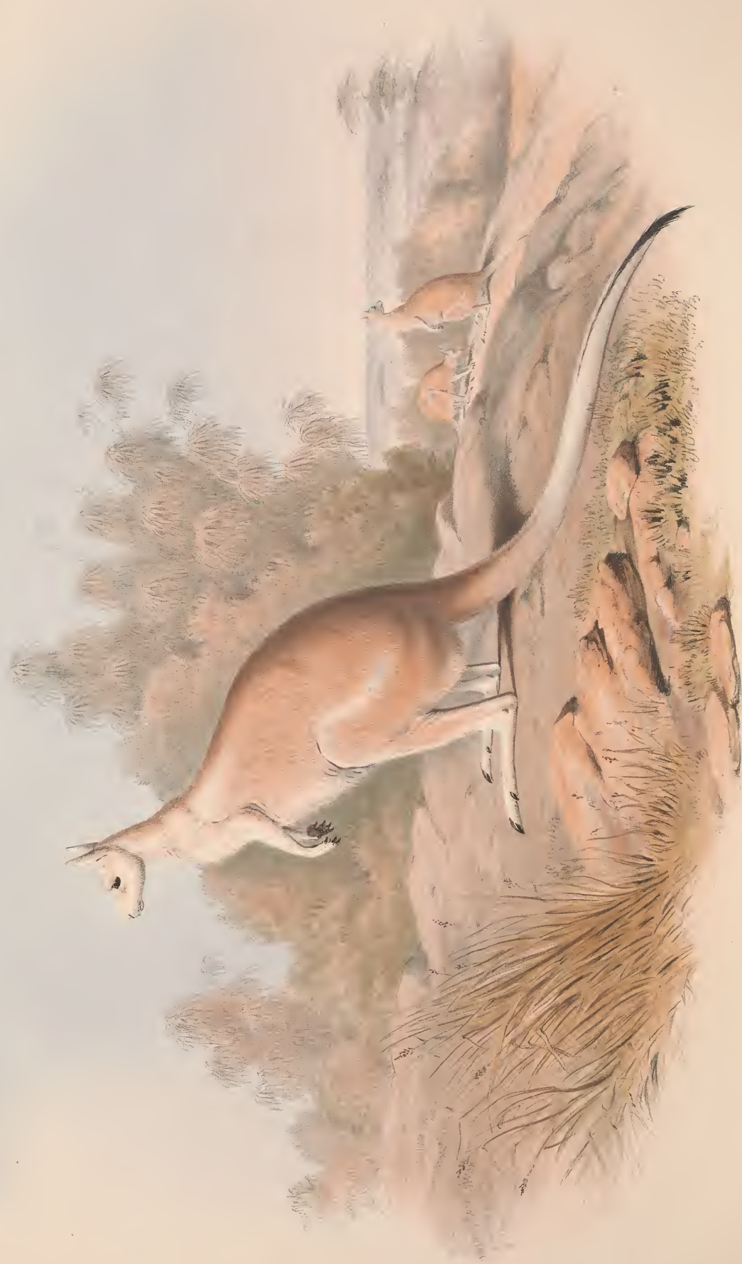
MACROPTUS UNGUIFER, Gould