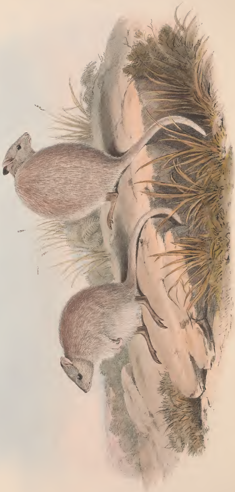
BETTONGIA RUFESCENS: Gray