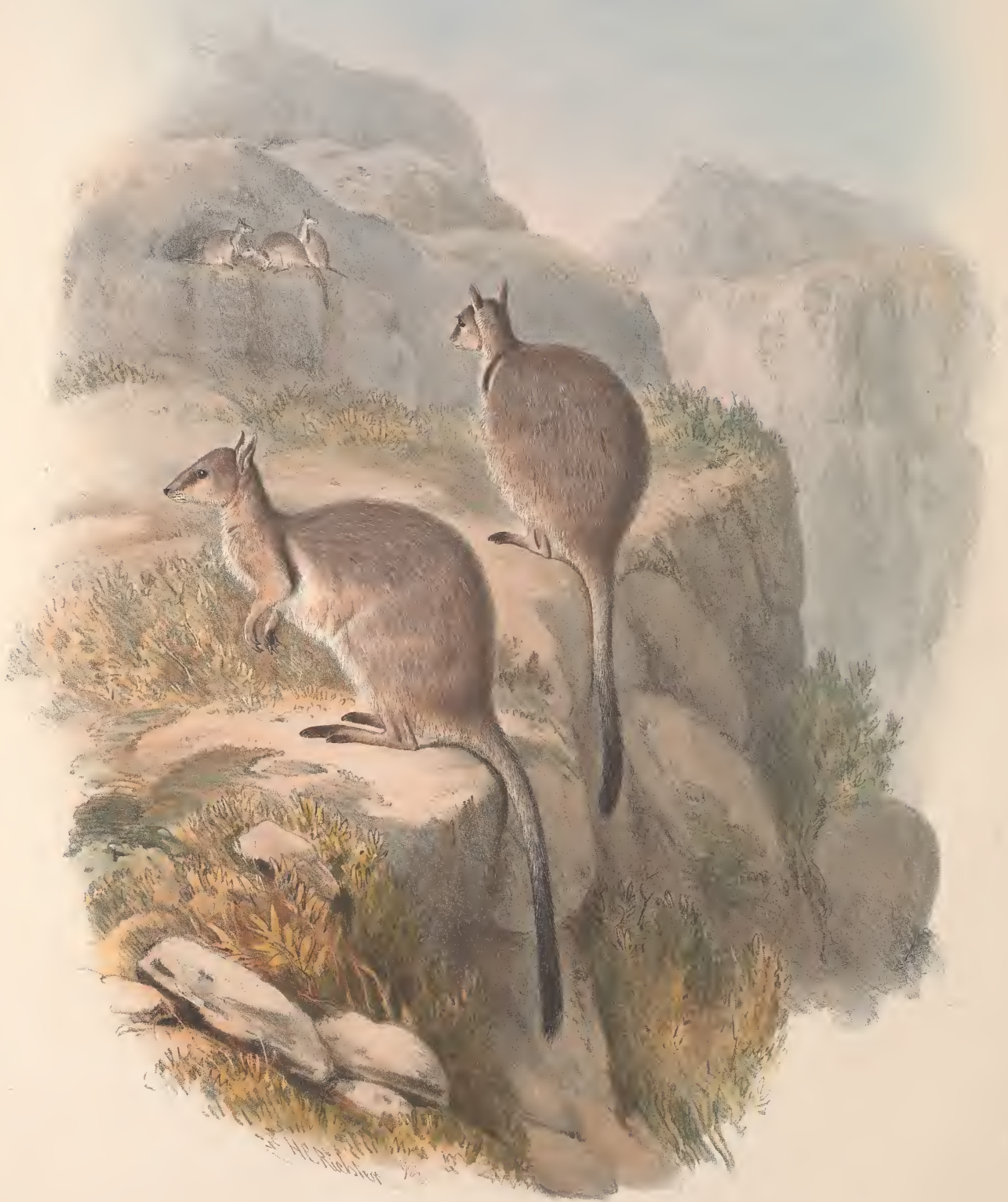
PETROGALE BRACHYOTIS, Coold