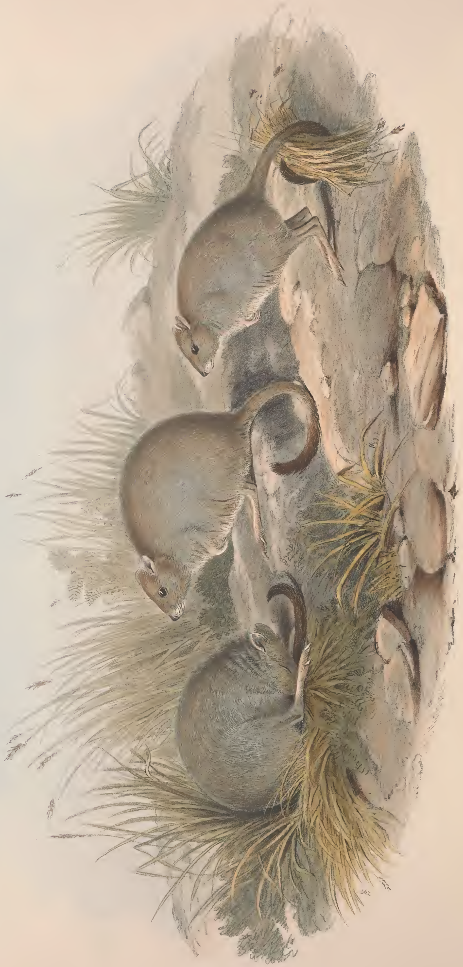
BETTONGIA PENICILLATA, Gray