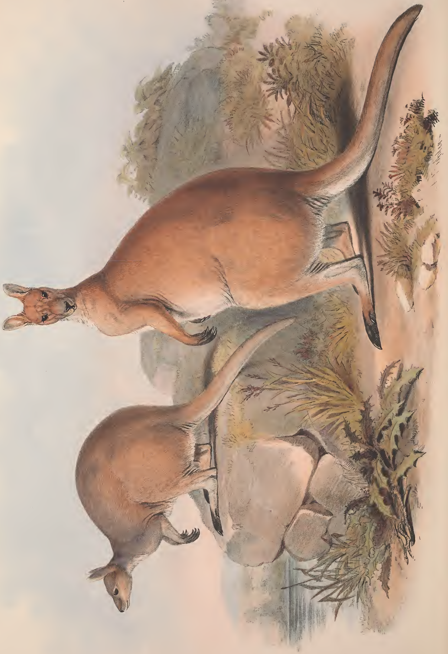
OSPHRANTER ANTILOPINUS: Gould