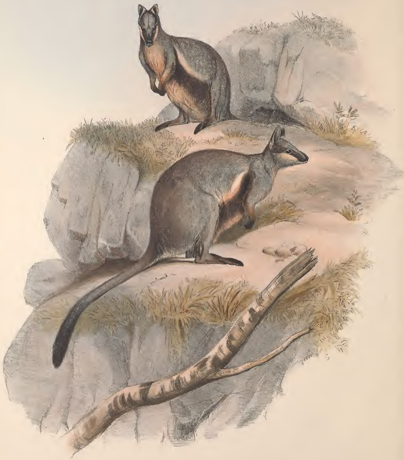
PROTODOLE GABRIEL Guthrie