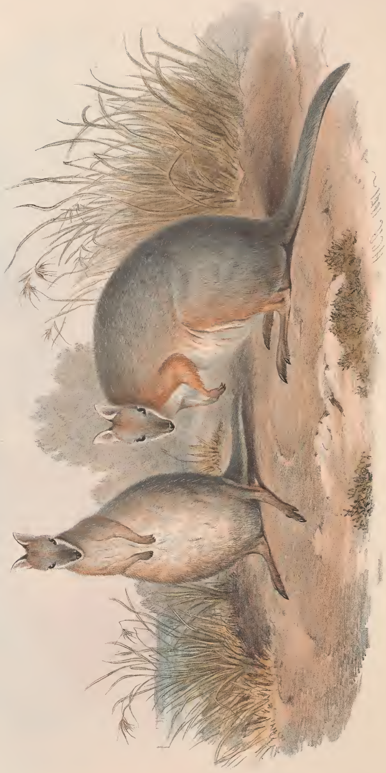
HALAMATURUS DREBLIANUS: Gray