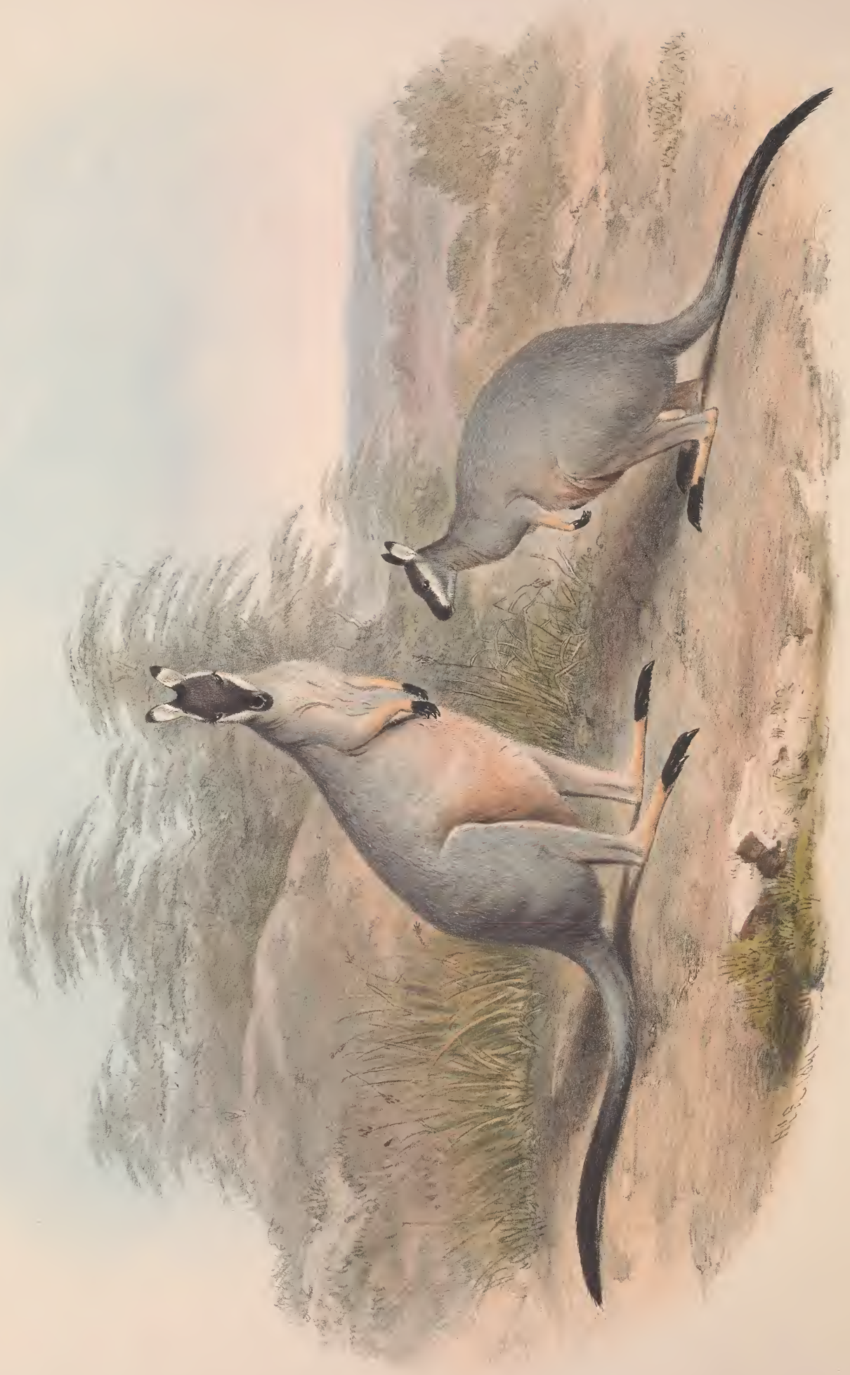
HALMATURUS MANICATUS, Gould