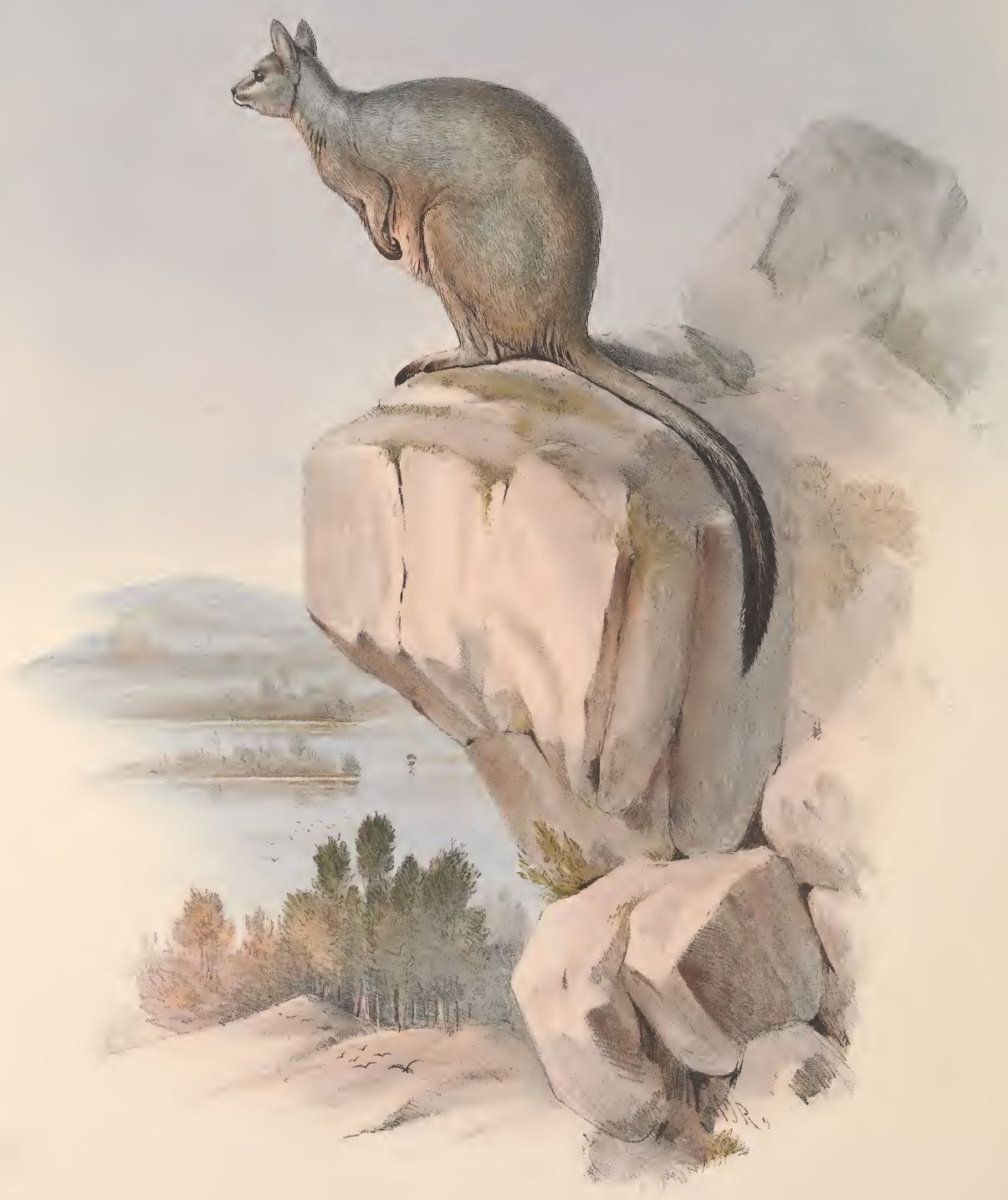
PETROGALE INORNATA: Gould.