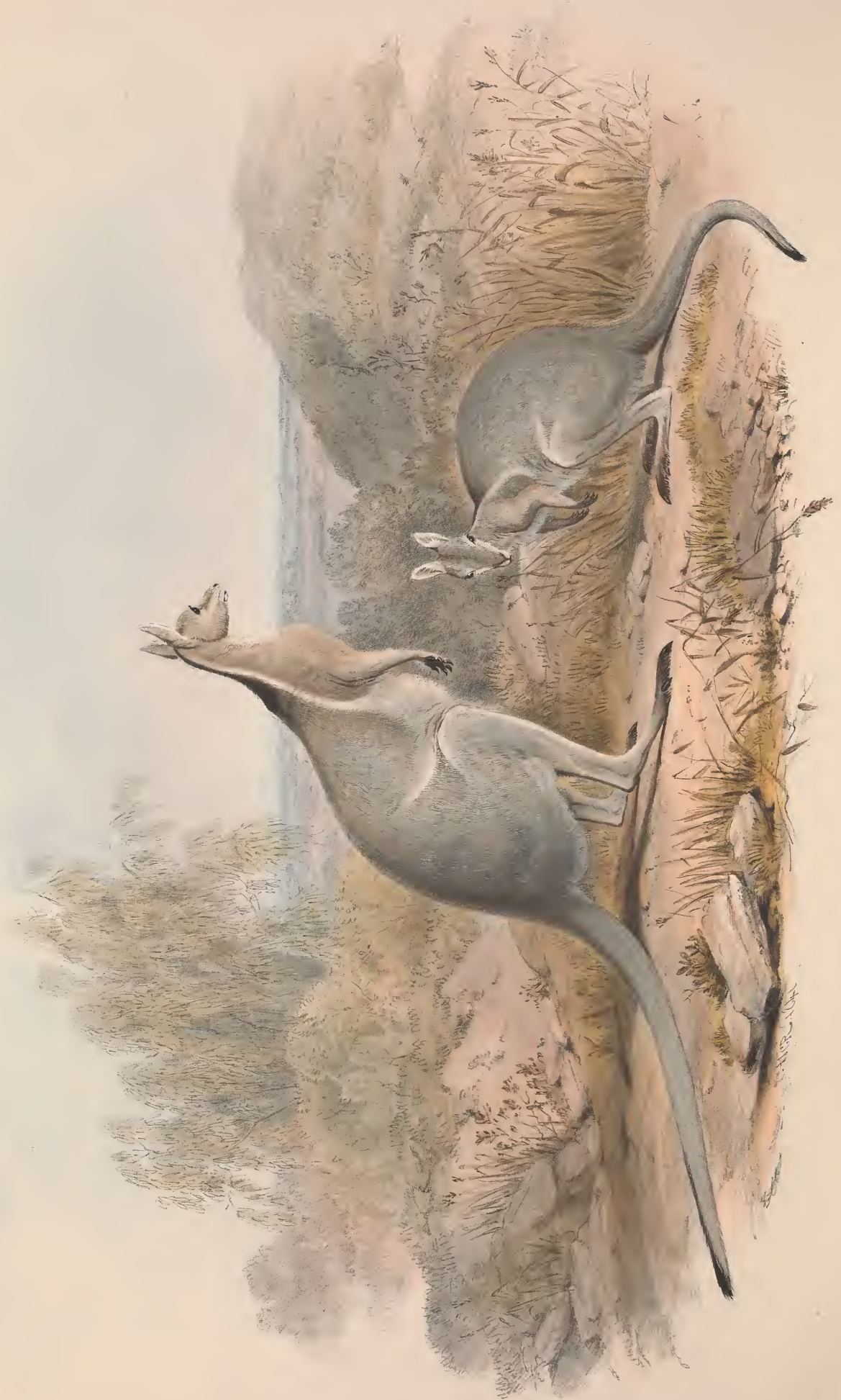
MACRORHINUS FRANKLINIUS, Gould.