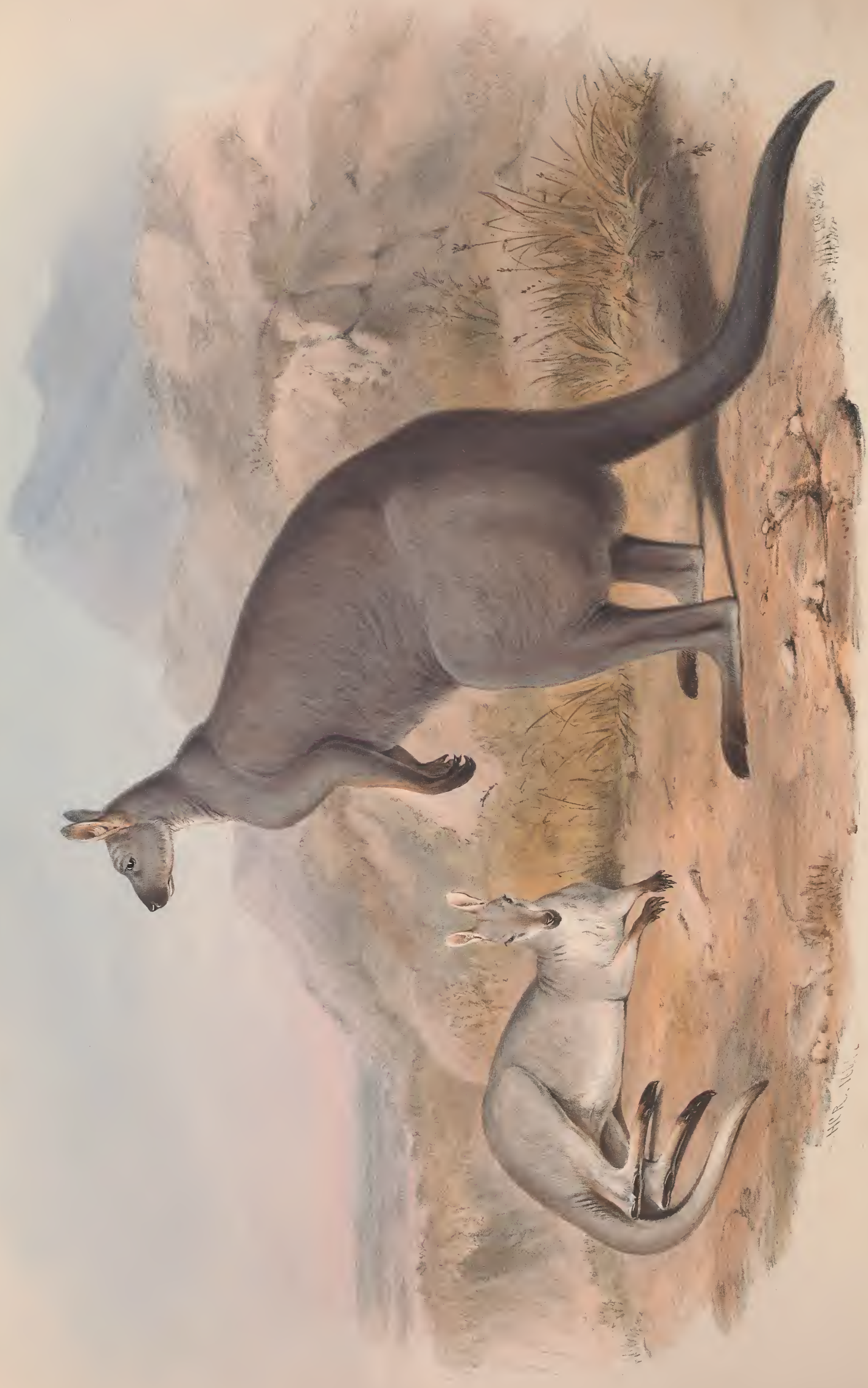
PETROGALLE ROBUSTUS, Gould