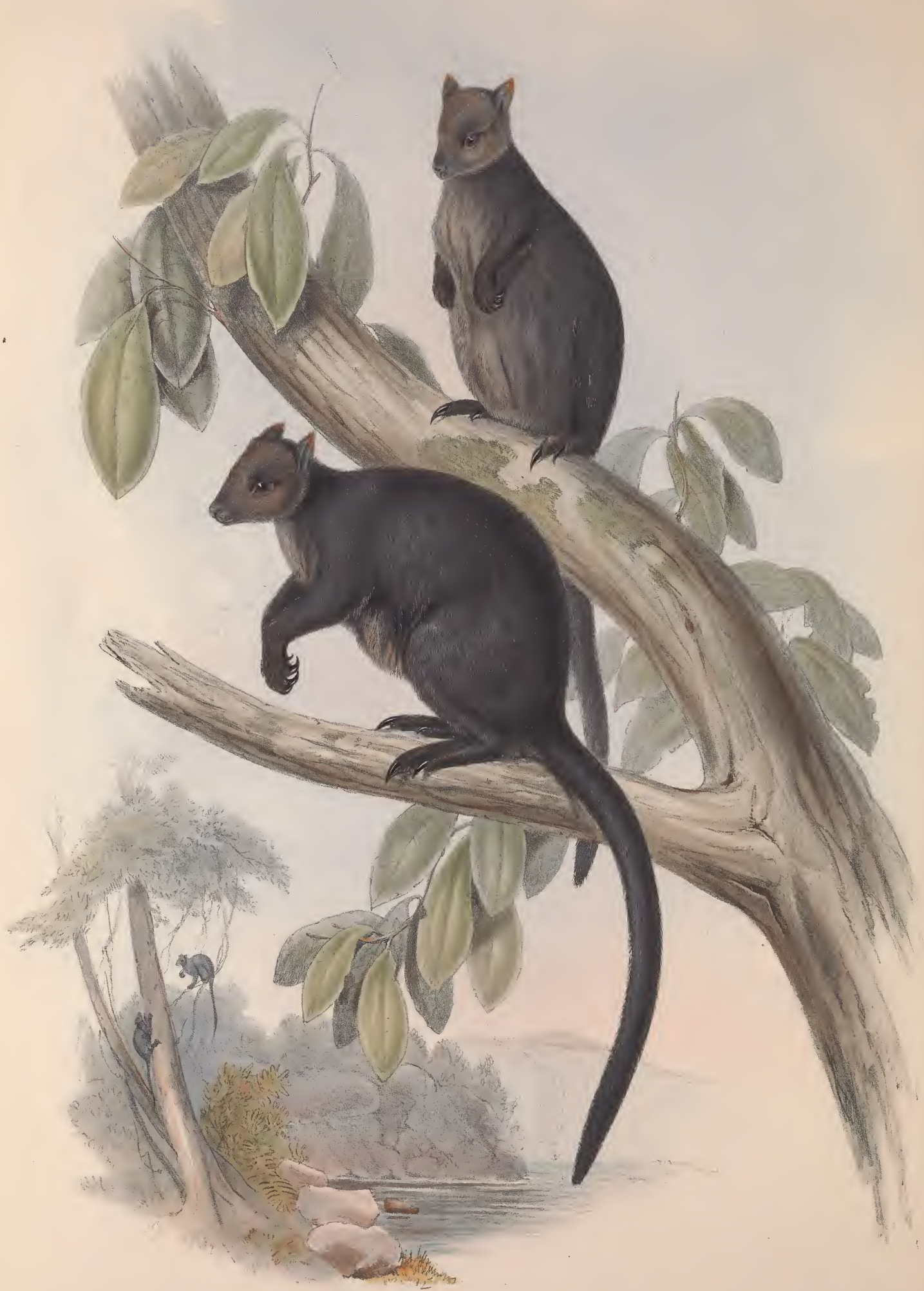
DENDROLAGUS URSINUS. Witt.