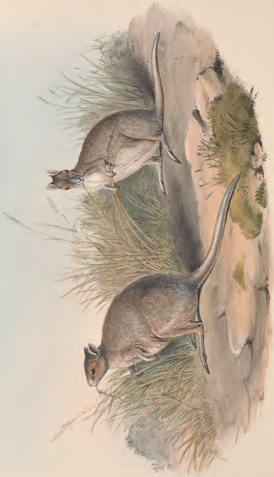
LAGORCHESTES CONSPICILLATA: Gould