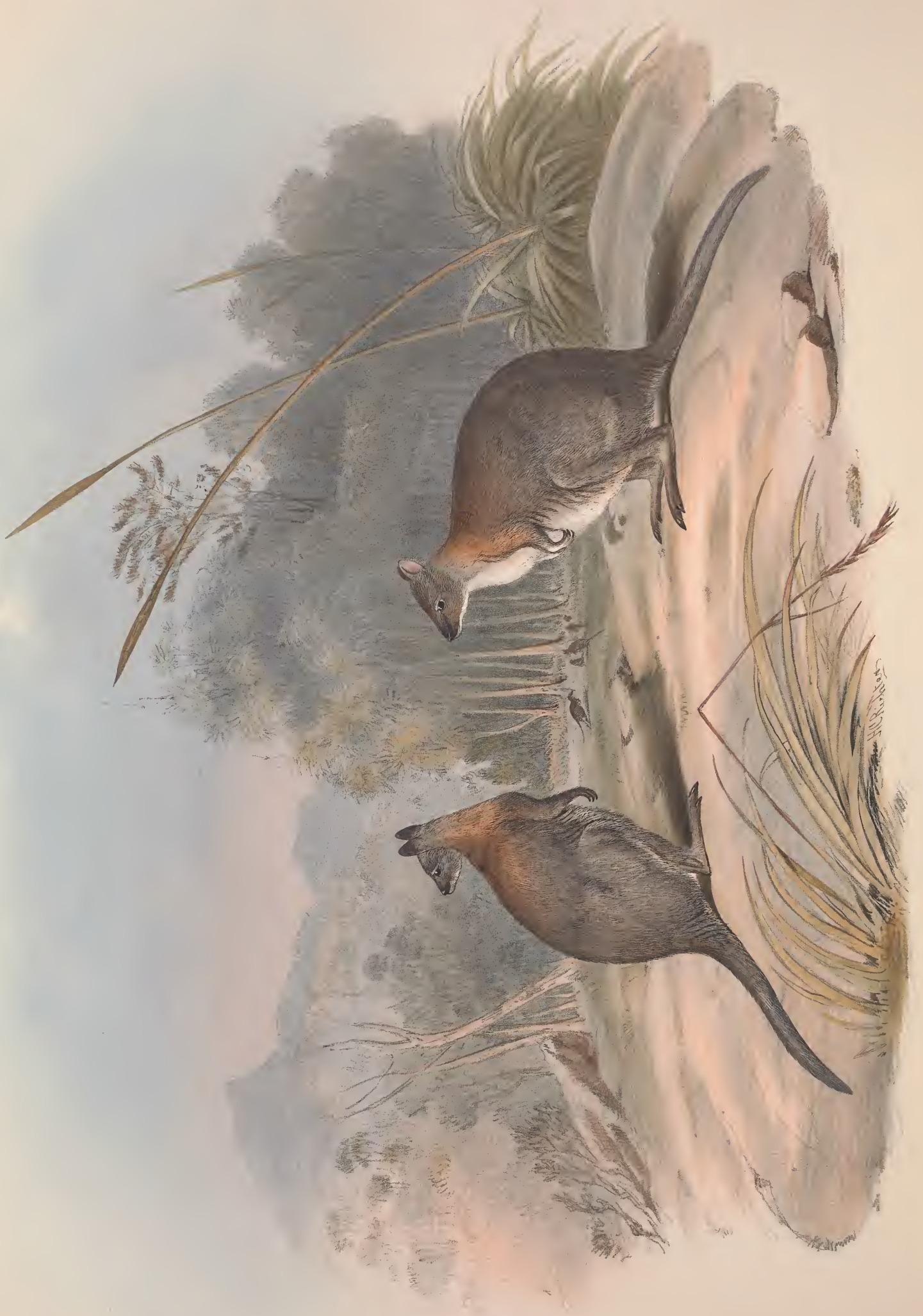
MACGILLIVRAY'S WALLABY: Macgillivrayia