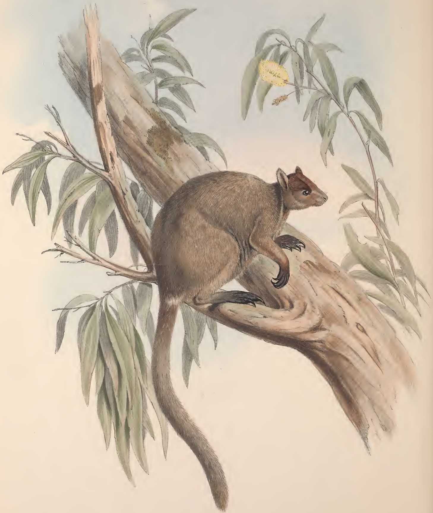
SCIENTIFIC ILLUSTRATION OF A SQUIRREL