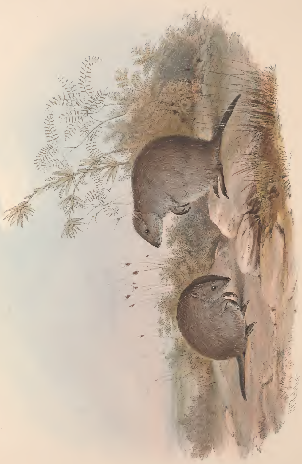
HYPSIPRYMNUS GILBERTI, Gould