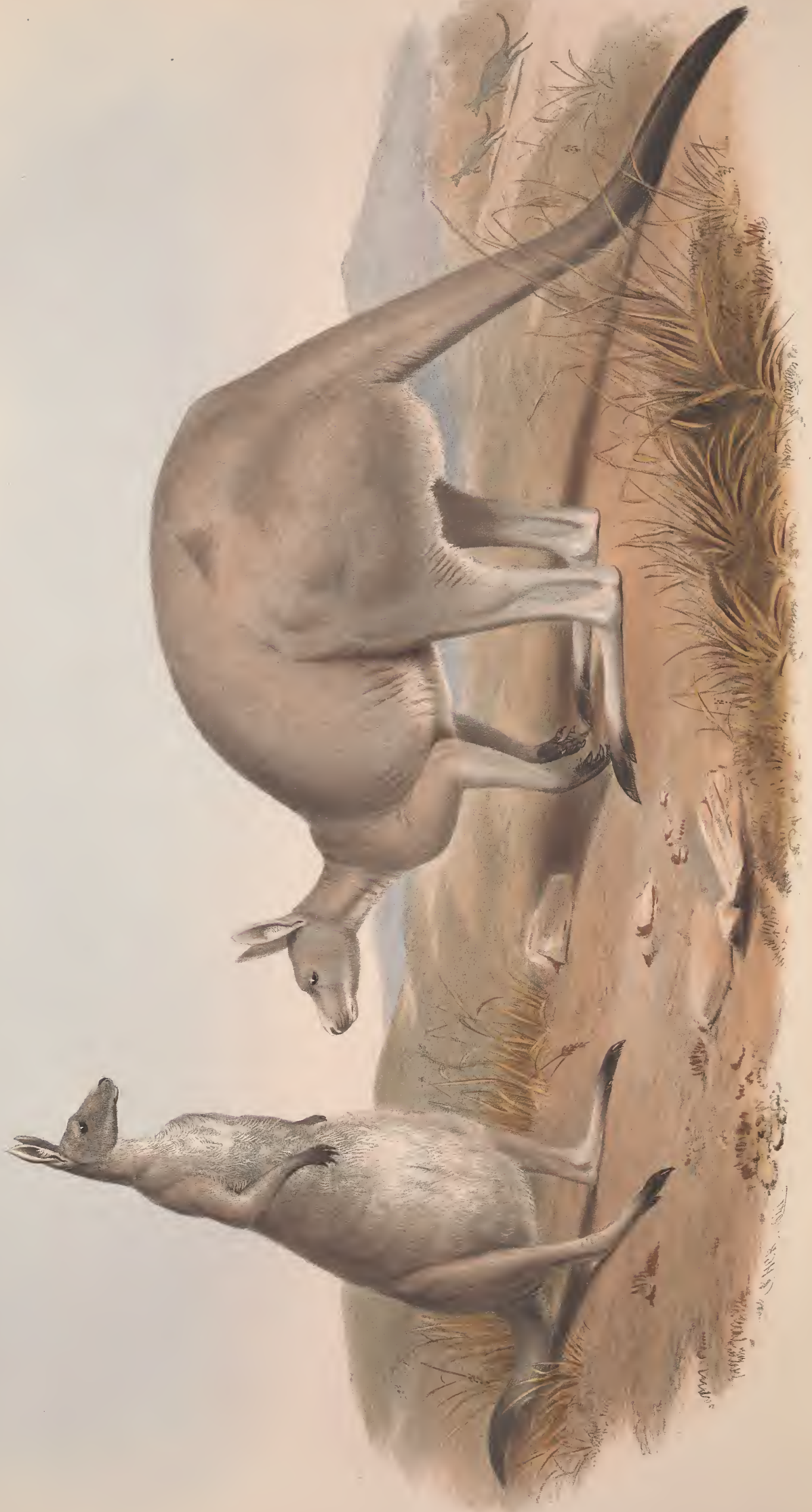
MACROPTUS MAJOR, Shaw