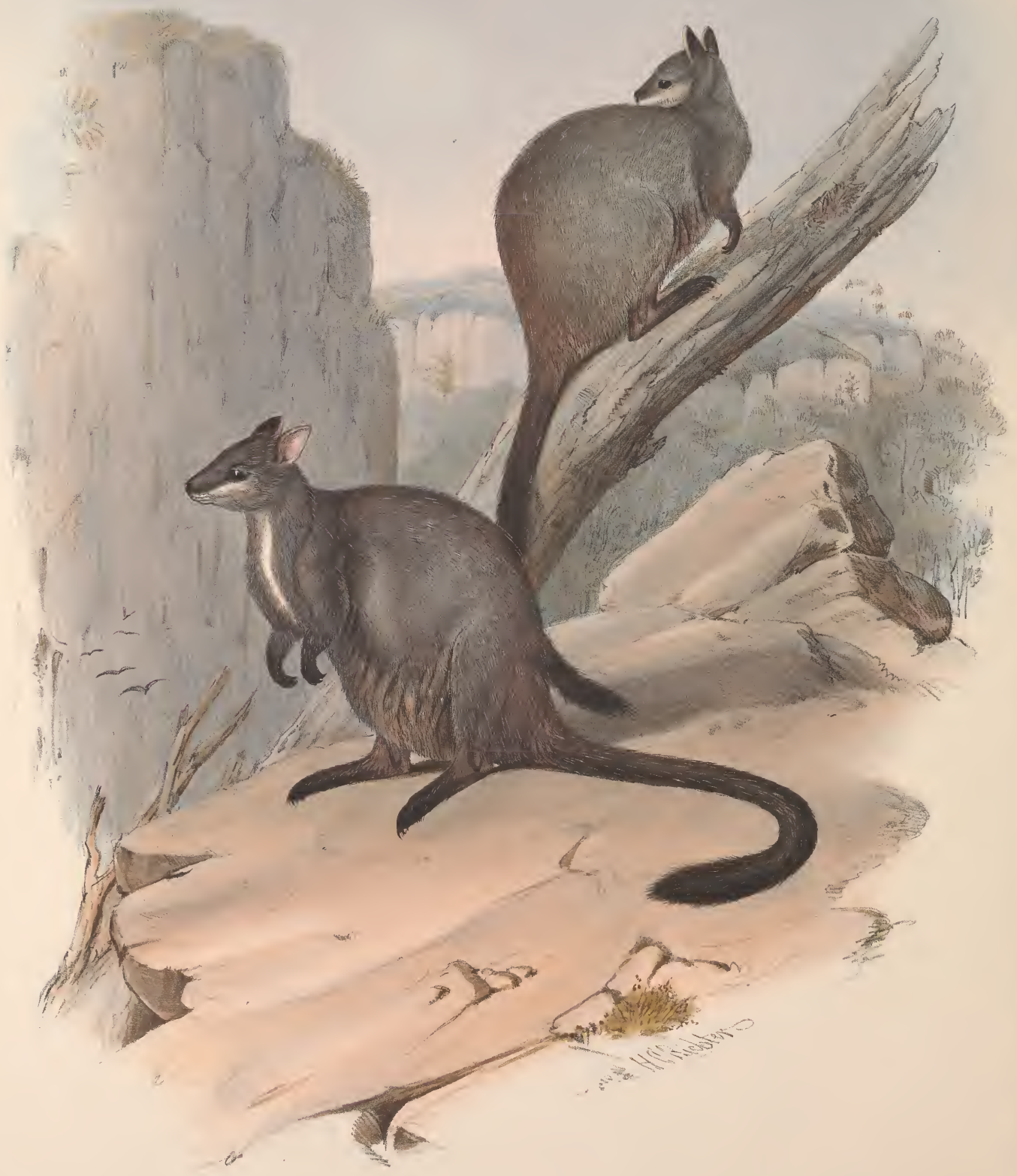
Illustration of Kangaroo and Emu