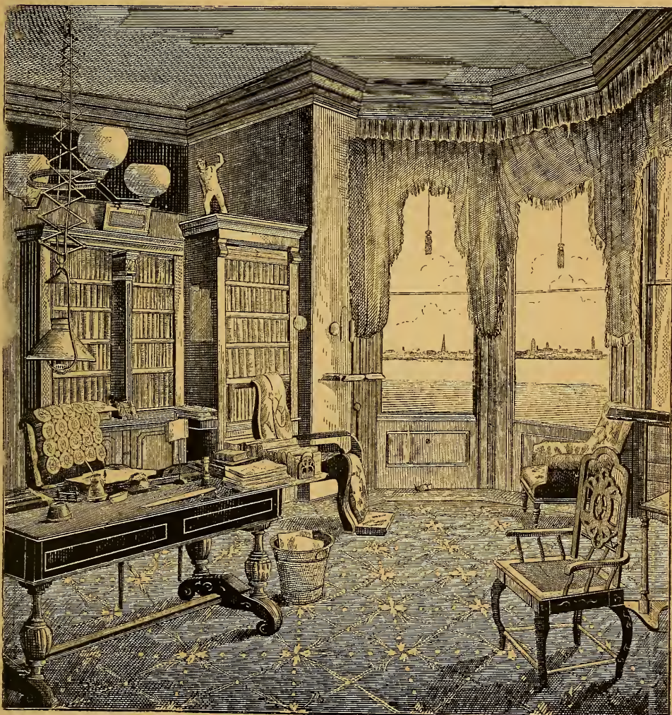
DOCTOR HOLMES' LIBRARY, BEACON STREET.