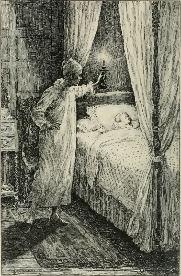
COPYRIGHT, 1903, BY THE UNIVERSITY PRESS