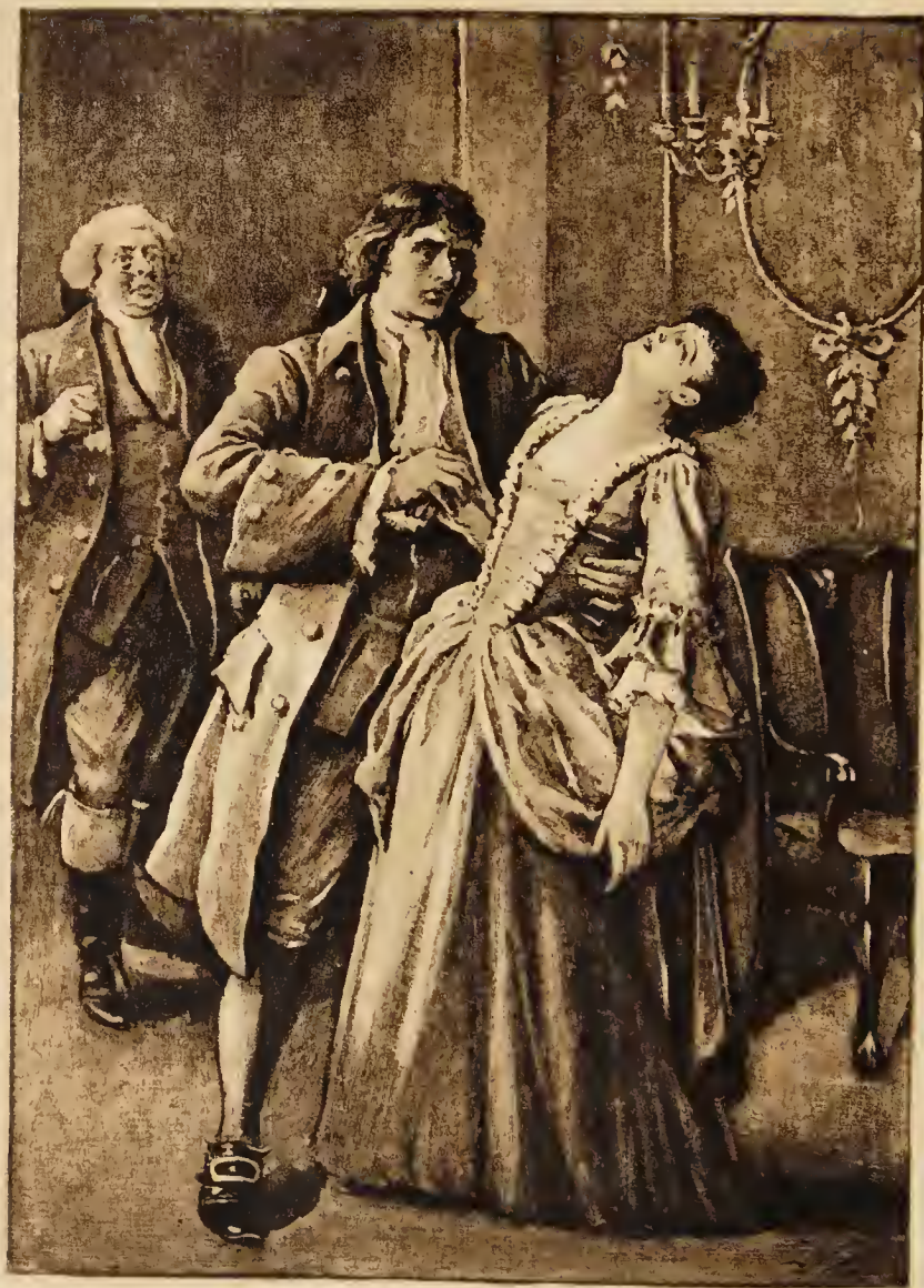
Sophia had fainted away.