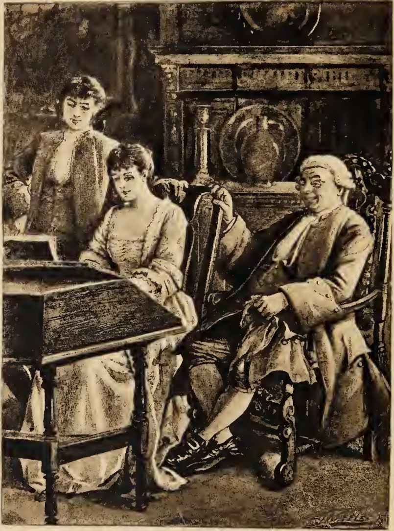
One of her Father's favourite tunes.