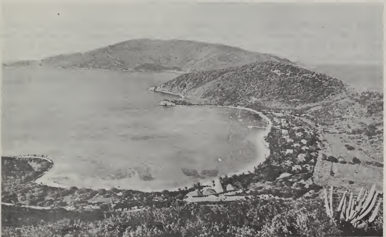
Figure 3. - Virgin Gorda, looking northeast. Little Dix Bay resort in foreground, Gorda Peak in distance.

As noted earlier, Clusia rosea is a characteristic species on the granitoid boulders at the southwest end of Virgin Gorda. Other tree species here are Coccoloba unifera and Chrysobalanus icaco . Near the beach in the Boulder Area are these shrubs and herbs: Caesalpinia crista ,